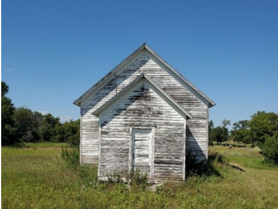
Figure 1: Overview of 32GF3671, view to the north.

Complete one Attachments Section for the entire site/lead/isolated find, including a topographic map, sketch map, photographs, and any other figures.