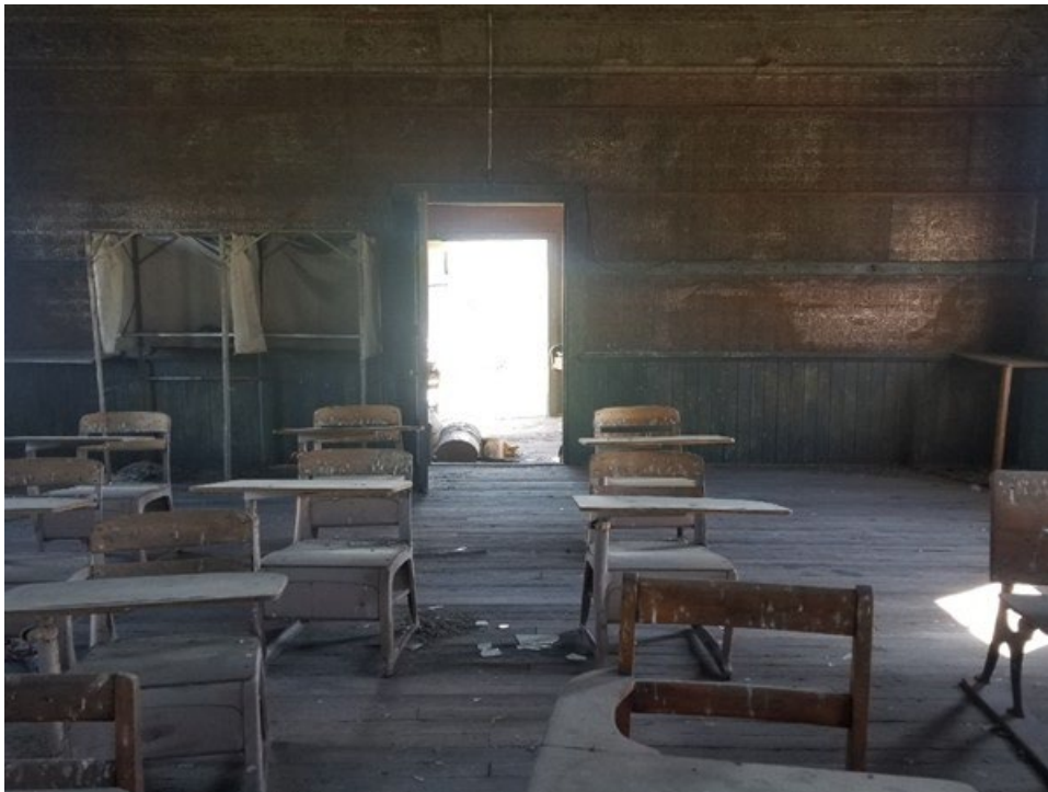
Figure 10: Inside of Schoolhouse, view to the south.