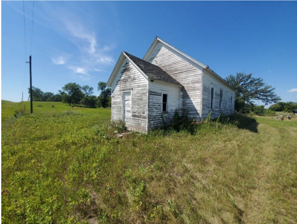
Figure 3: Overview of 32GF3671, view to the northwest.