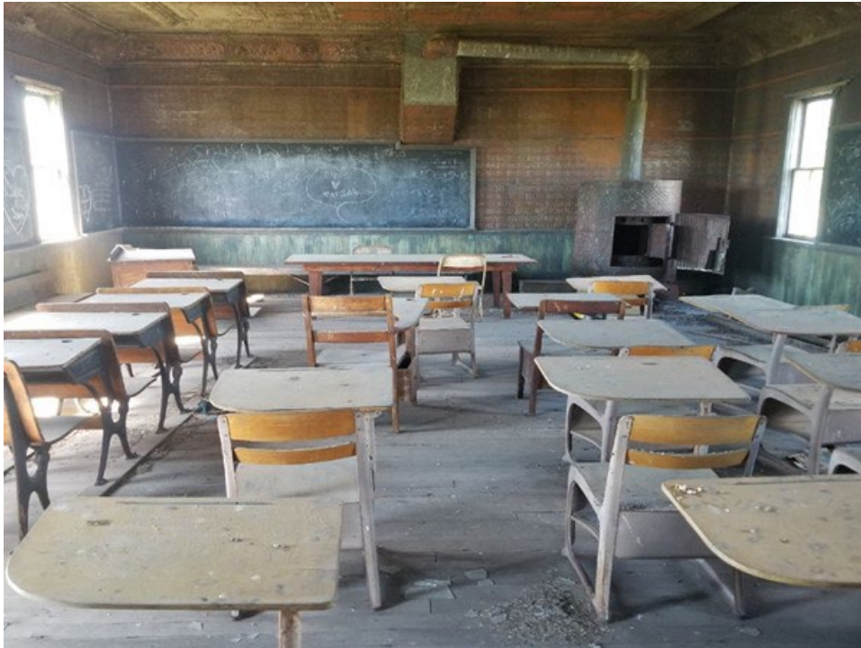
Figure 7: Inside of the schoolhouse from the entryway, view to the north.