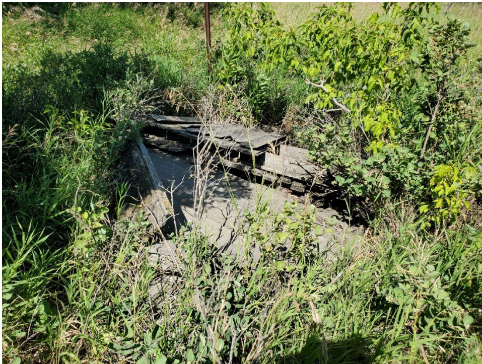
Figure 14: Remains of Outhouse (Feature 3), view to the northeast.

Recorded By: Charles Peliska Date Recorded: 08/02/2023