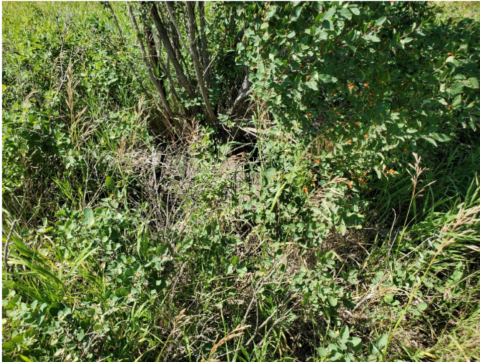
Figure 13: Remains of Outhouse (Feature 2), view to the north.