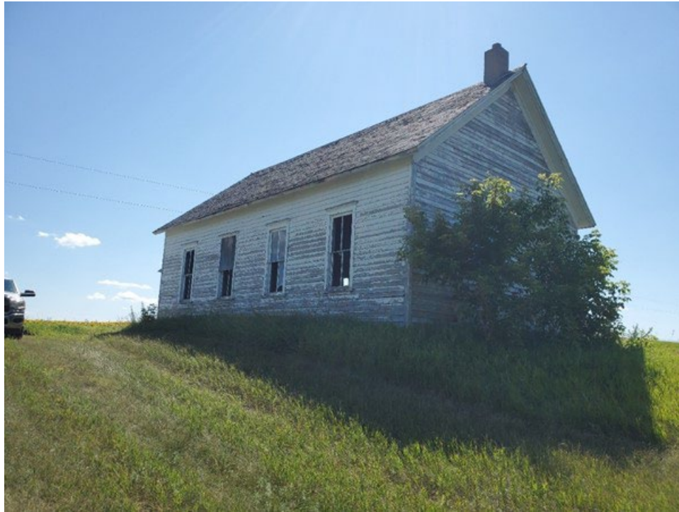
Figure 5: Overview of 32GF3671, view to the southwest.