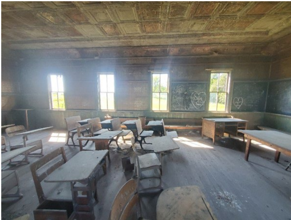
Figure 8: Inside of Schoolhouse, view to the west.