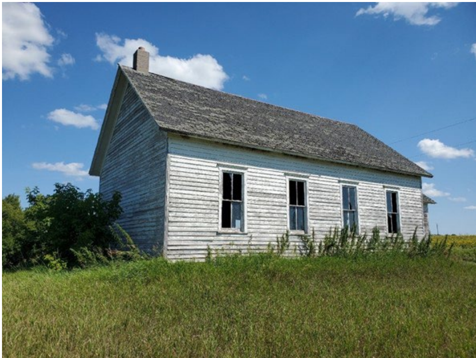
Figure 4: Overview of 32GF3671, view to the southeast.