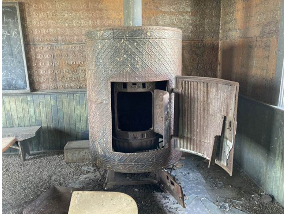
Figure 11: Furnace in northeast corner of Schoolhouse.