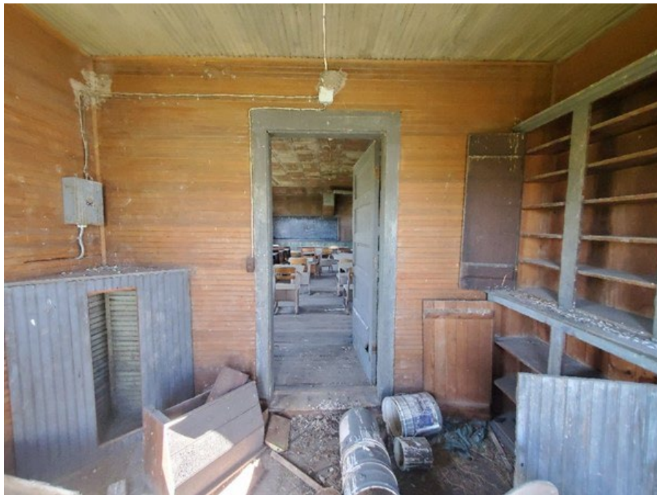
Figure 6: Inside of the entryway, view to the north.