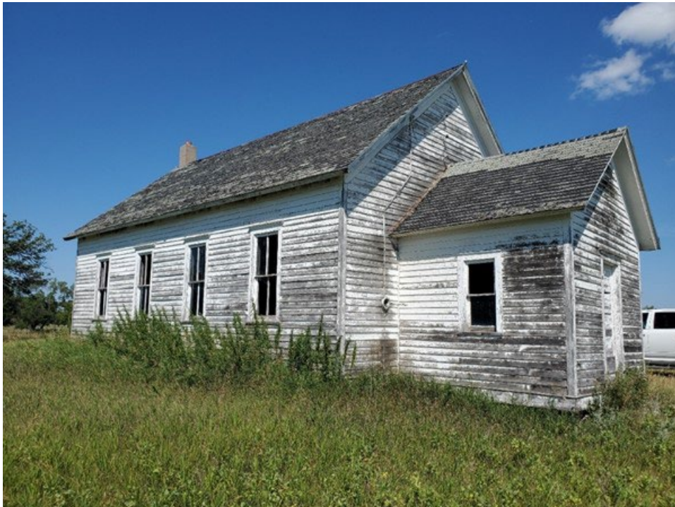
Figure 2: Overview of 32GF3671, view to the northeast.