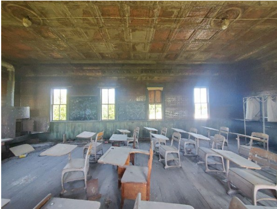
Figure 9: Inside of Schoolhouse, view to the east.