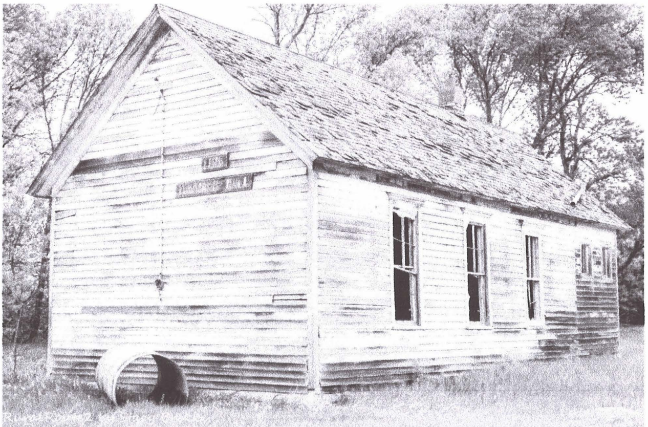
South Side (SW corner)