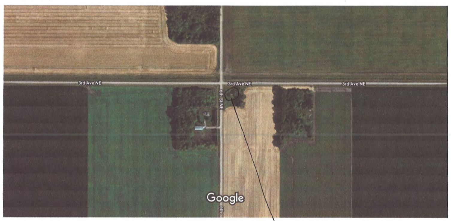
Imagery ©2019 Google, Map data ©2019 Google 200 ft