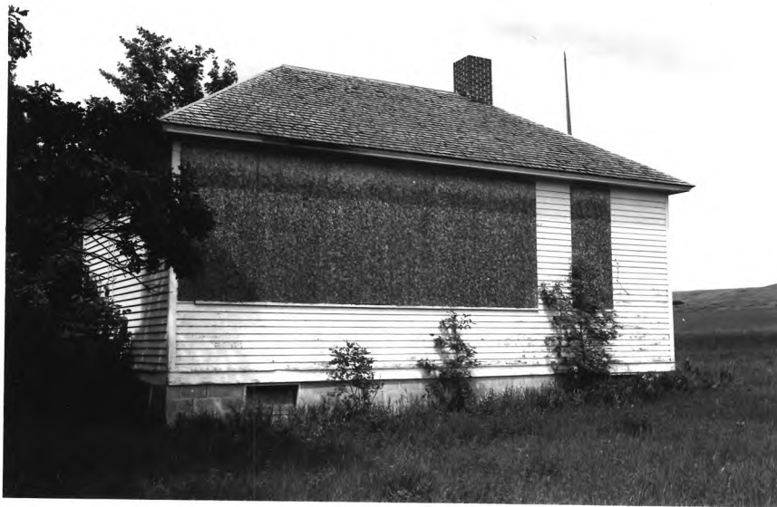
UND 35 Oak Grove School