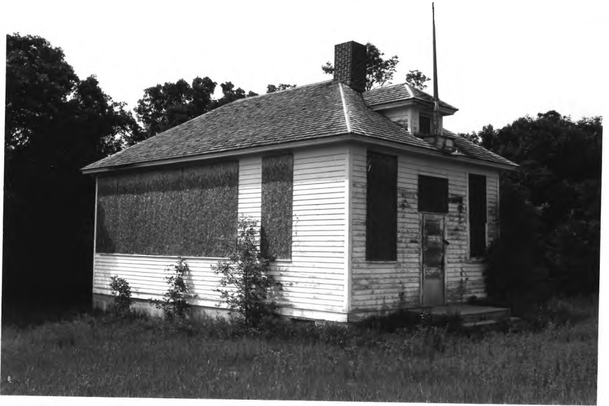
UND 35 Oak Grove School

Storage Location: UND Dept. of Anthropology