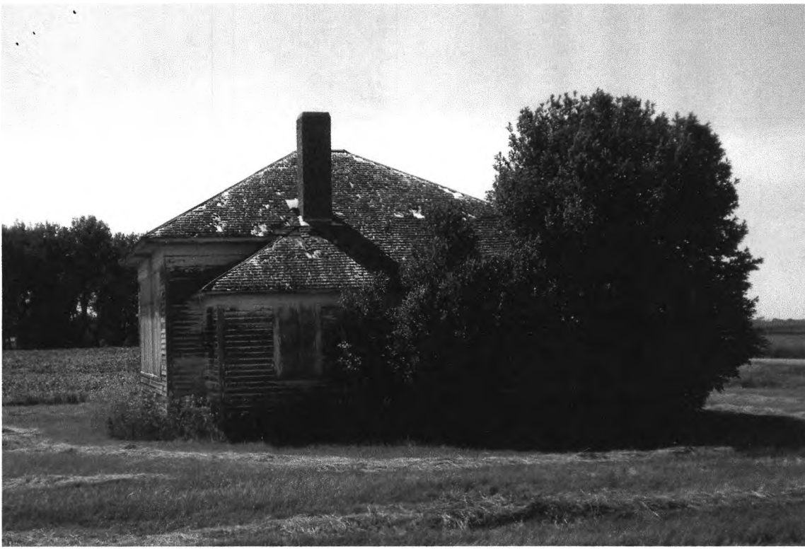
East Side (only sort of view of the South Side)