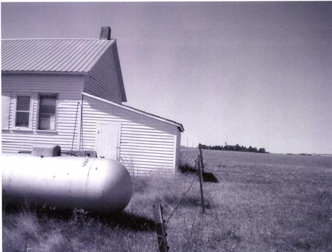
Leipzig School North Side 8/26/2012 Kathy Wilner GT