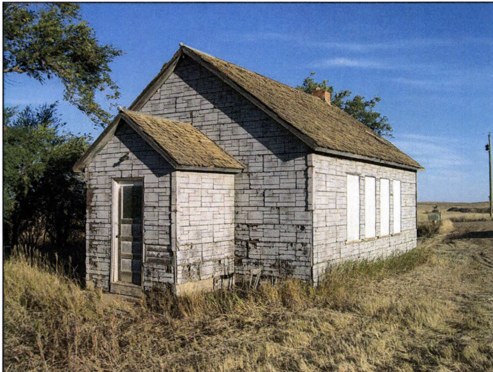
Figure 6: Overview of site KLJ-GOV-201, view to the northwest.