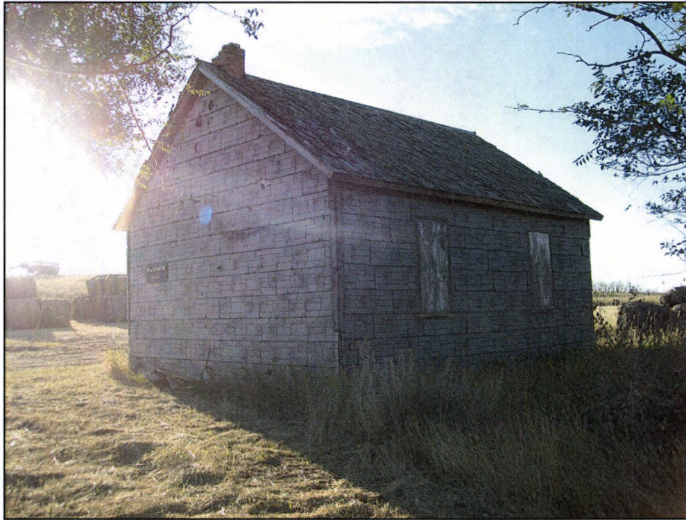
Figure 5: Overview of site KLJ-GOV-201, view to the southeast.