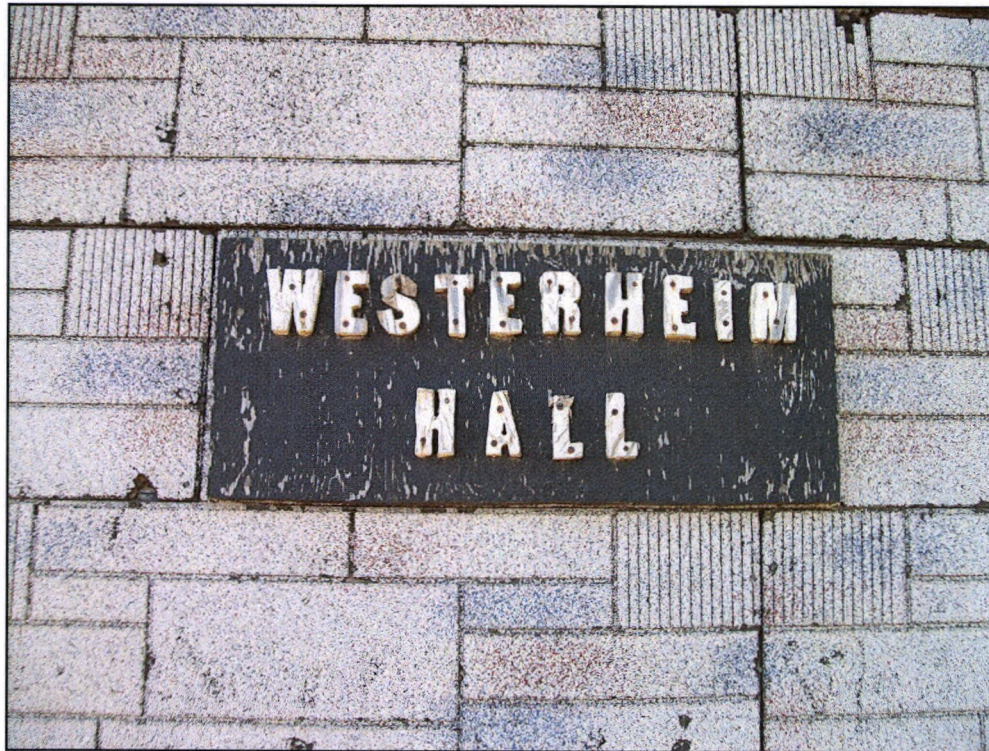
Figure 7: Overview of the marker at site KLJ-GOV-201, view to the south.