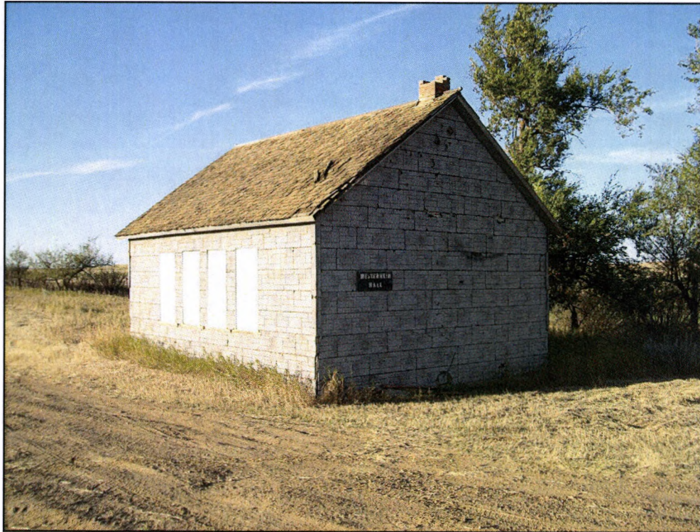
Figure 3: Overview of site KLJ-GOV-201, view to the southwest.