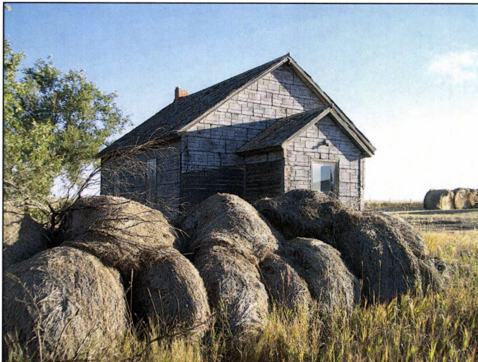
Figure 4: Overview of site KLJ-GOV-201, view to the northeast.