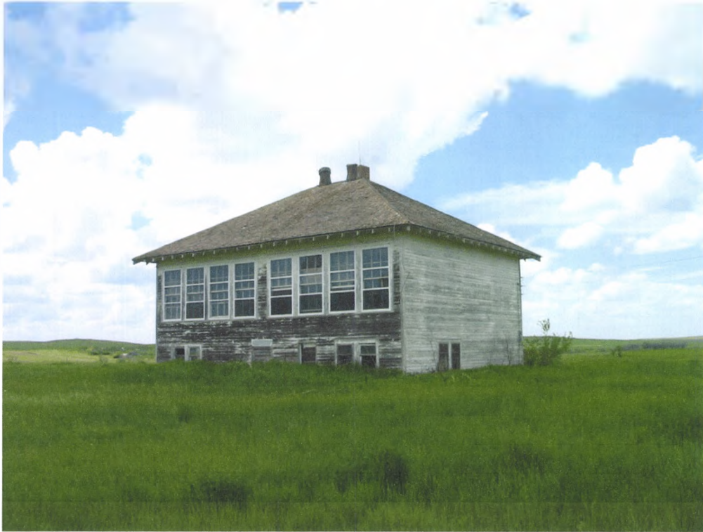
Figure 7: View to the southwest over schoolhouse (Img. 7).