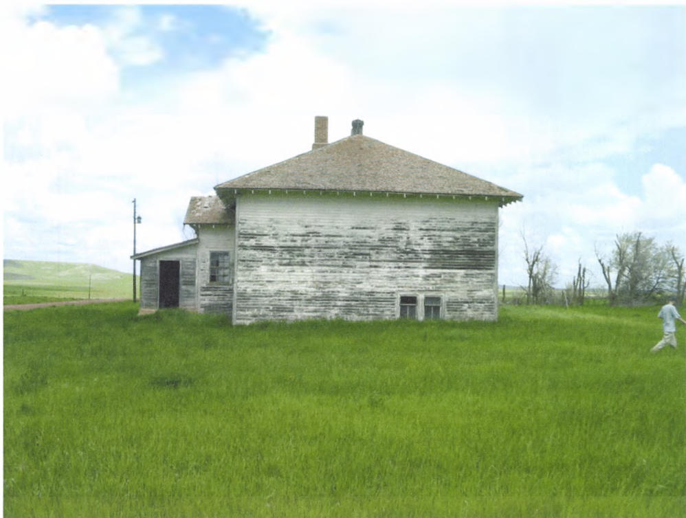
Figure 4: View to the north over schoolhouse (Img.3).