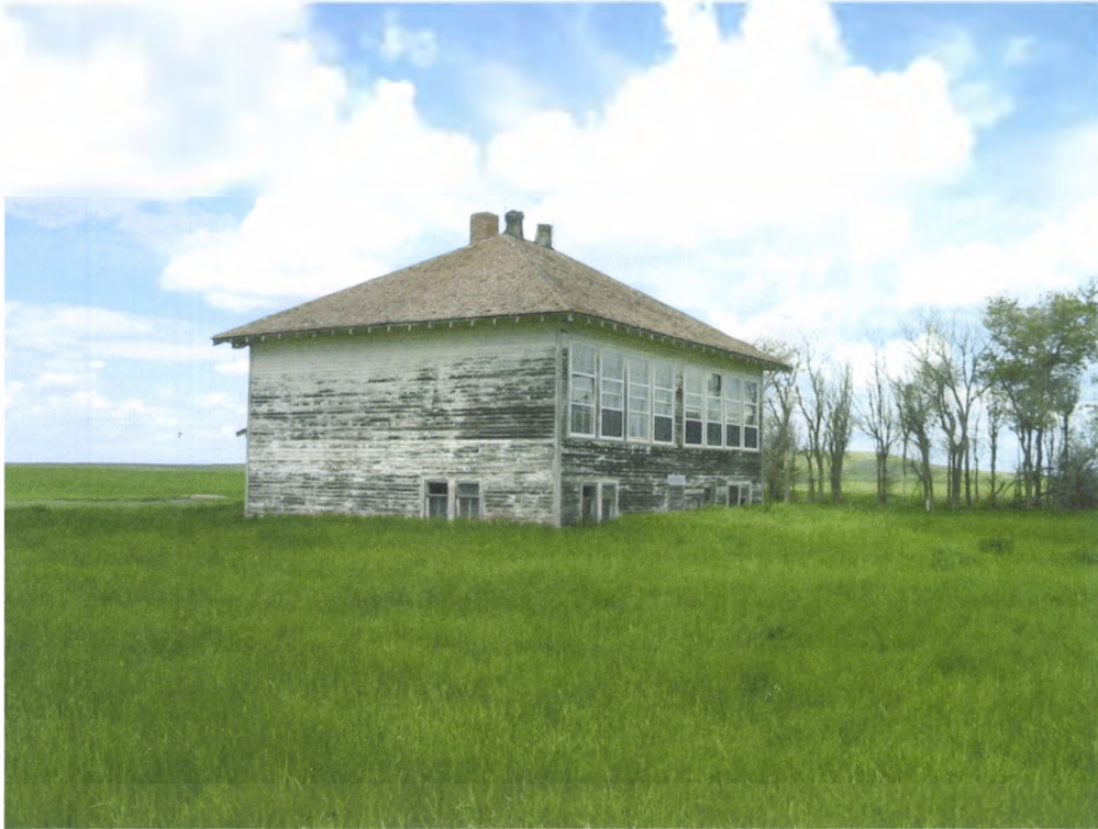
Figure 5: View to the northwest over schoolhouse (Img. 4).