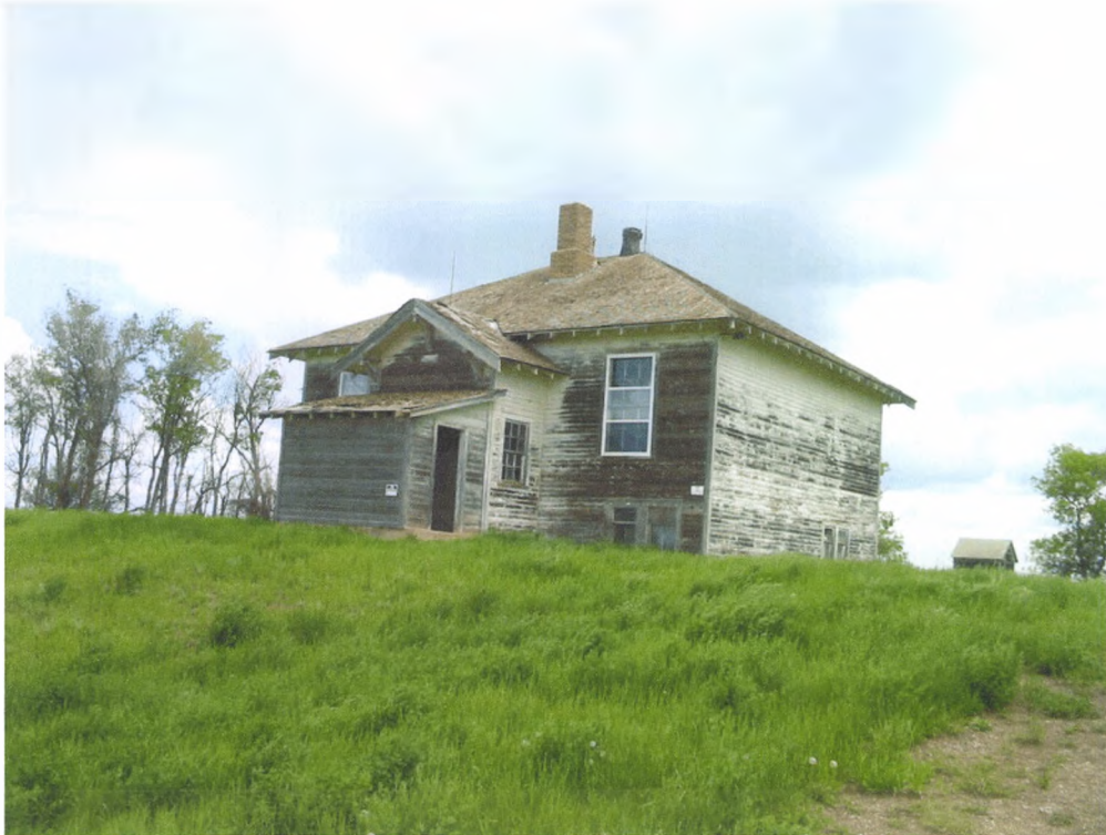
Figure 3: View to the northeast over schoolhouse (Img 2).