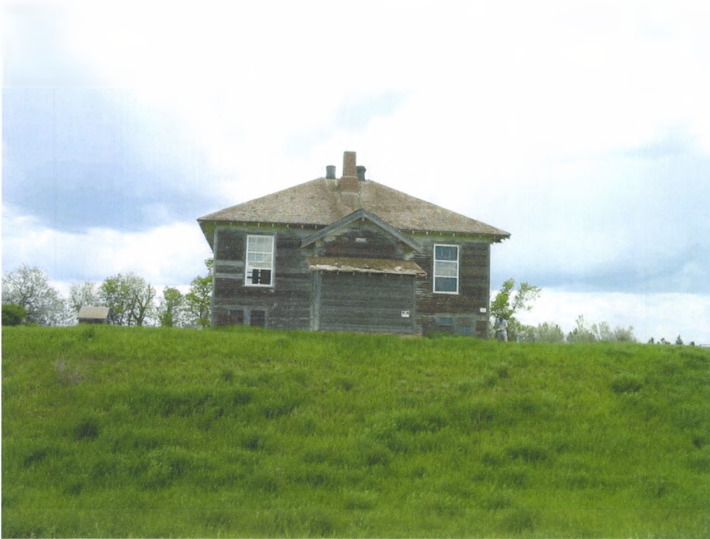
Figure 9: View to the east over schoolhouse (Img. 9).