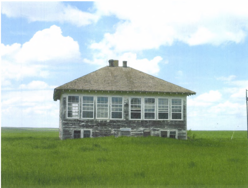
Figure 6: View to the west over schoolhouse (Img. 6).