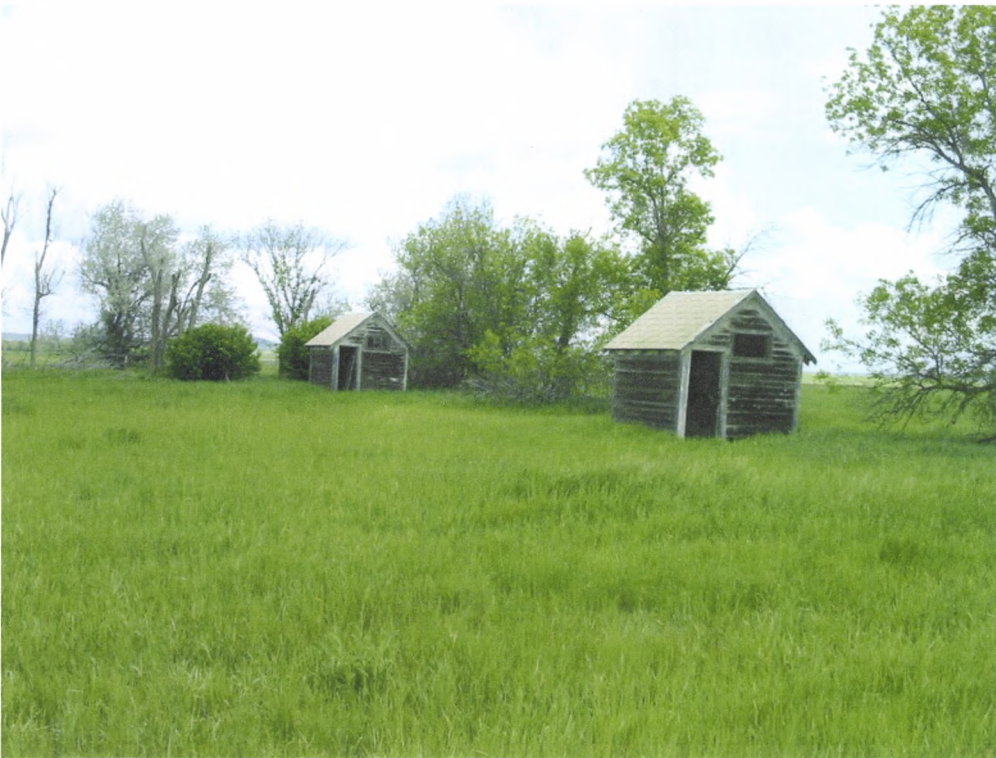
Figure 10: View to the north-northeast over privies (Img. 5).