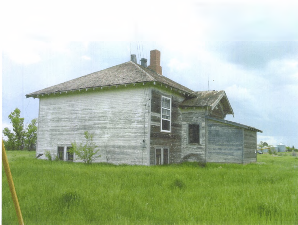
Figure 8: View to the southeast over schoolhouse (Img. 8).