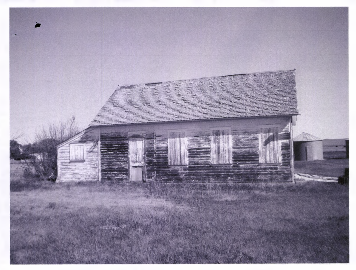
Burt School South Side 8/26/2012 Kathy Wilner HT

Burt School East Side 8/26/2012 Kathy Wilner HT