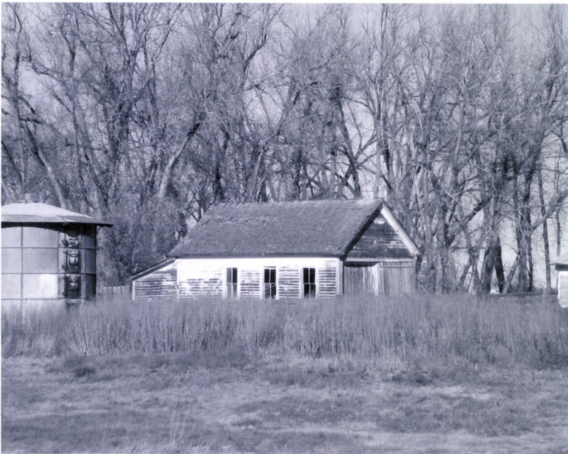
South Side Madison Township School West Side