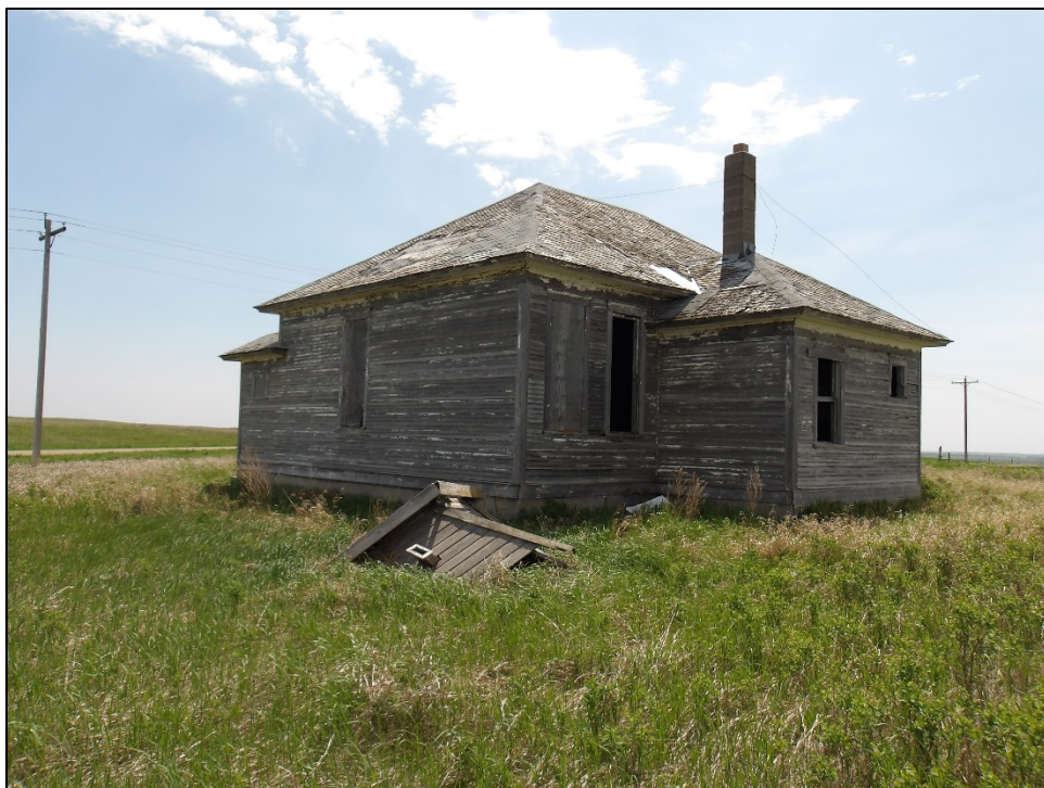
Figure 5: Feature 1, north and west elevations, view southeast. Note Feature 2 in foreground (MJ1_17, 5/27/2023).