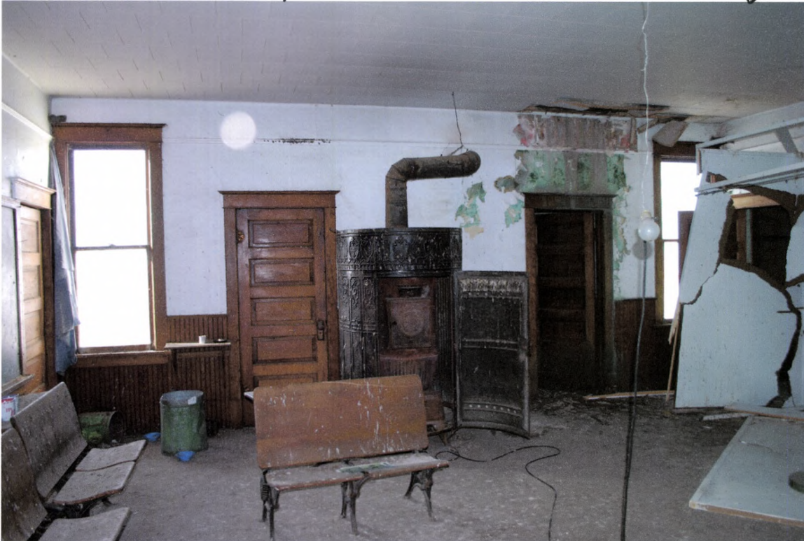
Feature 1 interior west wall ↓