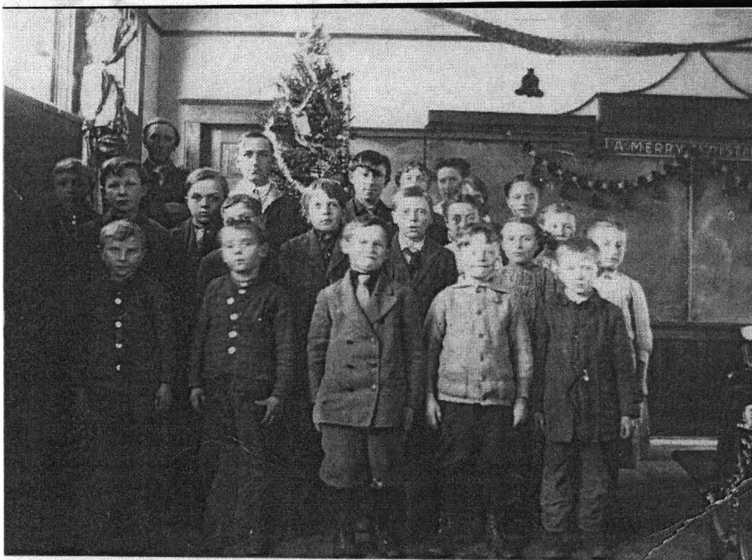
Feature 1 inside northeast corner, ca 1905

Recorded By Lorna Meidinger (First Name & Last Name)