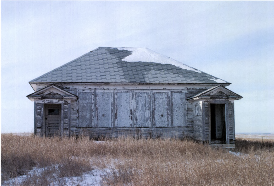
Feature 1 east ↗