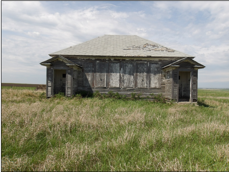
Figure 2: Feature 1, east elevation, view west (MJ1_8, 5/27/2023).