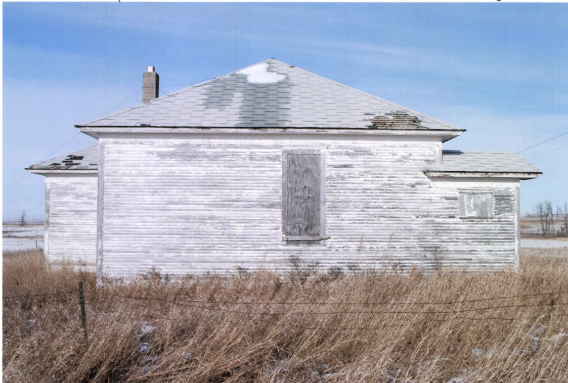
Feature 1 south ↓

Recorded By Lorna Meidinger (First Name & Last Name)