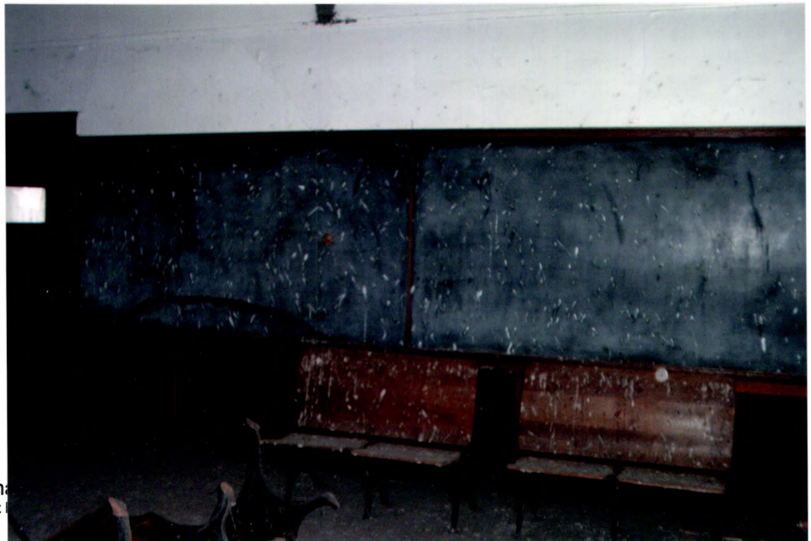
Recorded By Lorna (First