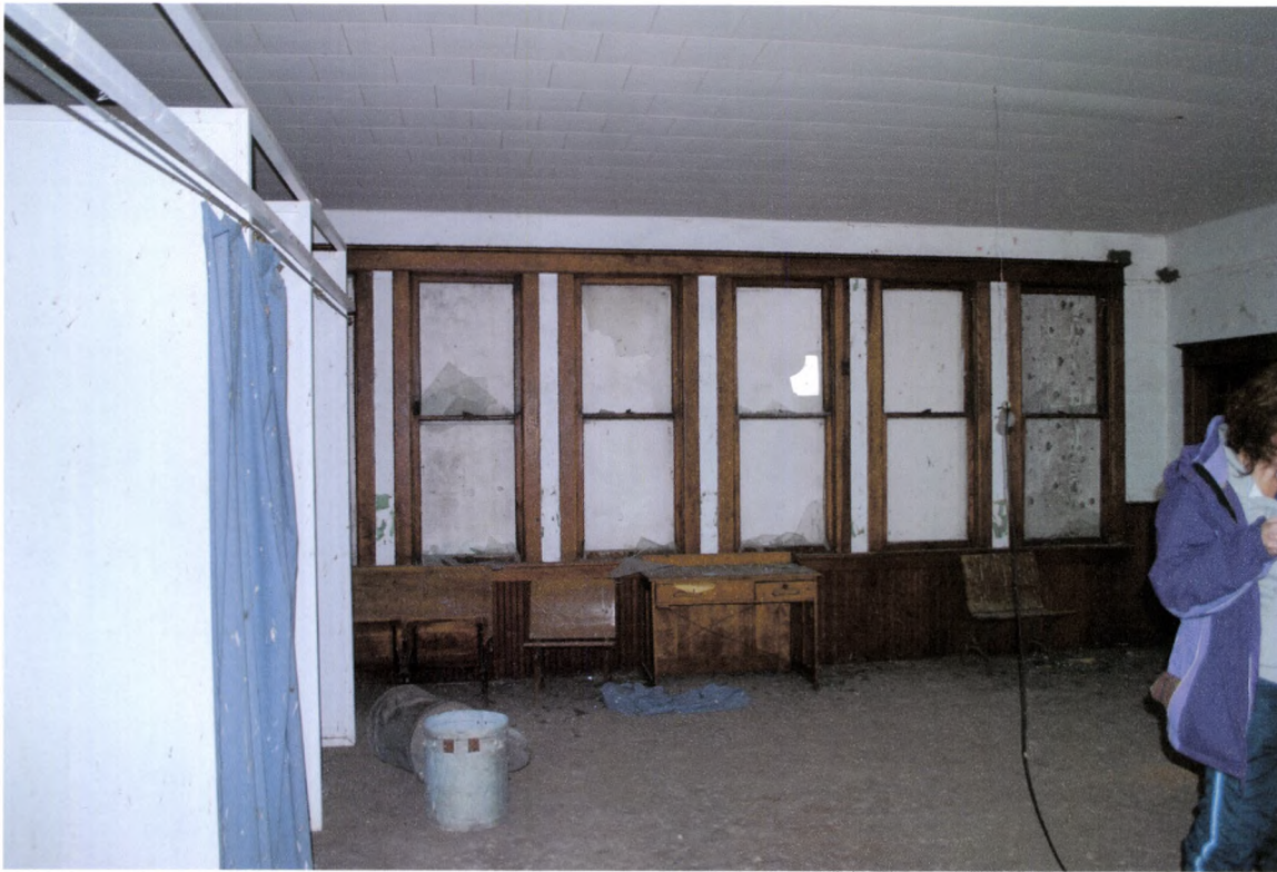
Feature 1 interior east wall ↑