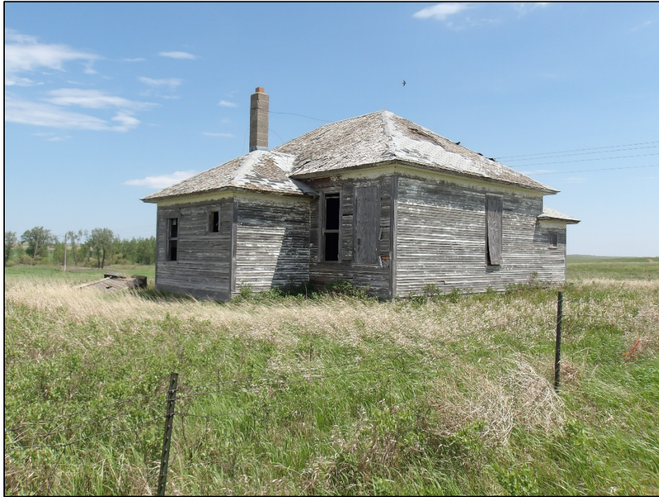
Figure 4: Feature 1, west and south elevations, view northeast (MJ1_13, 5/27/2023).