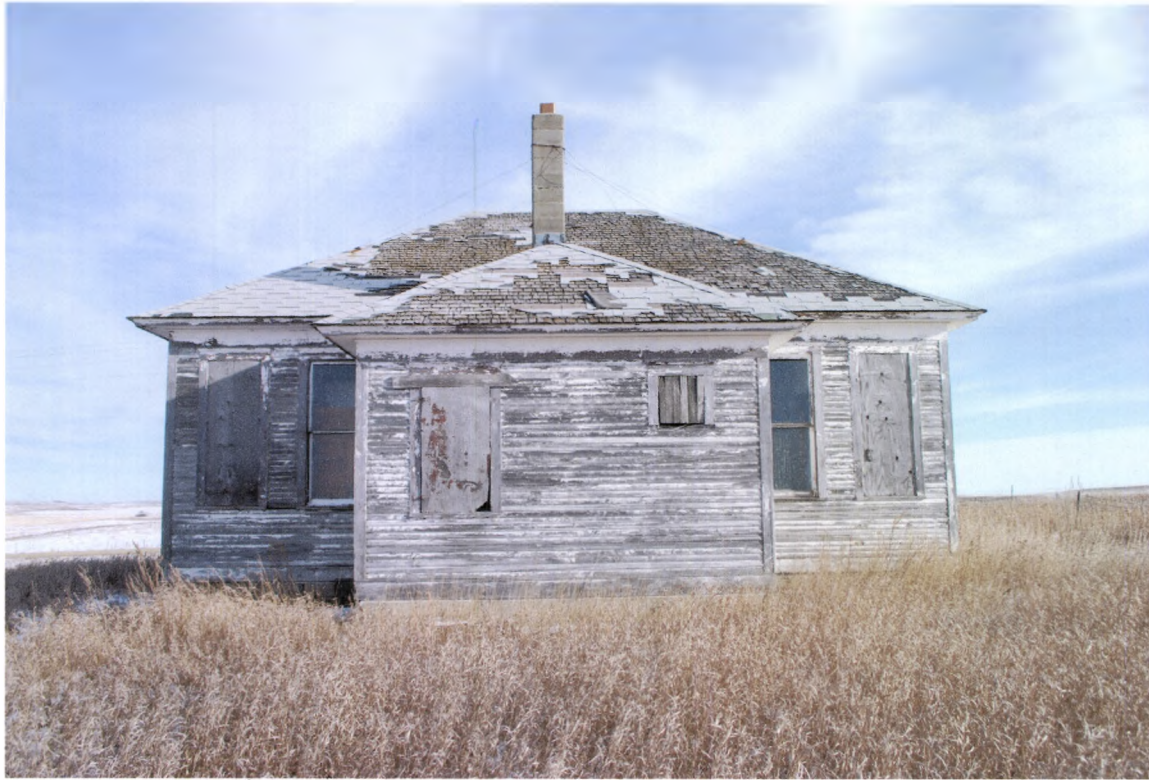
Feature 1 west ↑