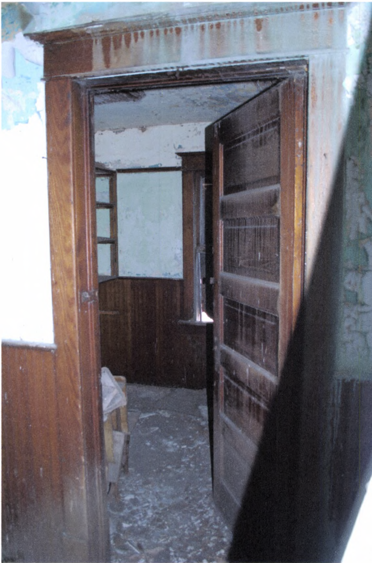
Feature 1 into library ↑ F1 interior south wall ↓