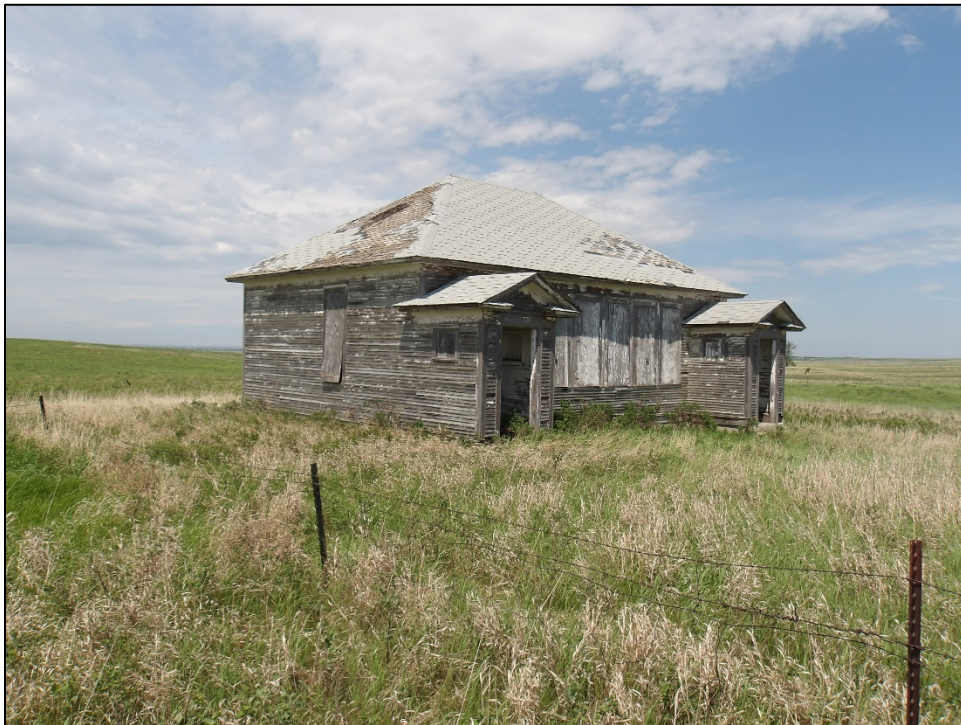
Figure 3: Feature 1, south and east elevations, view northwest (MJ1_9, 5/27/2023).