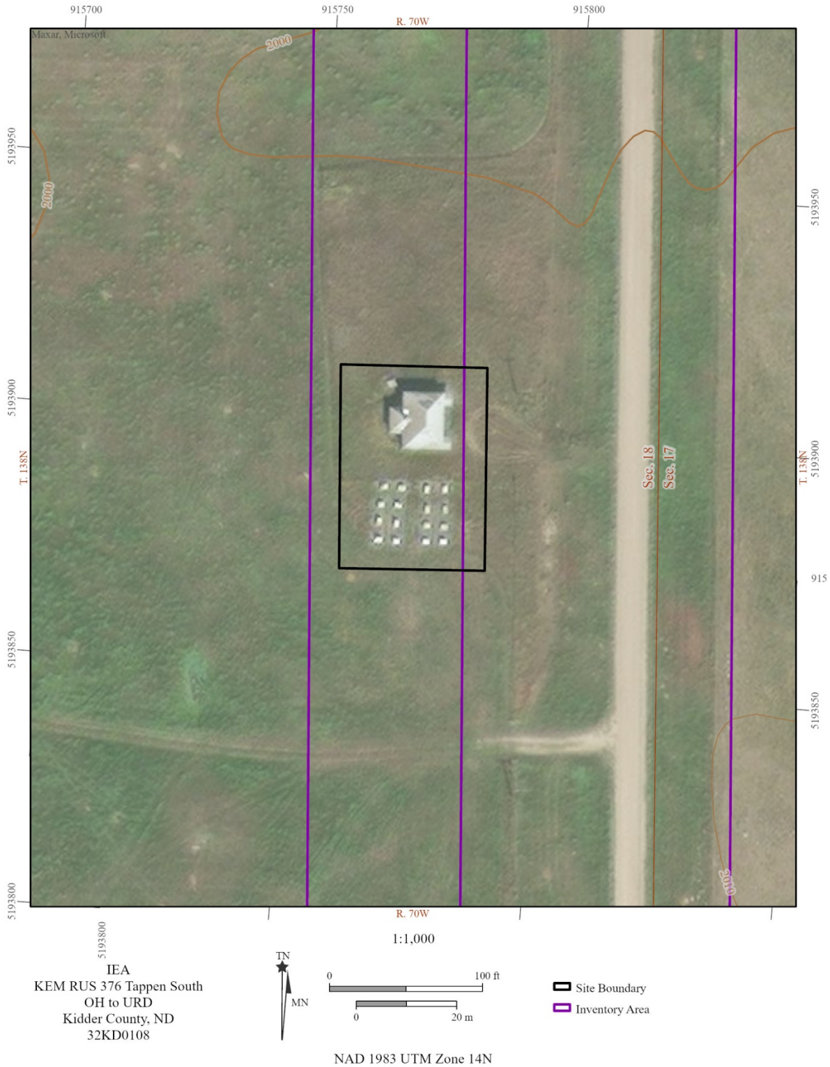
Figure 1: Site boundary depicted on aerial imagery.