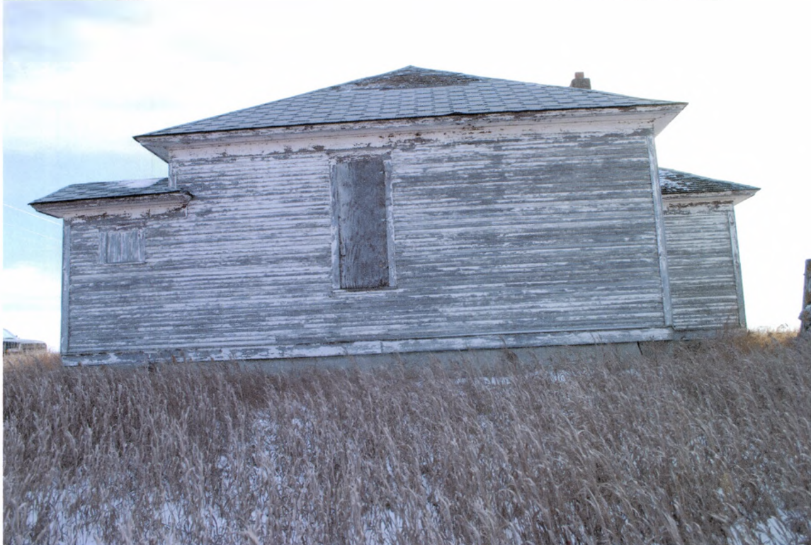
Feature 1 north ↓

Recorded By Lorna Meidinger (First Name & Last Name)