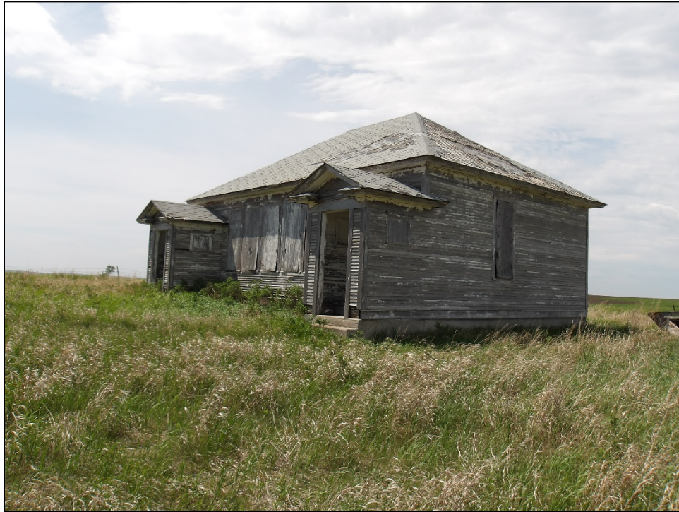
Figure 6: Feature 1, east and north elevations, view southwest (MJ1_21, 5/27/2023).