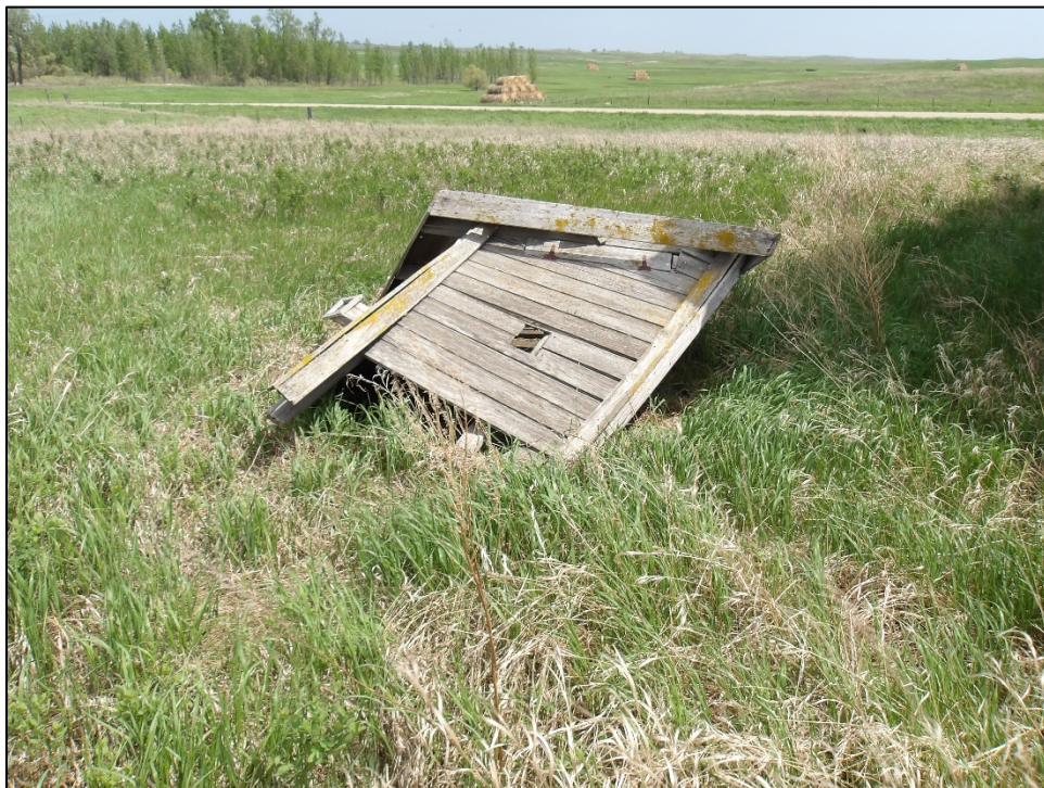
Figure 7: Feature 2, view southeast (MJ1_35, 5/27/2023).