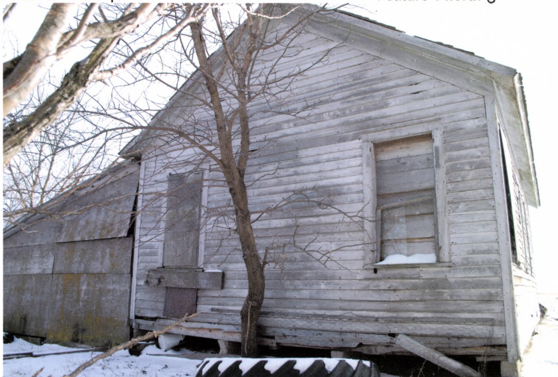
Feature 1 north ↓

Recorded By Lorna Meidinger (First Name & Last Name)