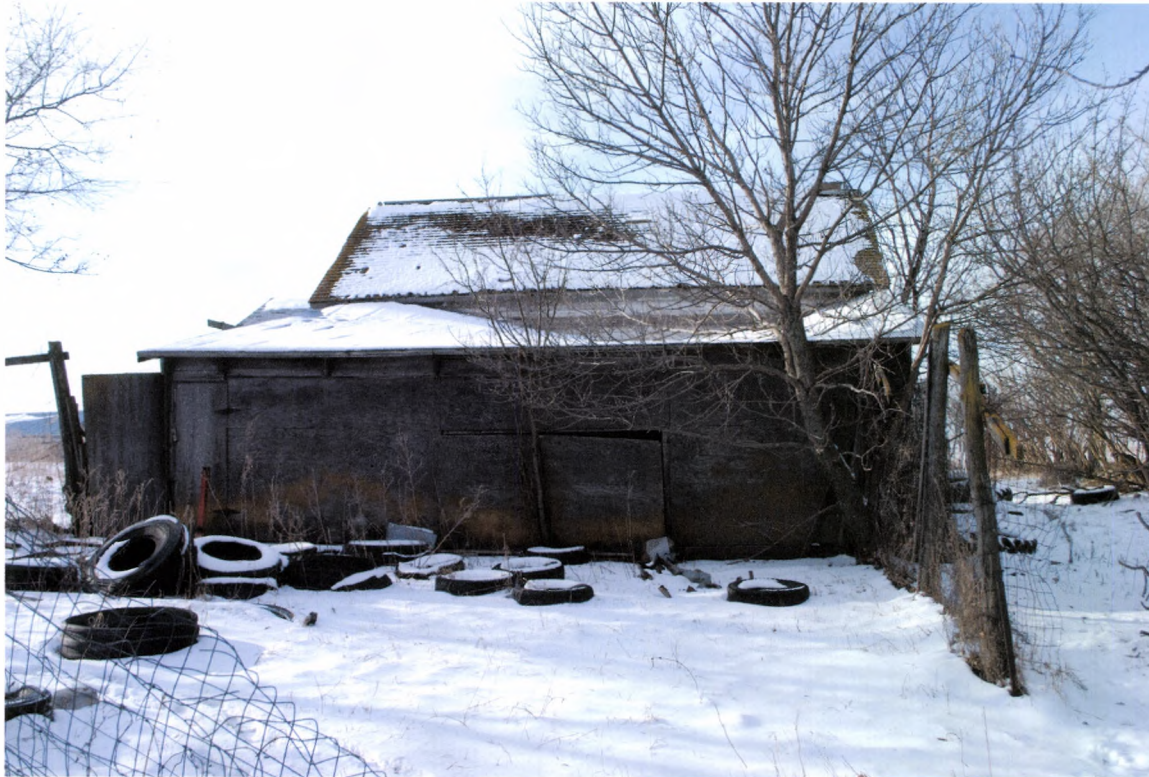
Feature 1 east ↑