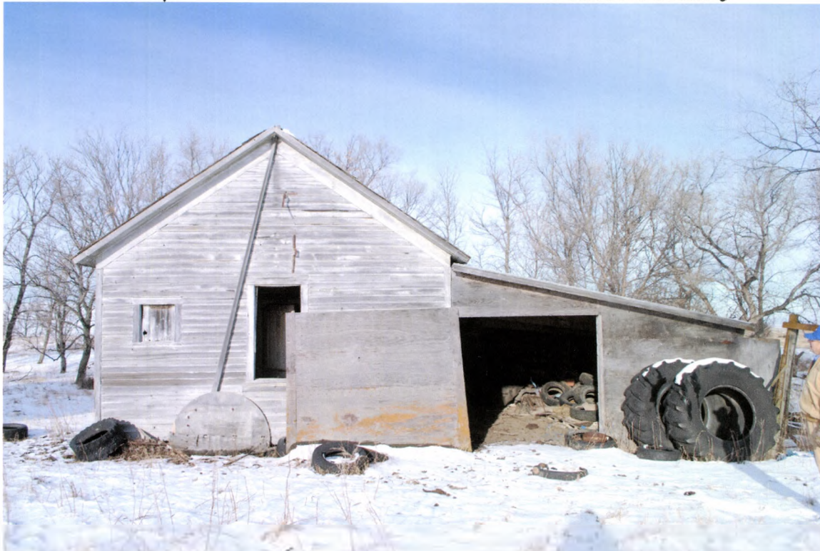
Feature 1 south ↓

Recorded By Lorna Meidinger (First Name & Last Name)