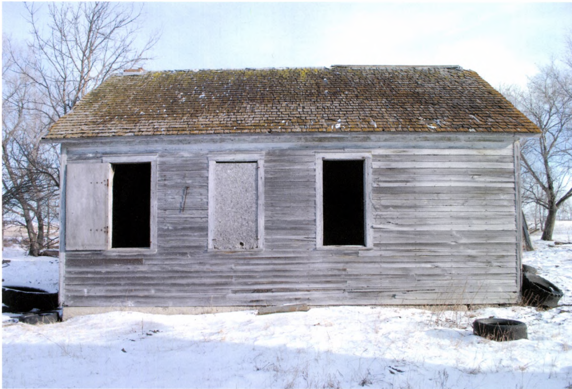
Feature 1 west ↑