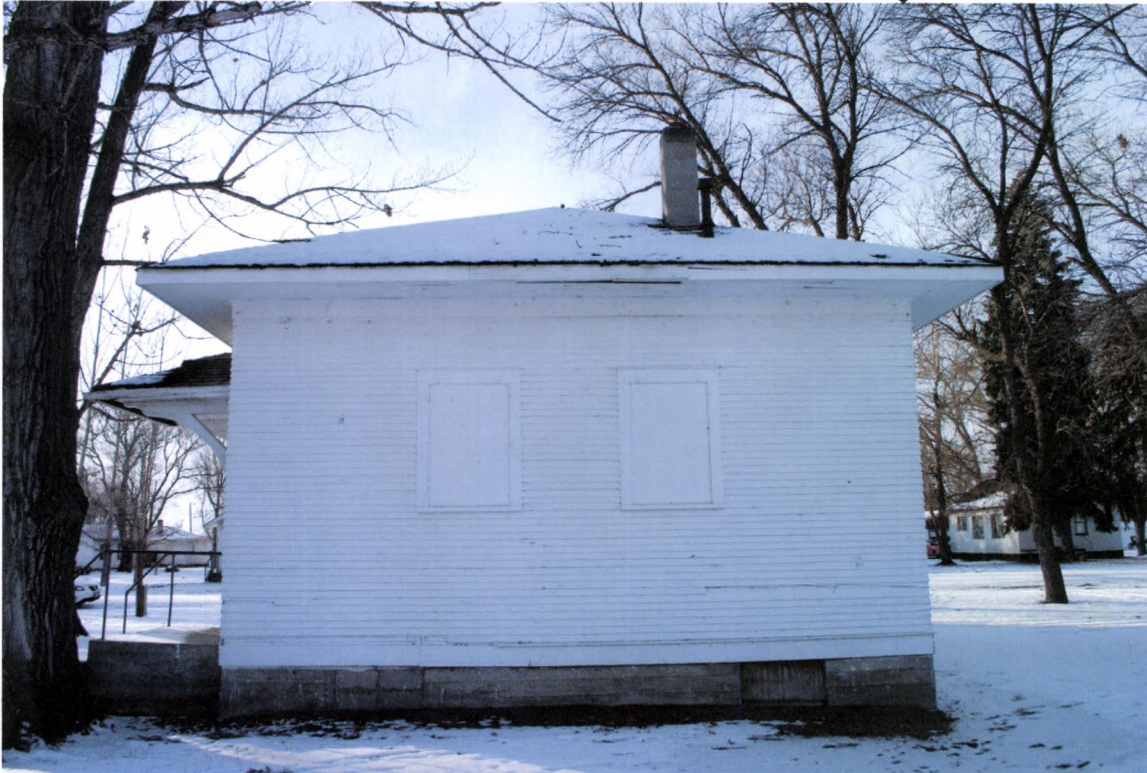
Feature 1 east ↓

Recorded By Lorna Meidinger (First Name & Last Name)