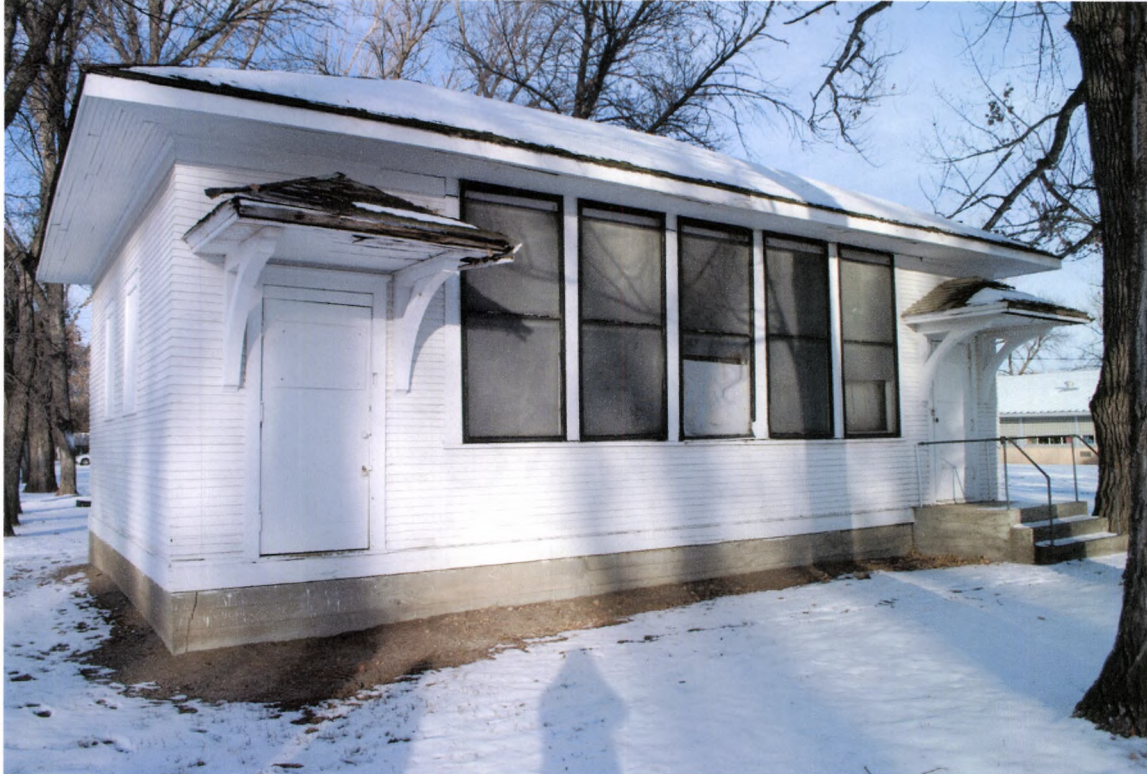
Feature 1 south southwest ↑