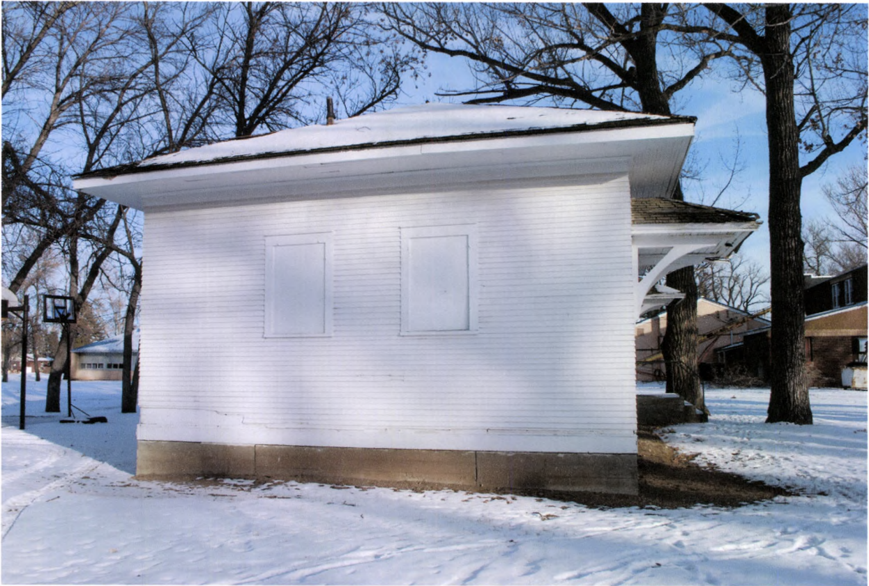
Feature 1 west

Recorded By Lorna Meidinger (First Name & Last Name)