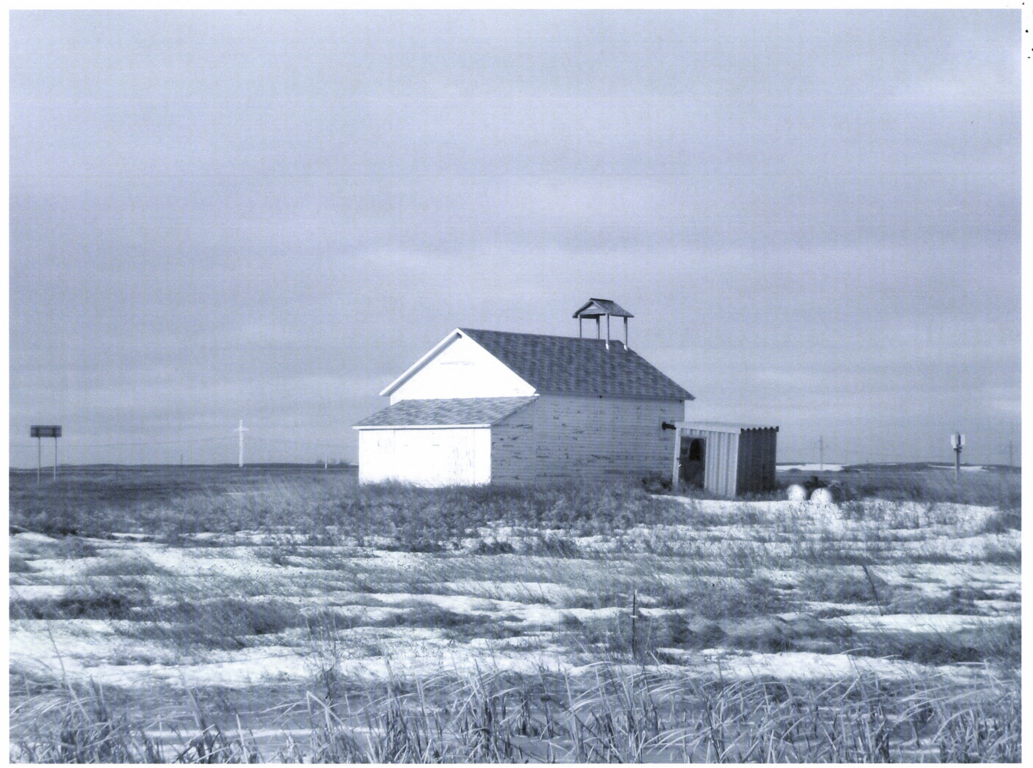
Haynes Twsp. School North