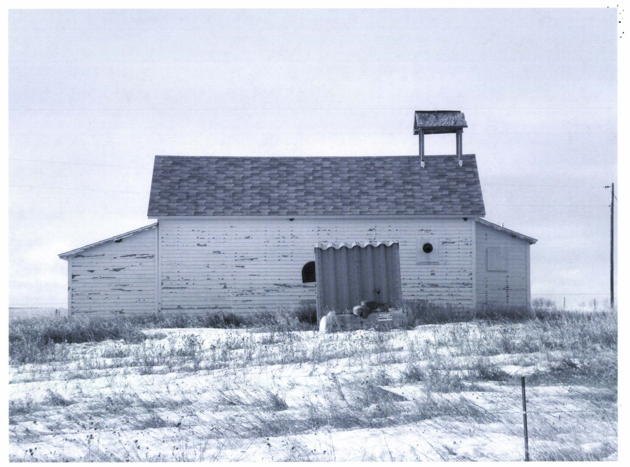
Haynes Township School North 3/22/2010 North Side Kothy Wilner KD