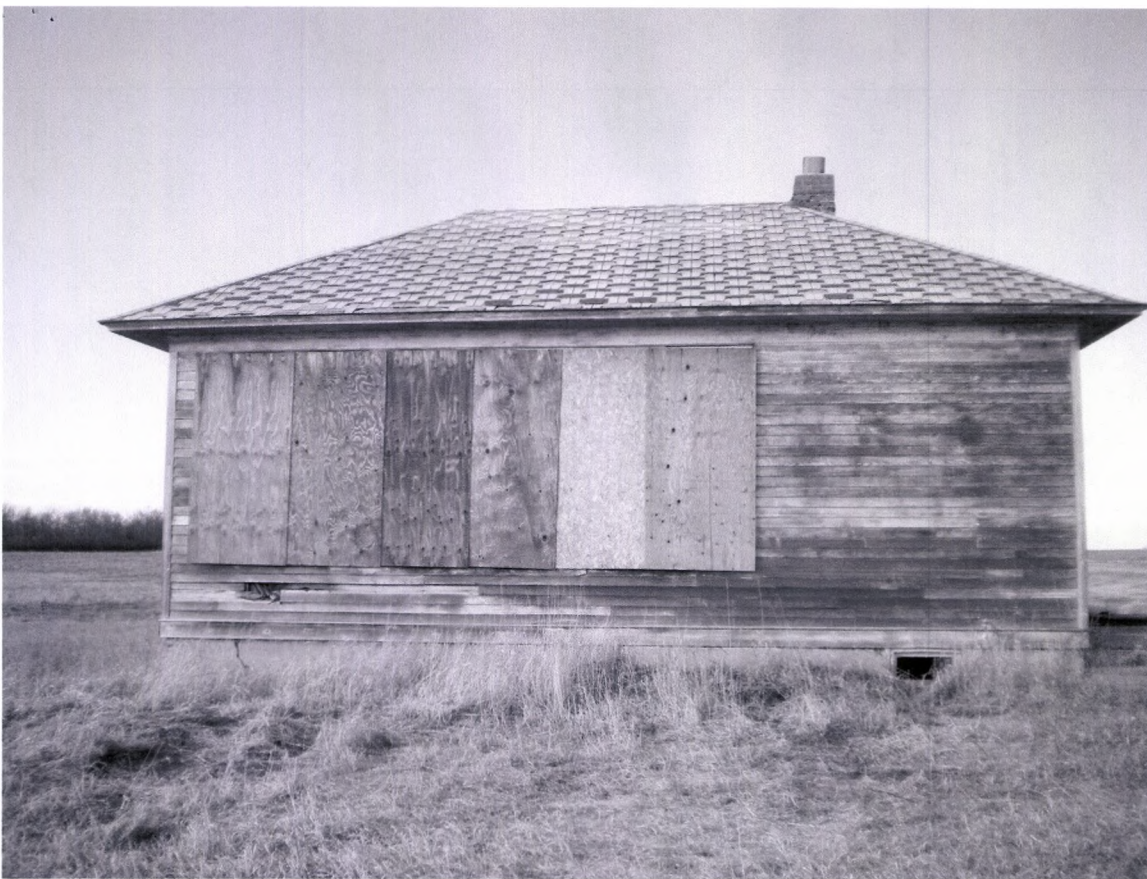
Haynes Twsp. School East Side 2/13/2012 Kathy Wilner KD