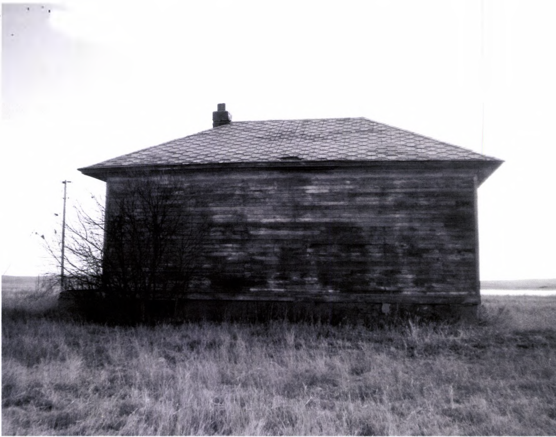
Haynes Twsp. School West Side 2/13/2012 Kathy Wilner KD