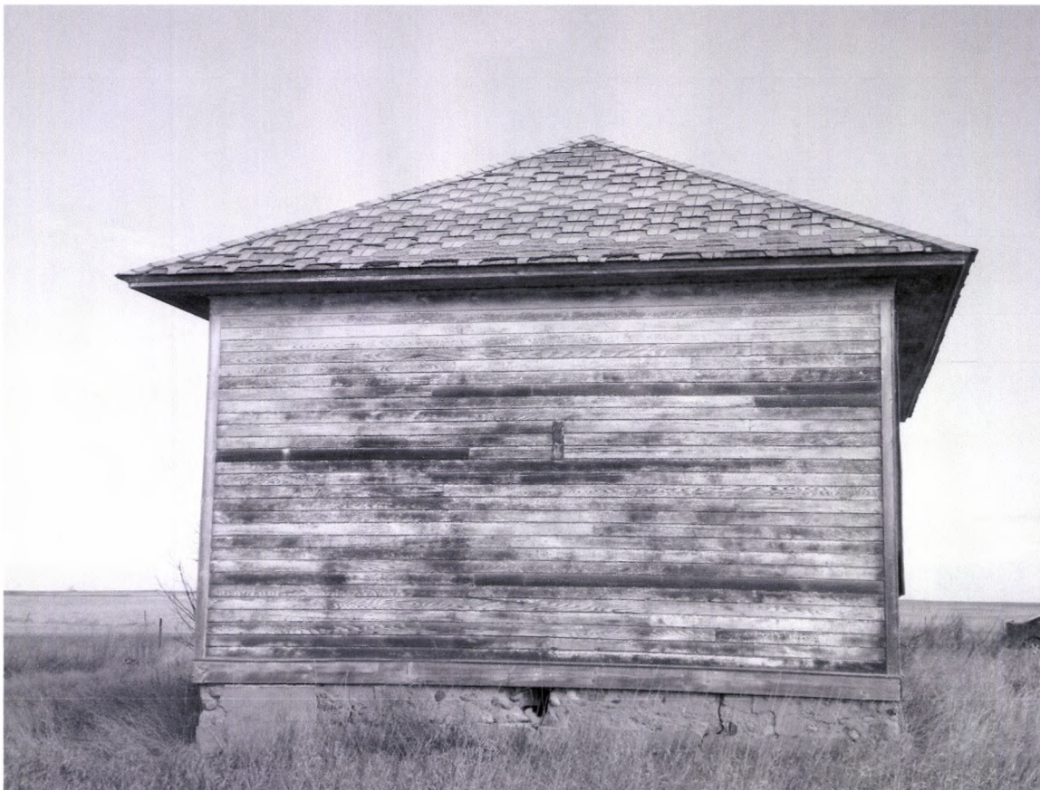
Haynes Twsp. School South Side 2/13/2012 Kathy Wilner KD