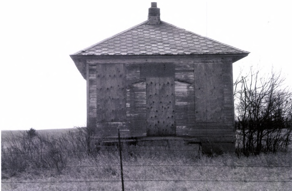
Haynes Twsp. School North Side 2/13/2012 Kathy Wilner KD