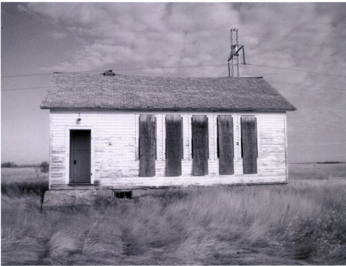
Chestina Twsp. School South Side 2/13/2012 Kathy Wilner KD