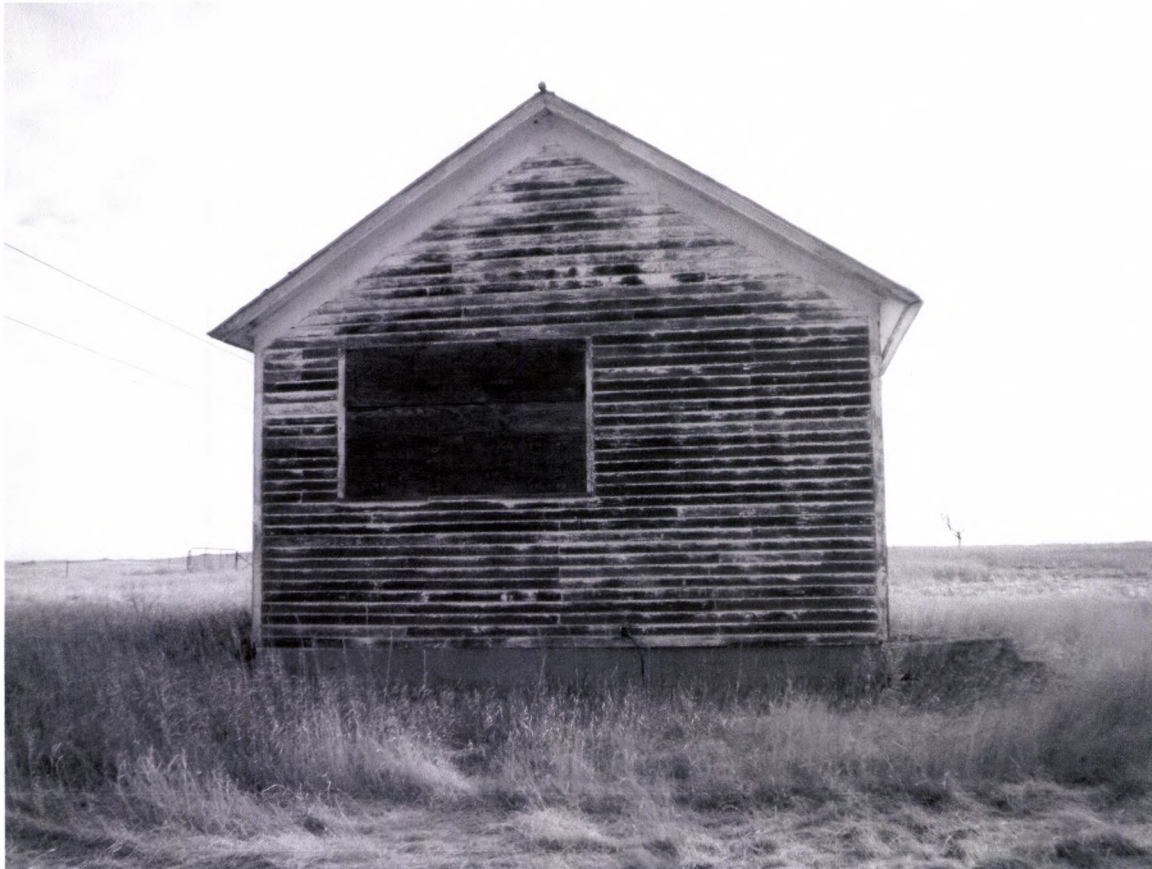
Chestina Twsp. School West Side 2/13/2012 Kathy Wilner KD