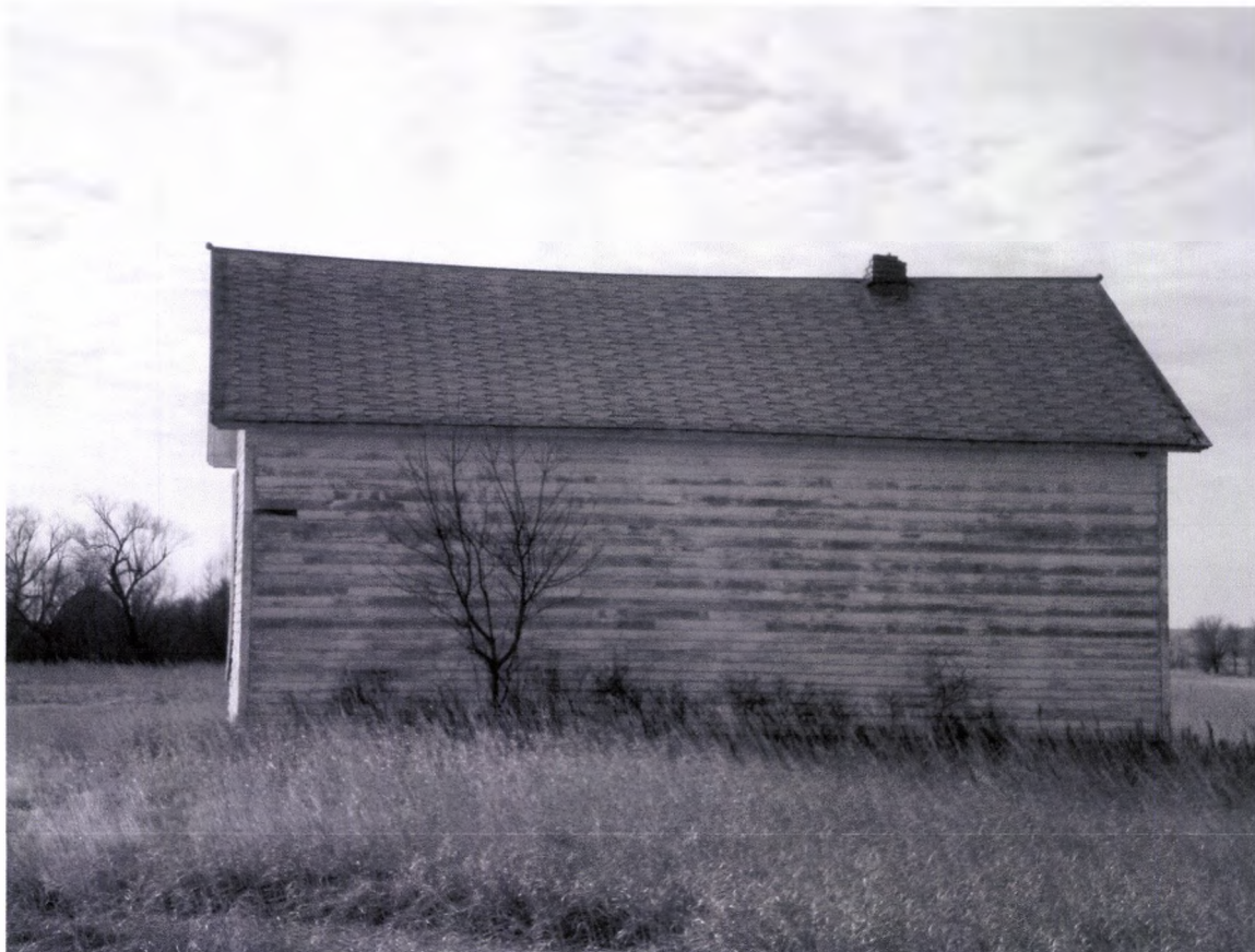
Chestina Twsp. School North Side 2/13/2012 Kathy Wilner KD