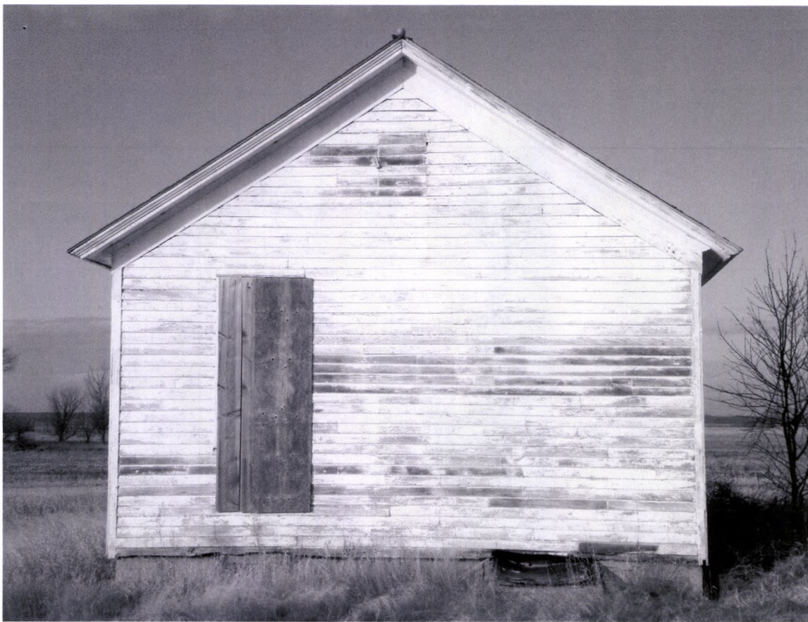
Chestina Twsp. School East Side 2/13/2012 Kathy Wilner KD