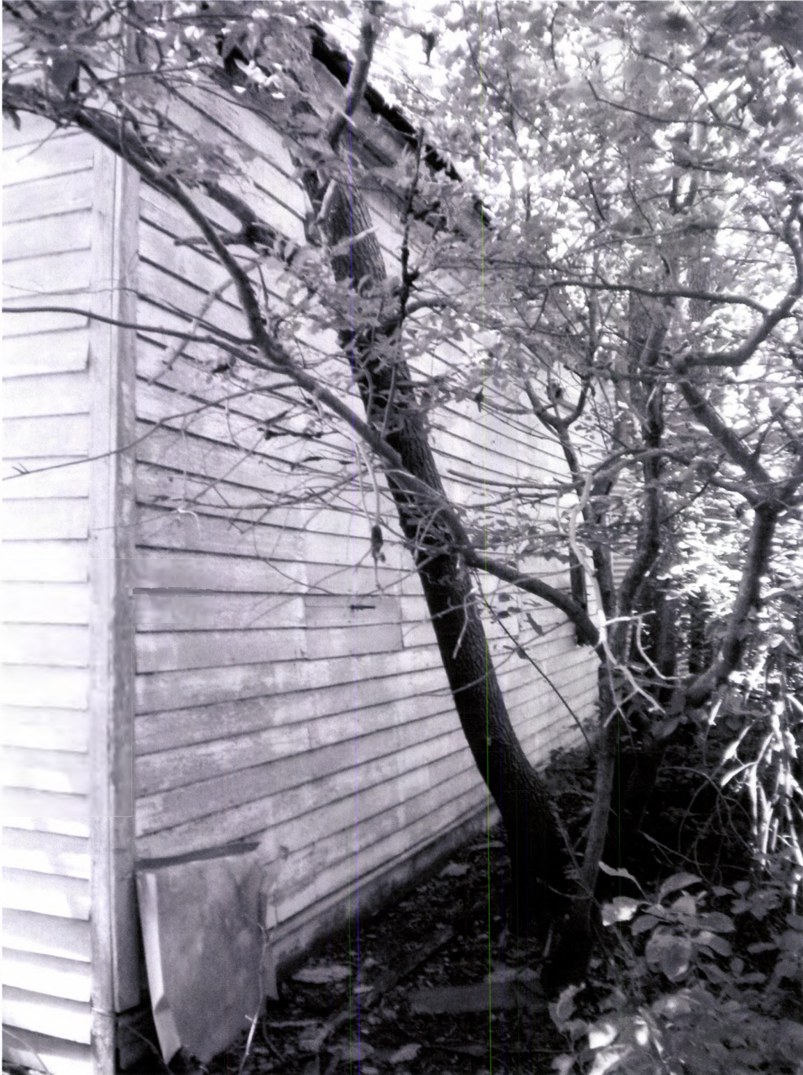
Wallace Township School North Side 6/2/2012 Kathy Wilner KD