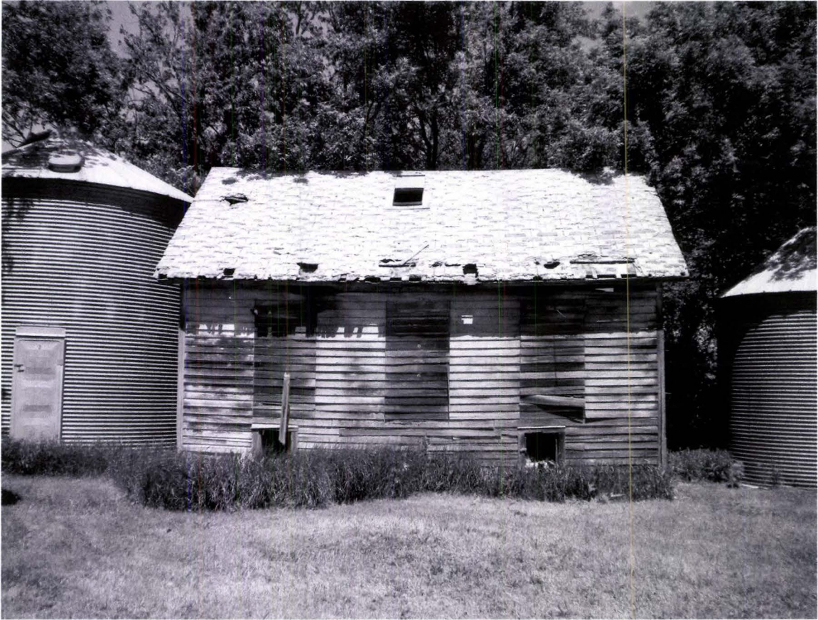
Wallace Township School South Side 6/2/2012 Kathy Wilner KD