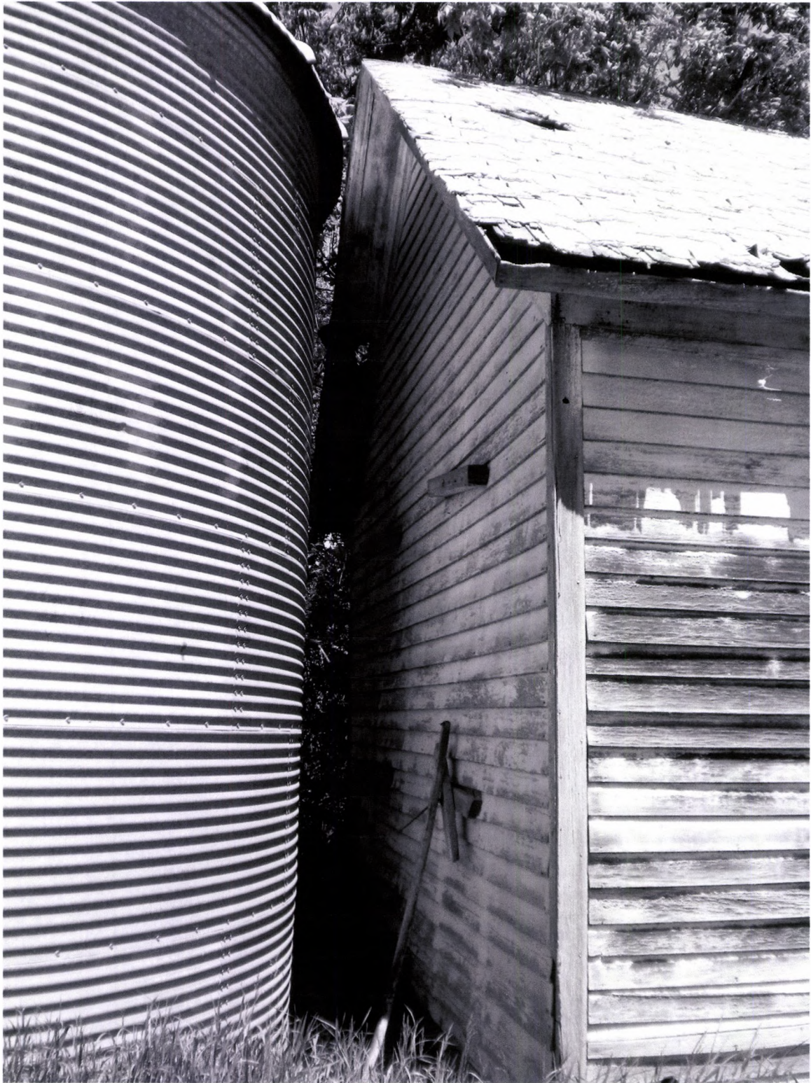
Wallace Township School West Side 6/2/2012 Kathy Wilner KD