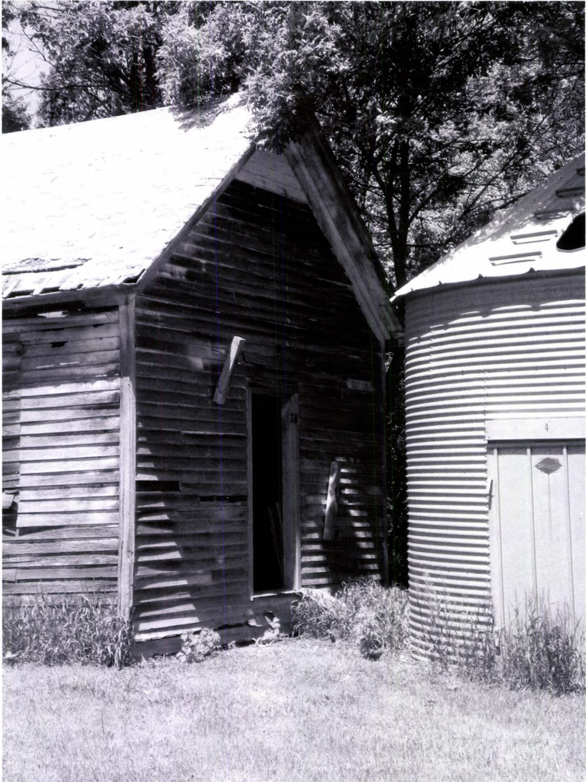
Wallace Township School East Side 6/2/2012 Kathy Wilner KD