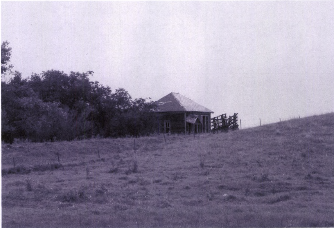
Weippert School SE Corner 8/31/2012

This is the only picture I have of this school as land was posted and driveway fenced.