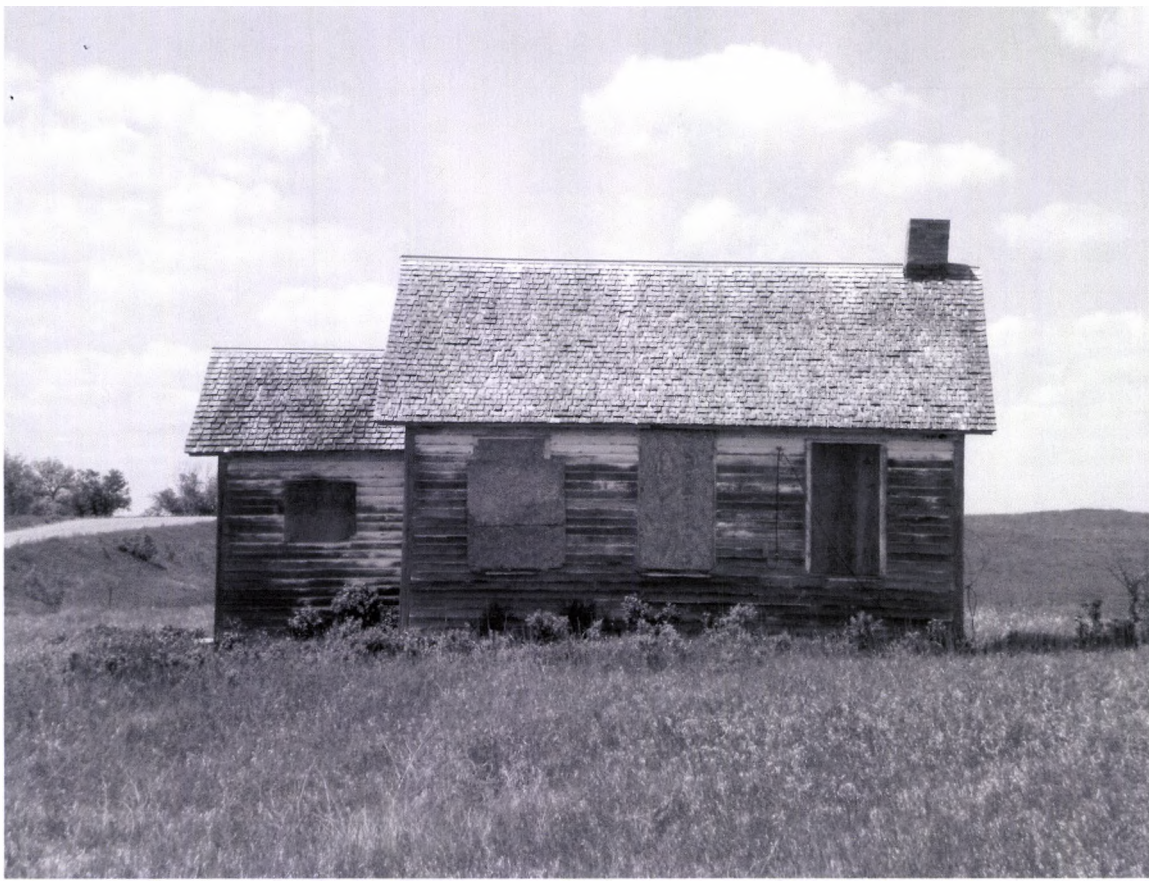
Merkel Twsp. School East Side 5/31/2012 Kathy Wilner KD