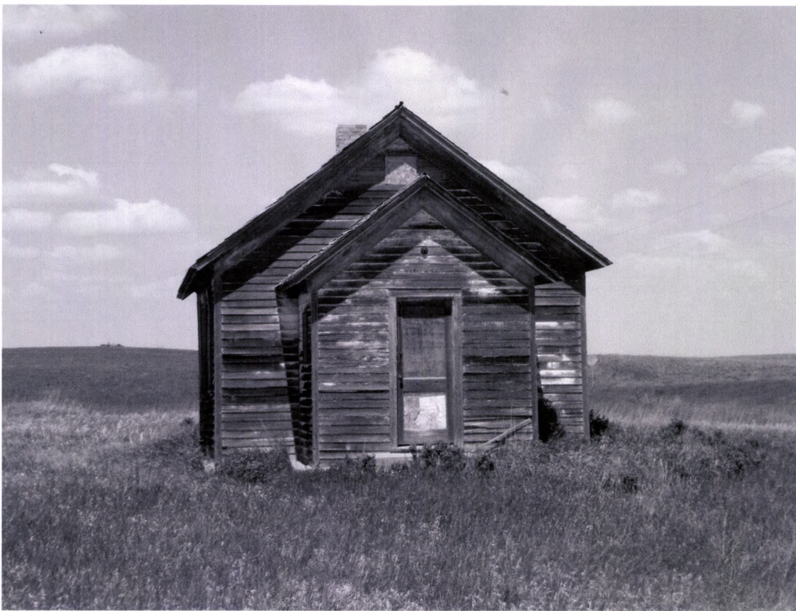
Merkel Twsp School South Side 5/31/2012 Kathy Wilner KD