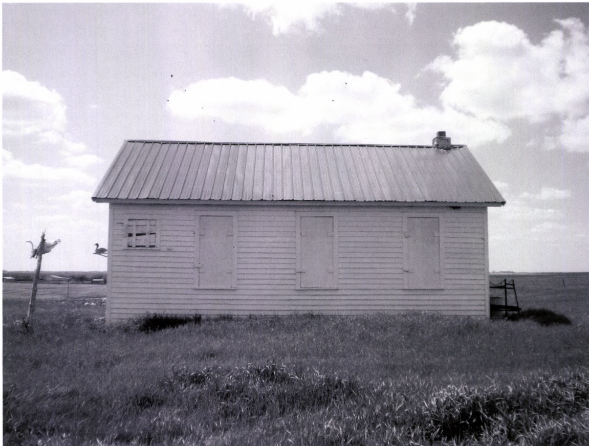
Northwest Twsp School East Side 5/31/3012 Kathy Wilner KD