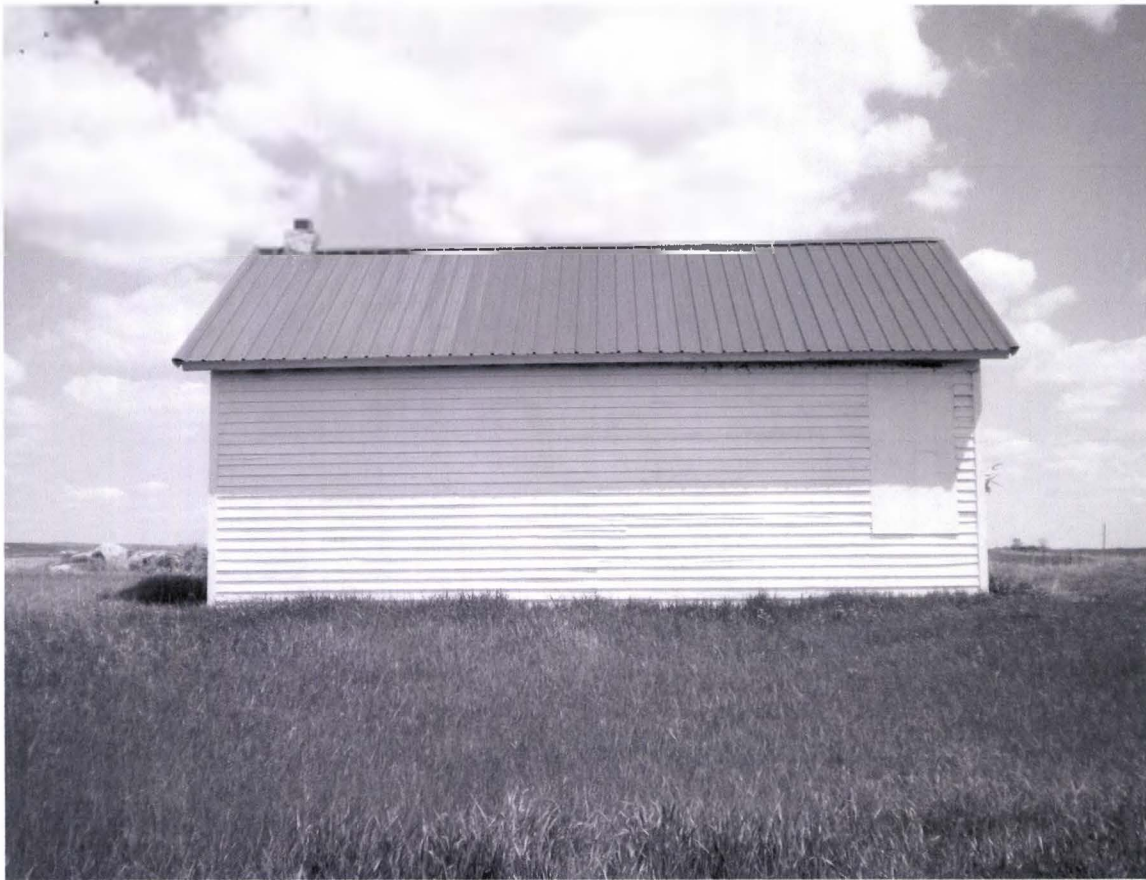
Northwest Twsp. School West Side 5/31/2012 Kathy Wilner KD