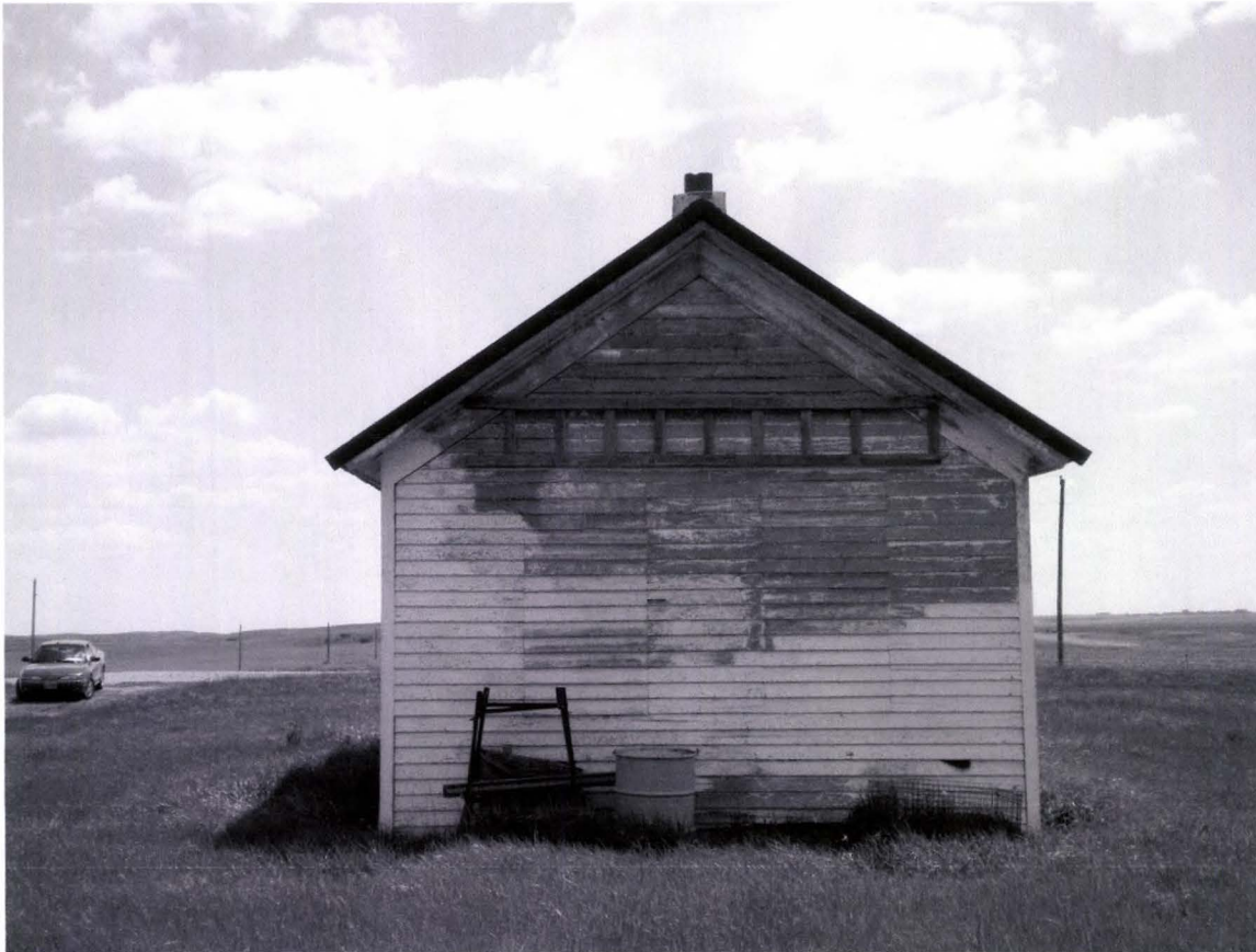
Northwest Twsp. School North Side 5/31/2012 Kathy Wilner KD