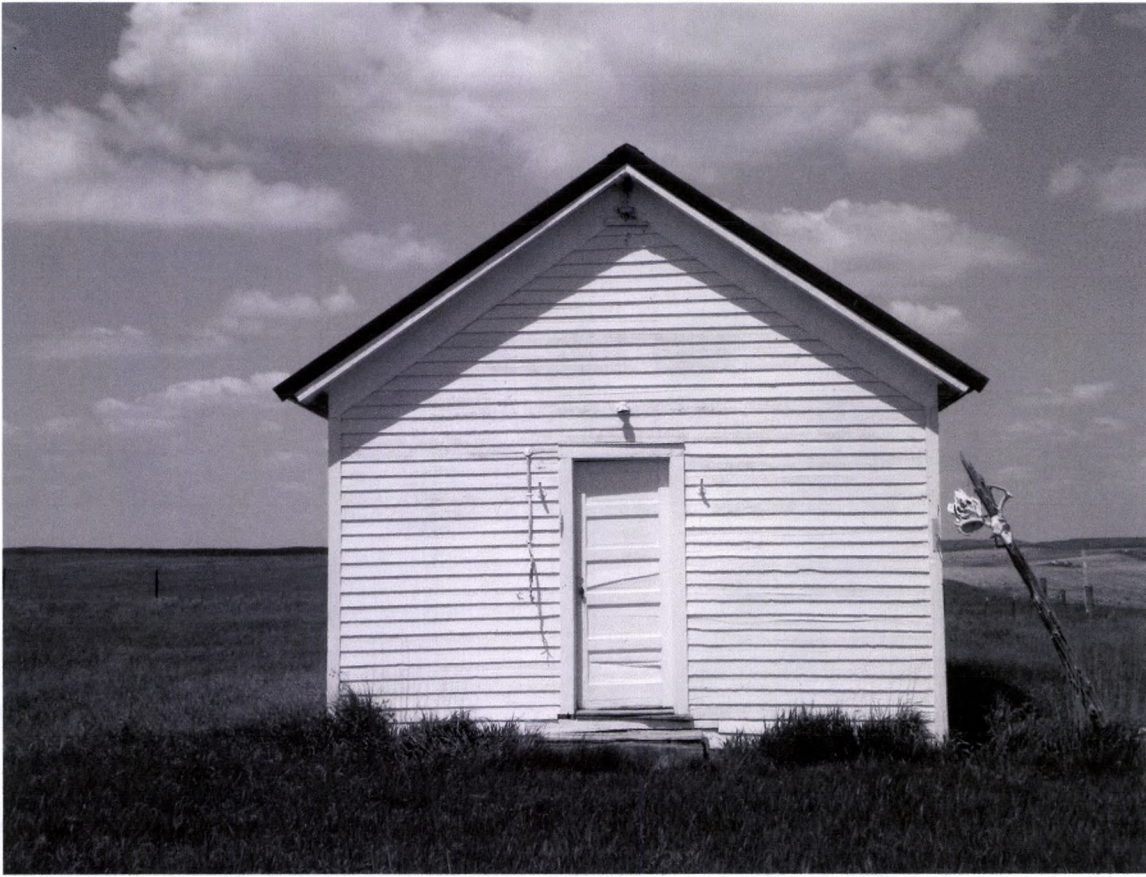
Northwest Twsp. School South Side 5/31/2012 Kathy Wilner KD