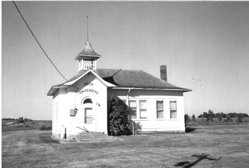
View to north over Duck University (roll #DRW-1, exposure #20). Coder: Ed Stine Date Coded: 11/2/95

The site consists of a single structure which is quite unique in design for rural North Dakota. It has a hip bell cast roof. The porch or entryway has a gable bell cast roof and the bell tower has a bell cast roof. The structure has windows on all four sides, is wood shake shingled and has a brick chimney. A hand pump is visible in the front yard. It is identified as a one room school house based on the sign over the door "Duck University". It is in very good condition and will not be impacted by the rural waterline project. Future projects which may be destructive should be preceded by additional investigation and probably should be rerouted to avoid this building. It is quite likely eligible for the National Register of Historic Places.