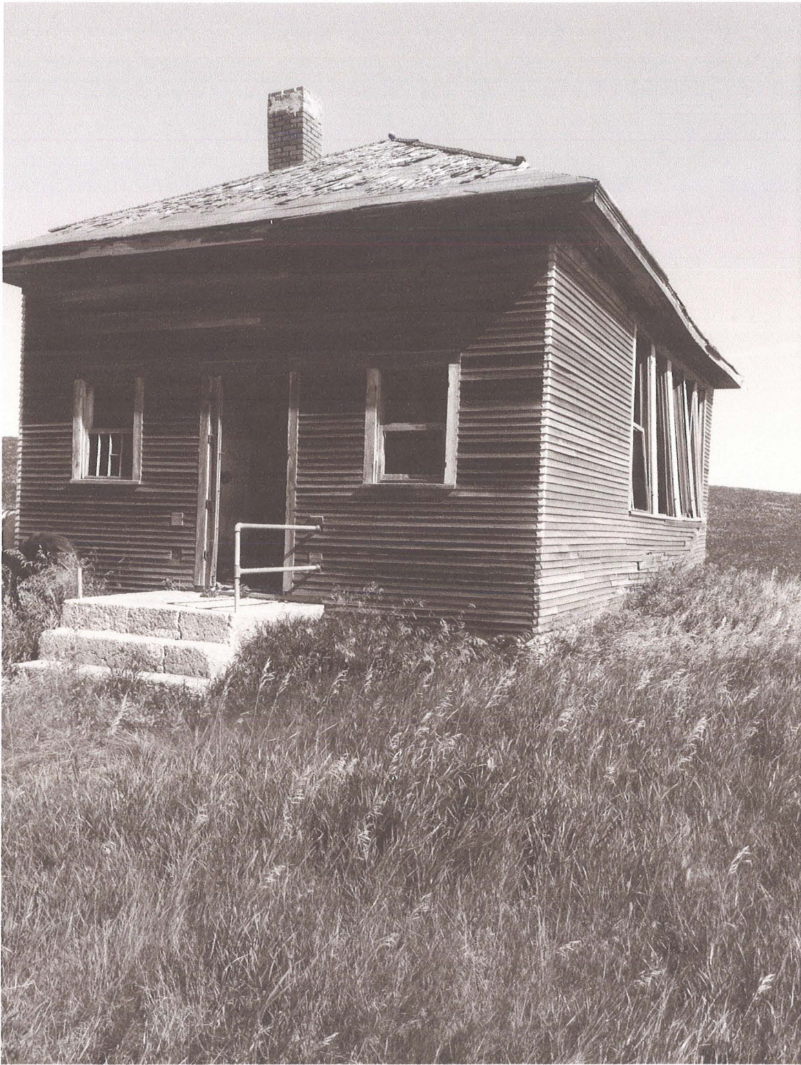
South and East Sides