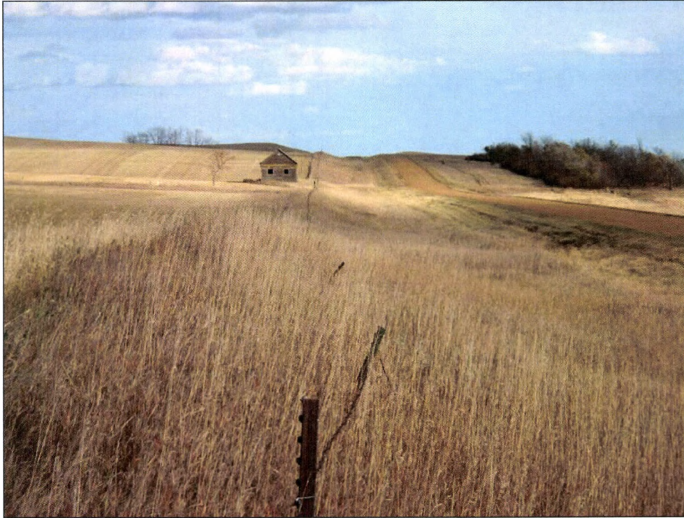
Site overview, view east (CNTR11 280)