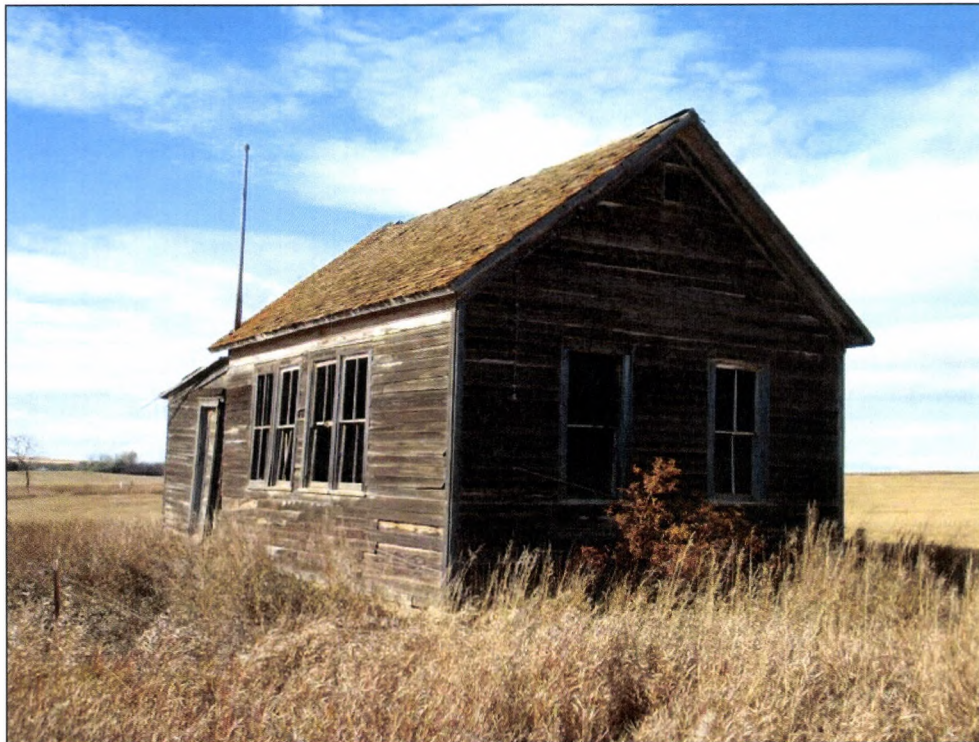
F1 schoolhouse, view northwest (CNTR11 198)