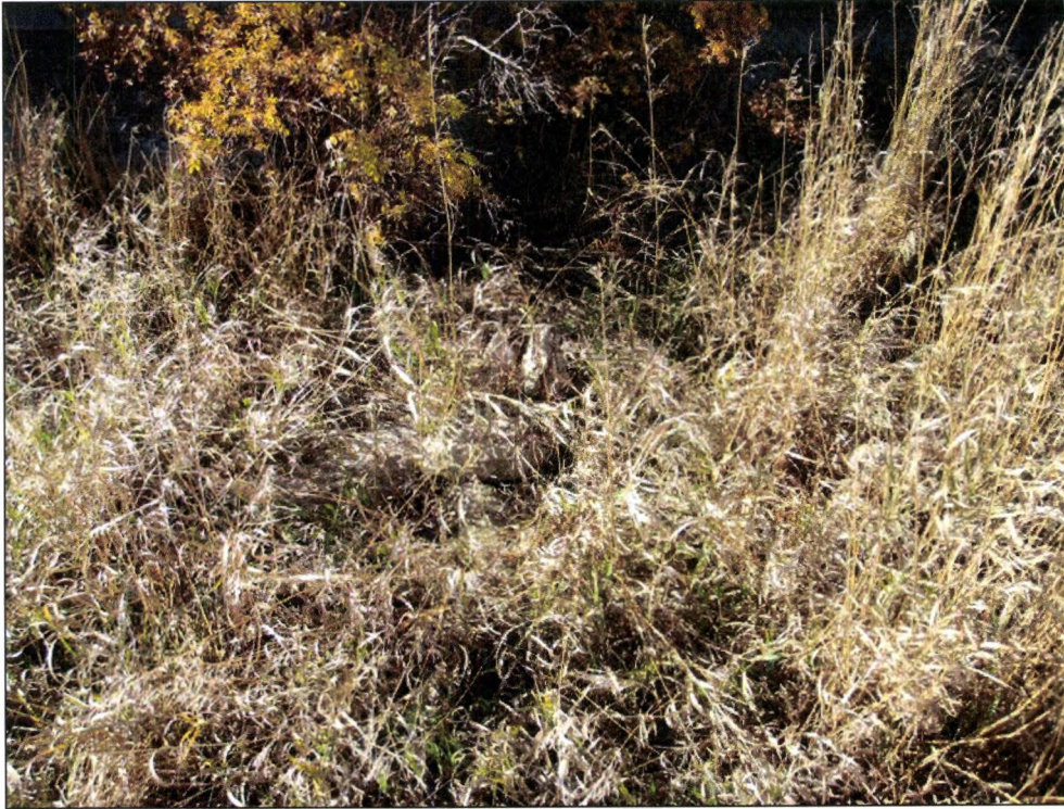
F2 foundation, view west (CNTR11 213)