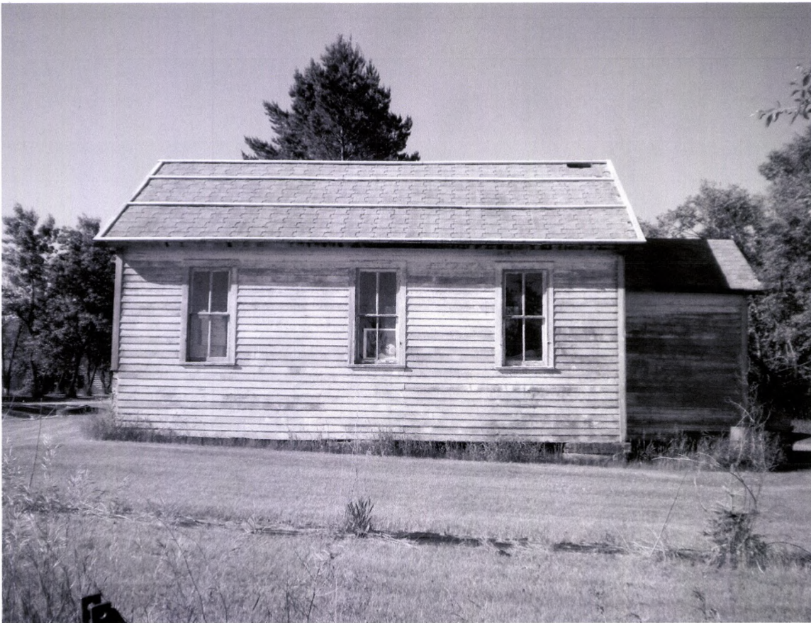
Highland Twsp. School North Side 06/14/2012 Kathy Wilner MH