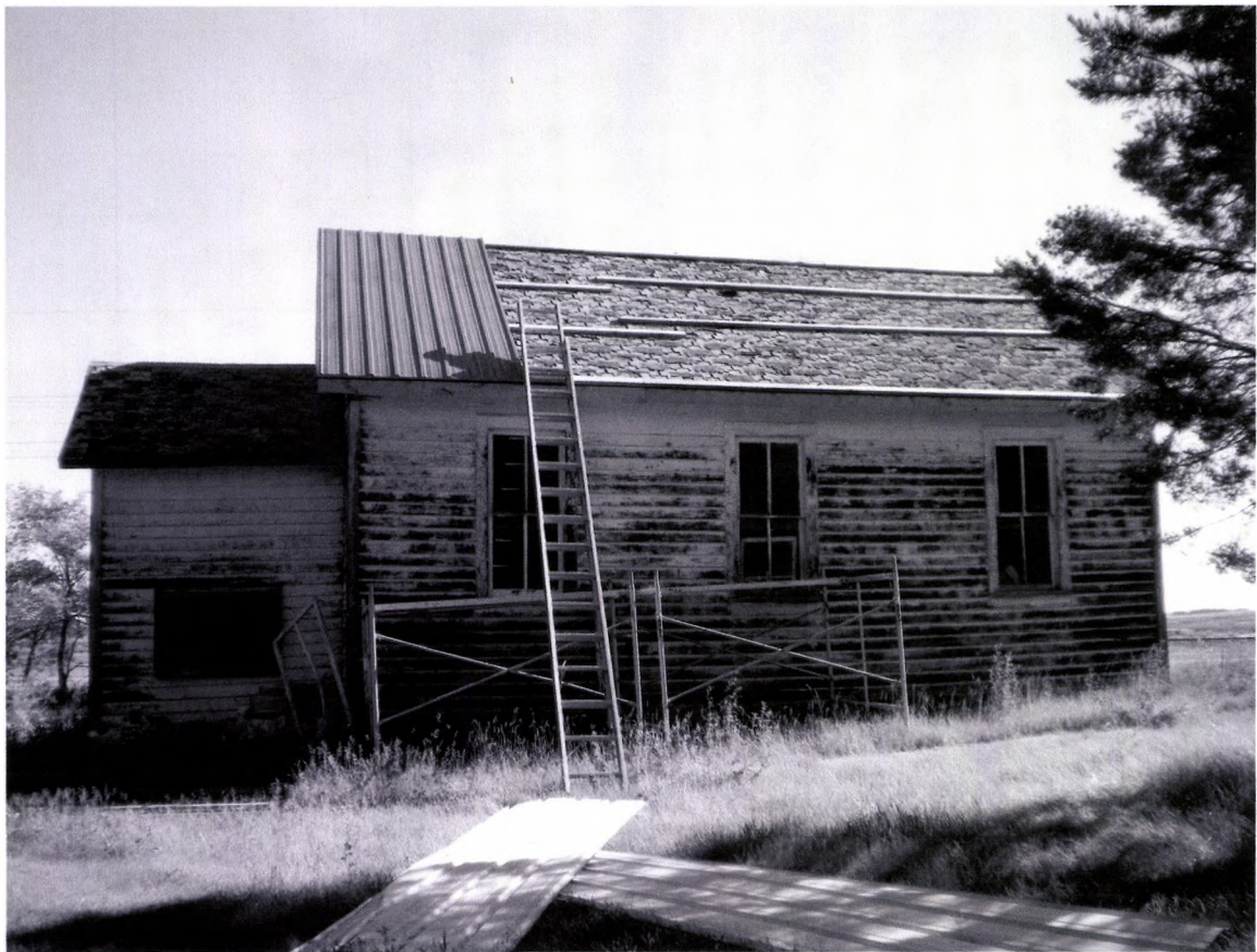
Highland Twsp. School South Side 06/14/2012 Kathy Wilner MH