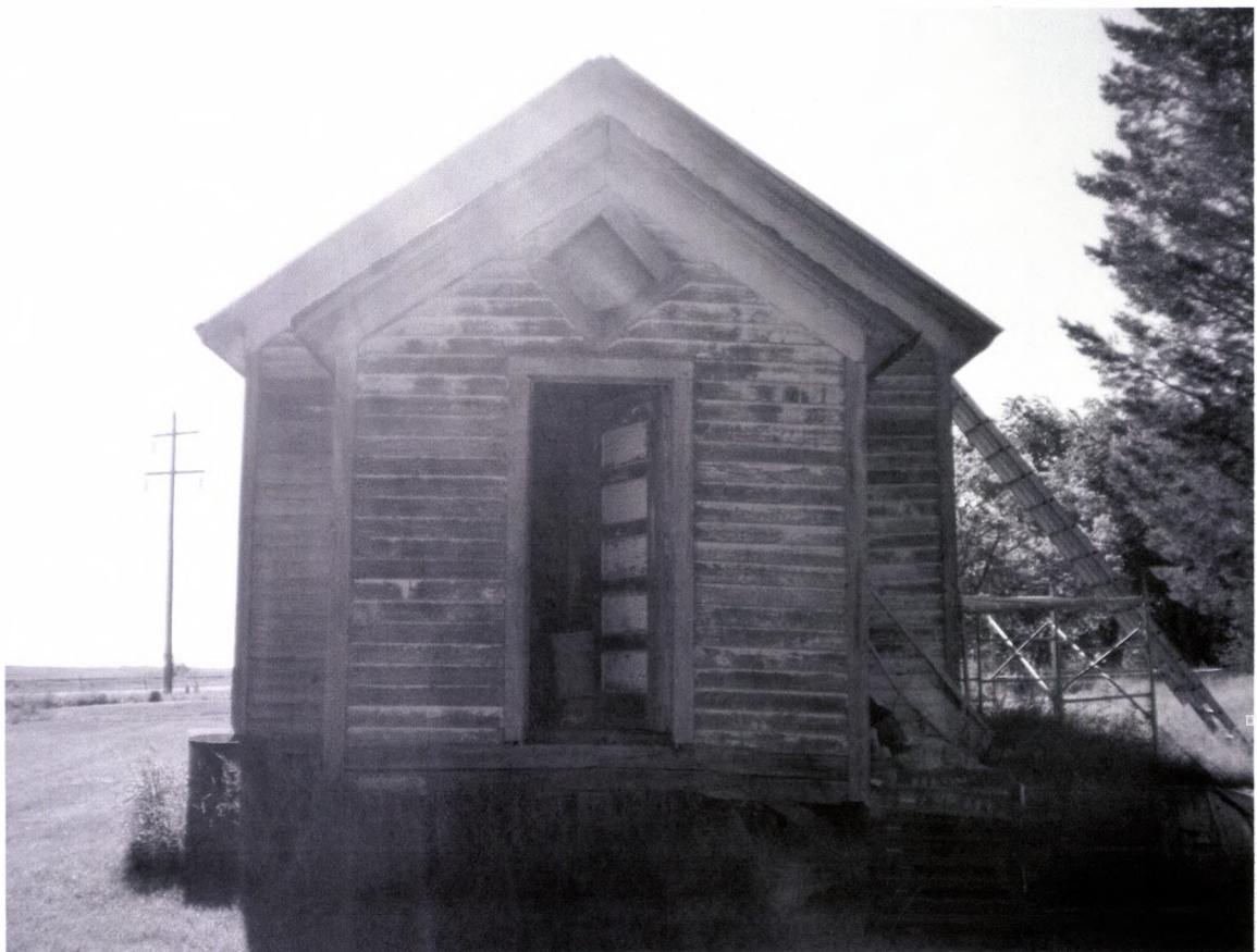
Highland Twsp. School West Side 06/14/2012 Kathy Wilner MH