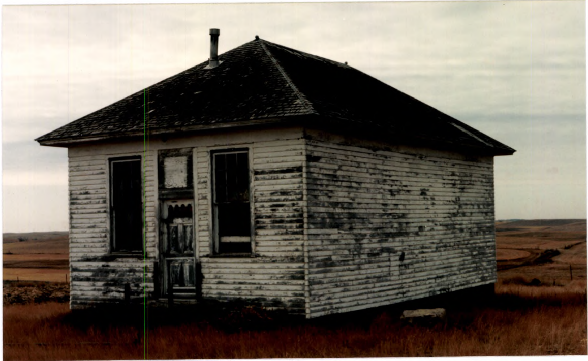
Feature 1, view to the southwest

Include direction facing, feature number, and photo caption for each submitted photograph.