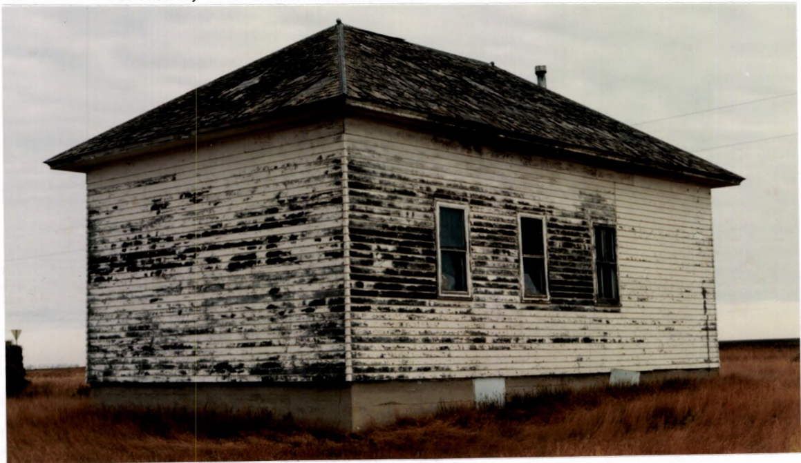
Feature 1, view to the northeast