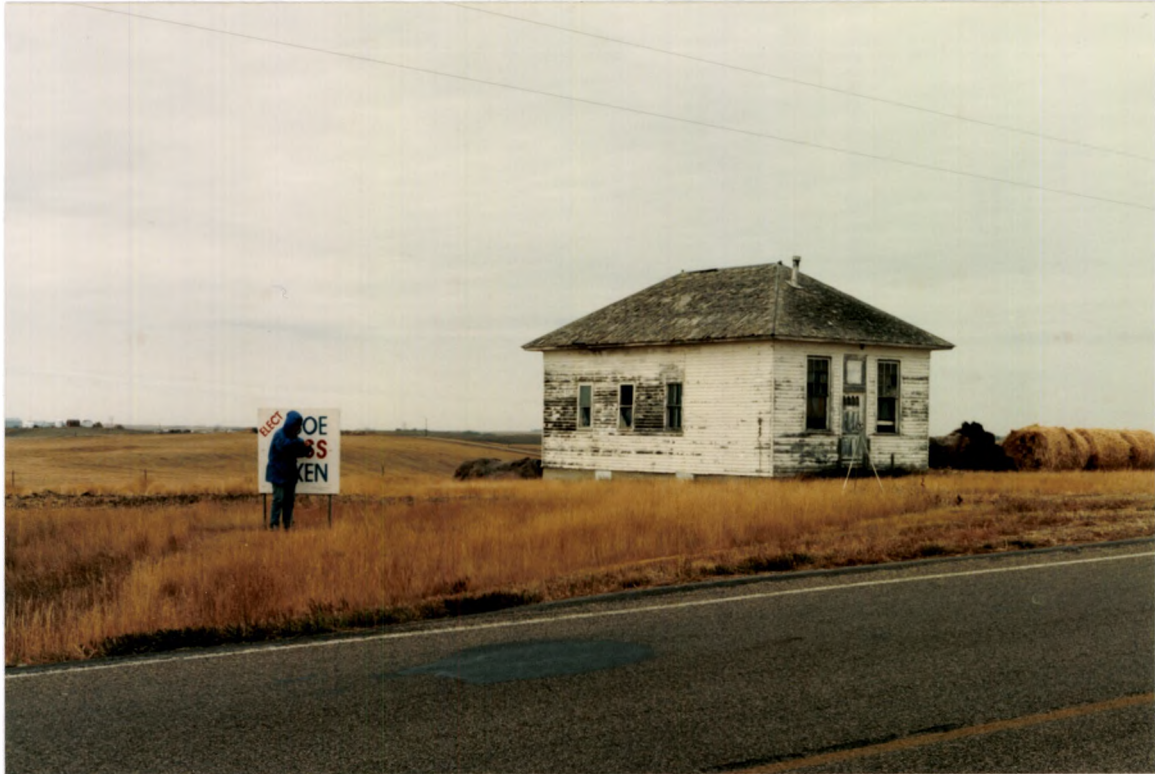
Site photo, view to the northwest

Include direction facing, feature number, and photo caption for each submitted photograph.