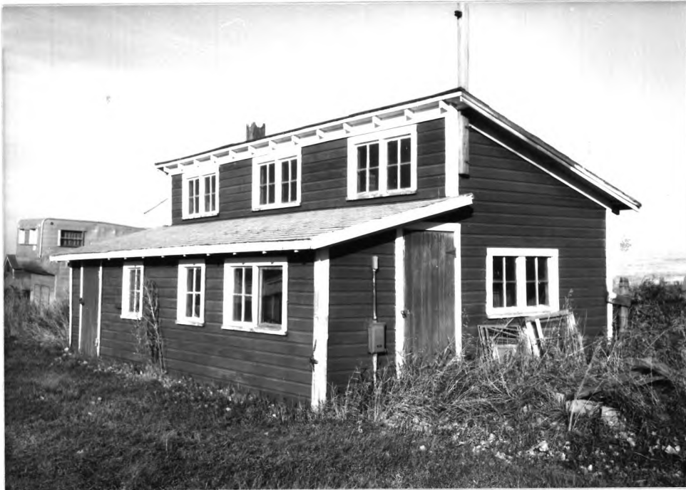
FEATURE 7: Chicken coop, south and east elevations, view to northwest