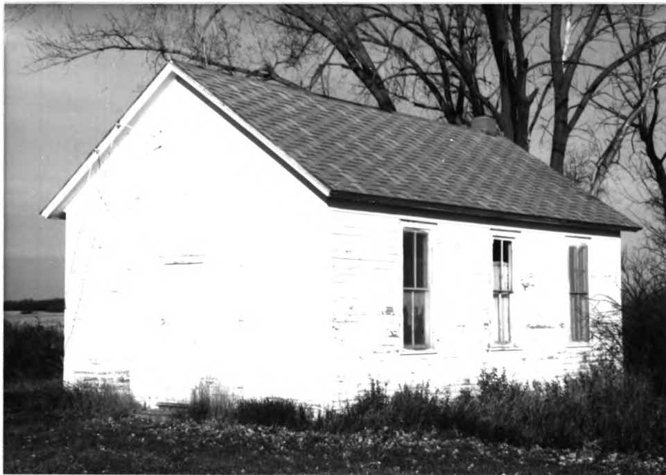
FEATURE 8: School House, south and east elevations, view to northwest