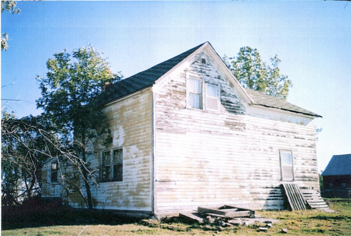
Feature 1, view to the northeast