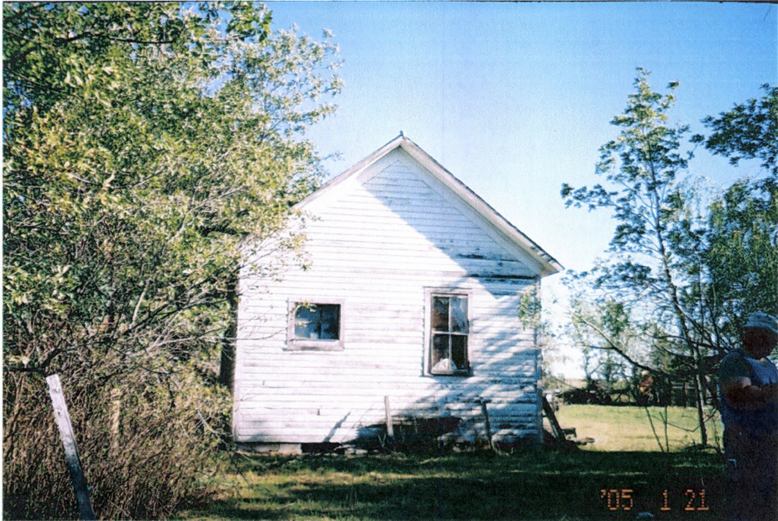
Feature 2, view to the north