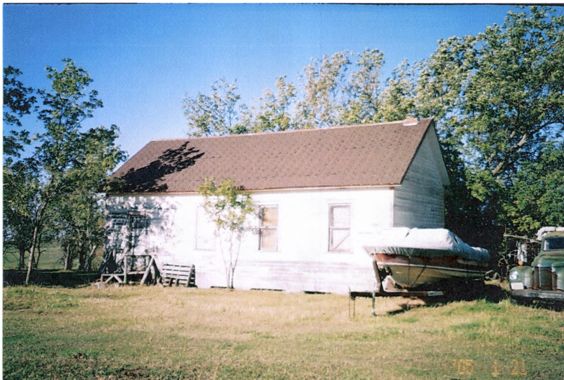
Feature 2, view to the southwest