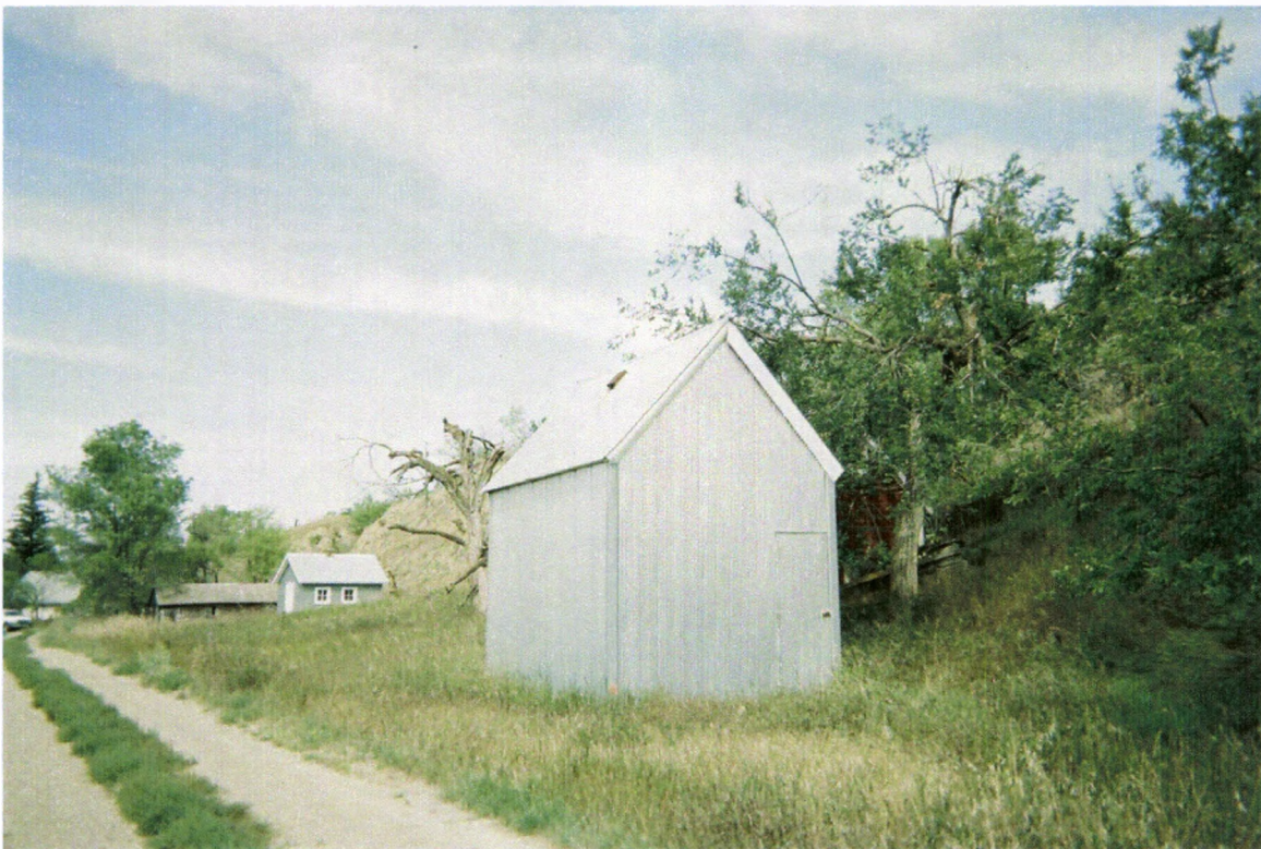
Feature 26, view to the northwest