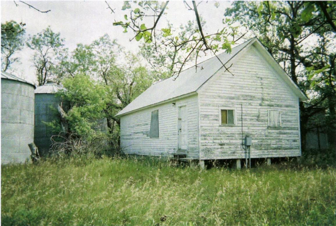
Features 24 and 25, view to the northeast