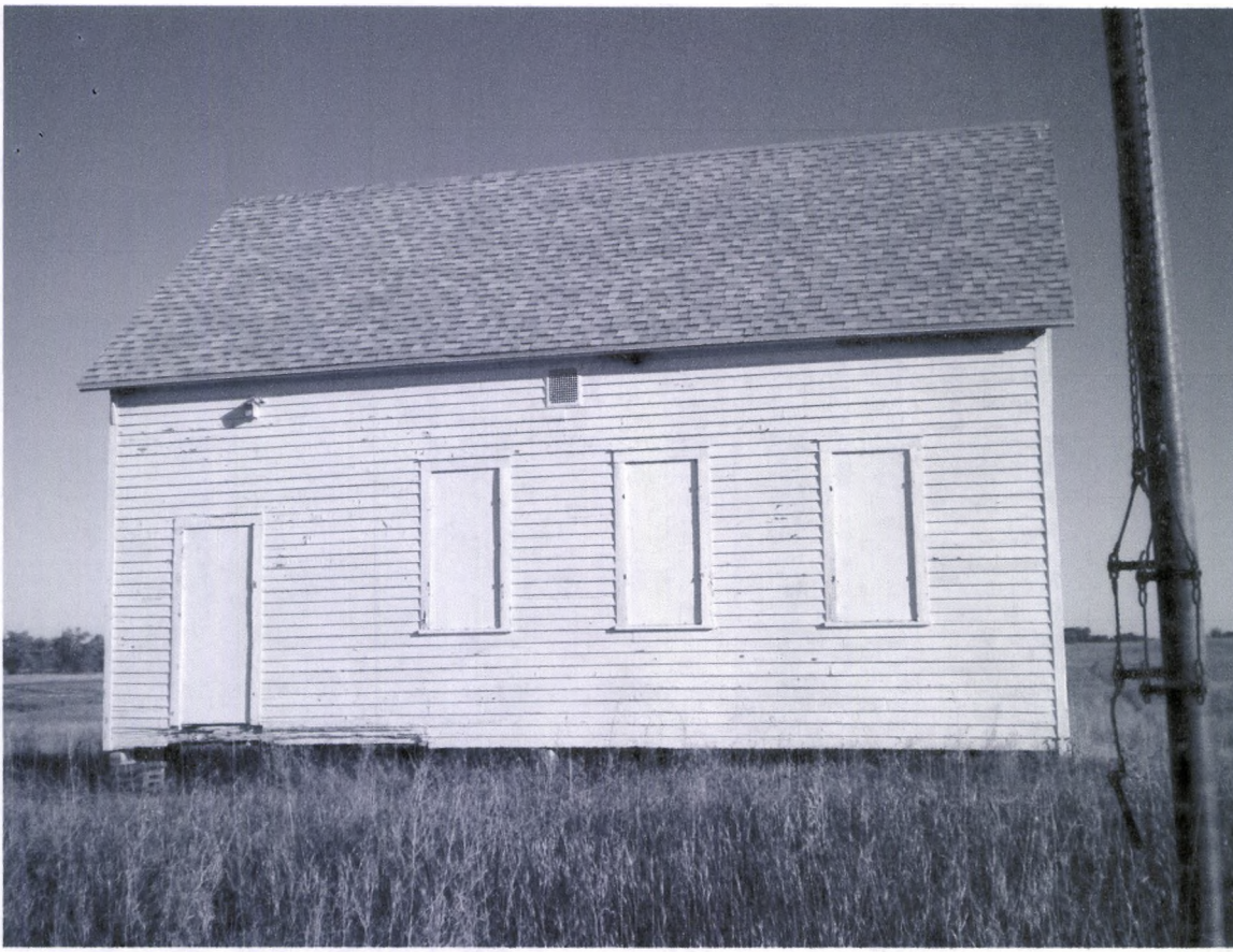
Wise Township School 9/26/2011 South Side Kathy Wilner ML