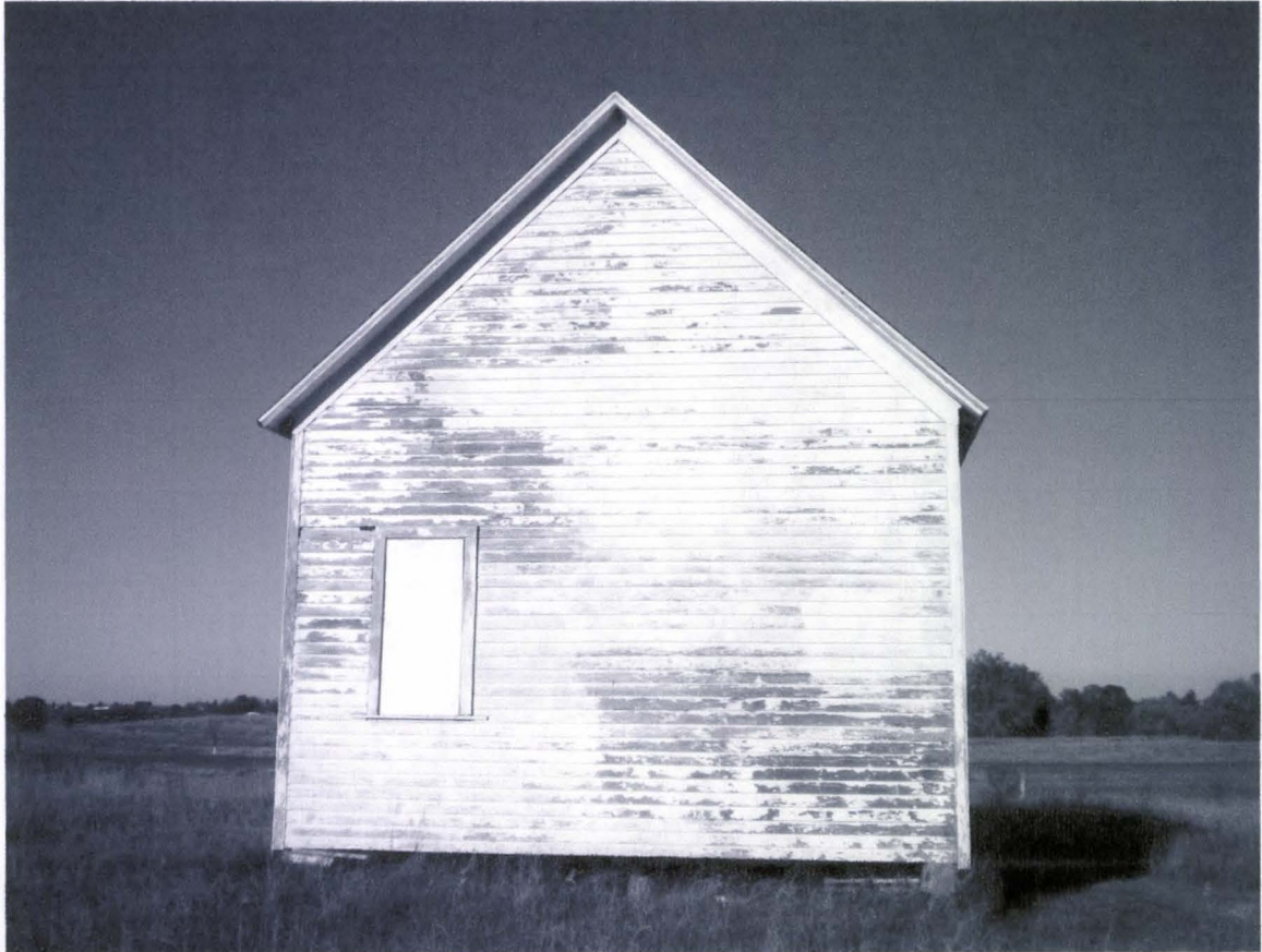
Wise Township School 9/26/2011 East Side Kathy Wilner ML