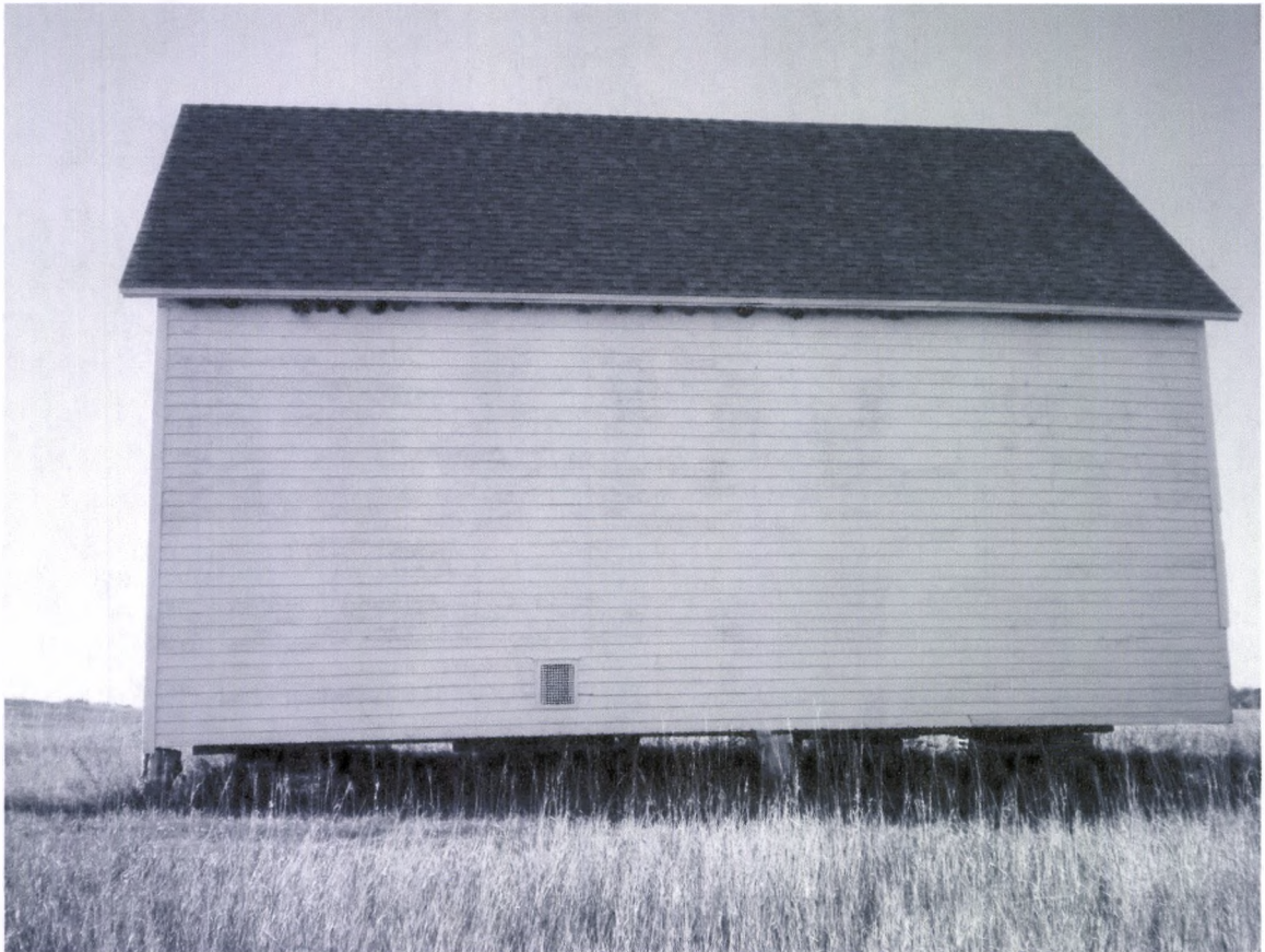
Wise Township School 9/26/2011 North Side Kathy Wilner ML