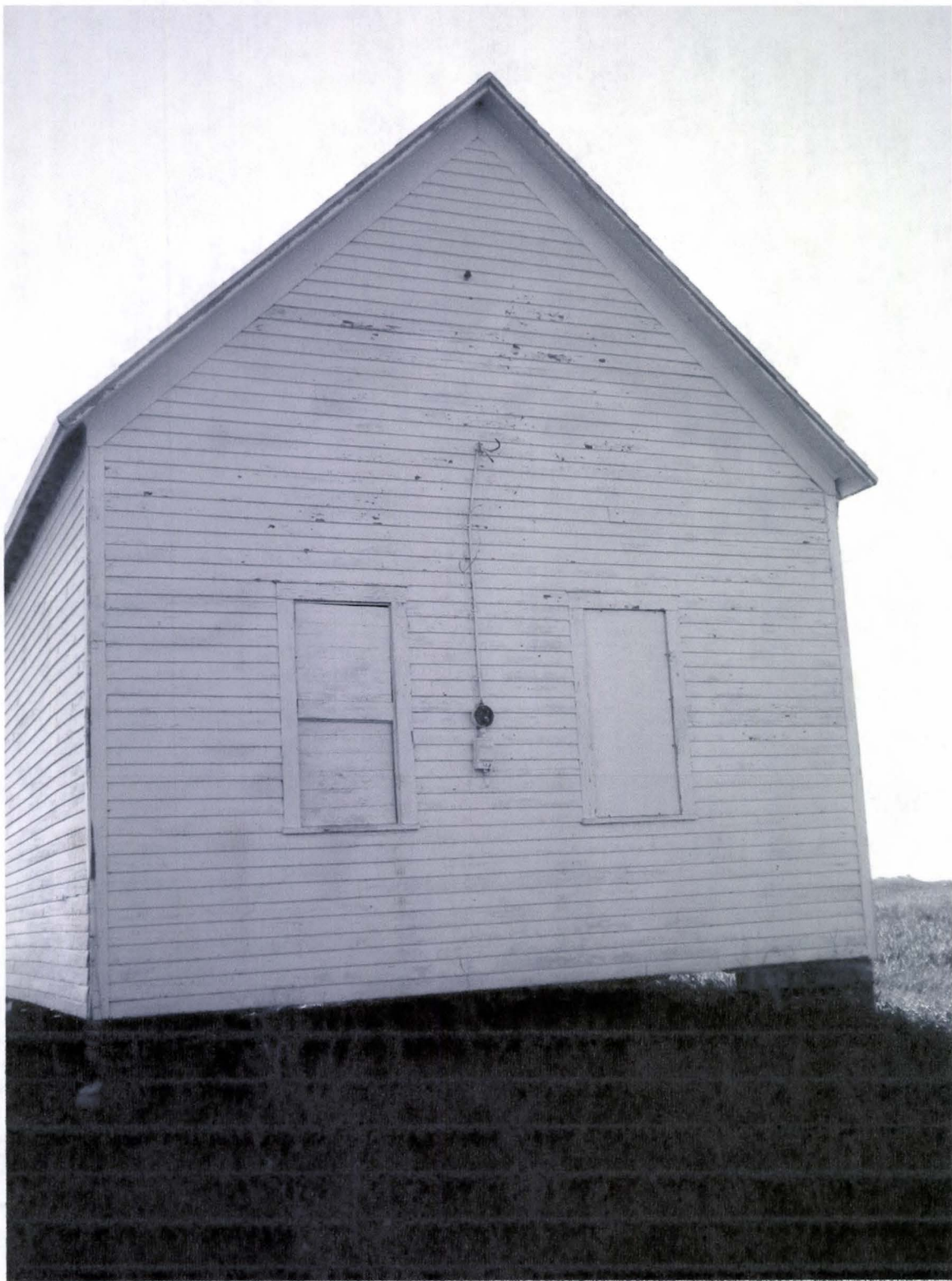
Wise Township School 9/26/2011 West Side Kathy Wilner ML