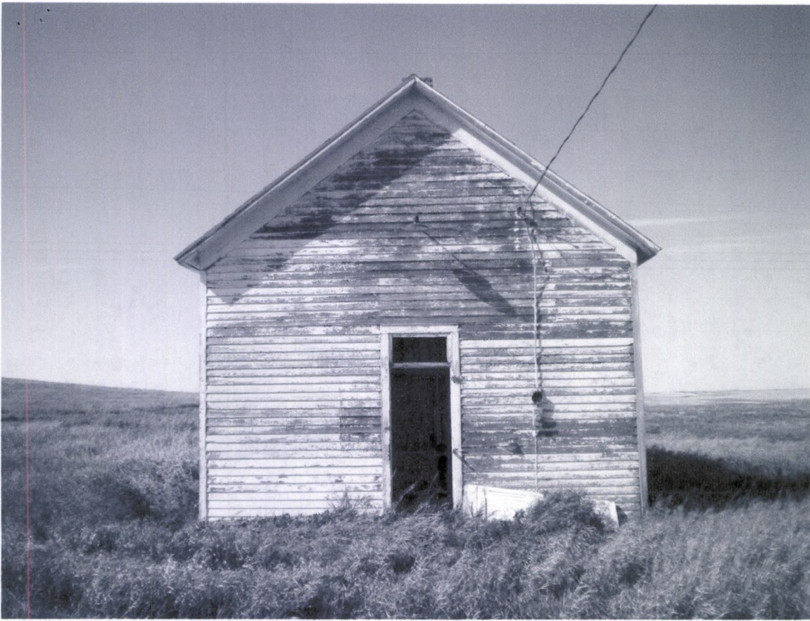
Blaine Township School 9/26/2011 East Side Kathy Wilner ML Greatstone - Levey