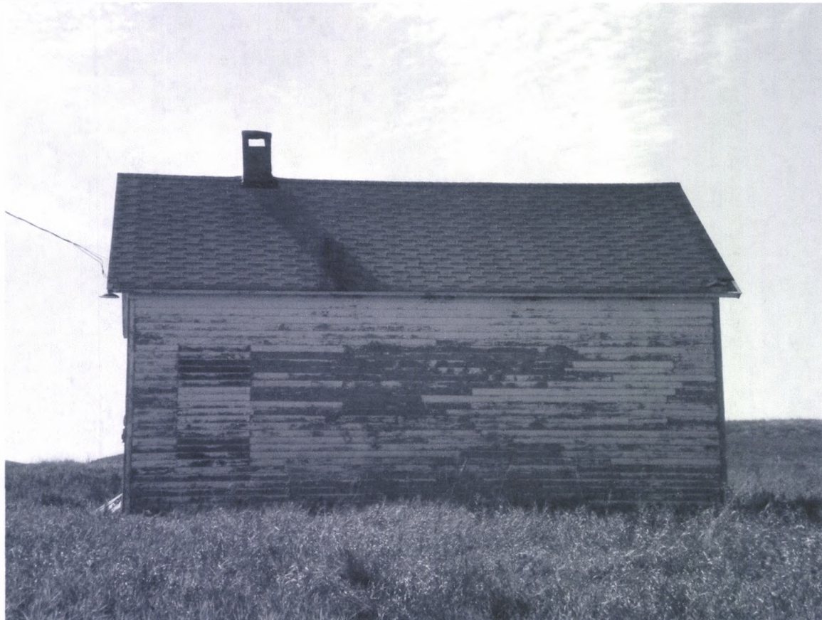
Greatstone - Levey Levey Township School 9/26/11 North Side Kathy Wilner ML