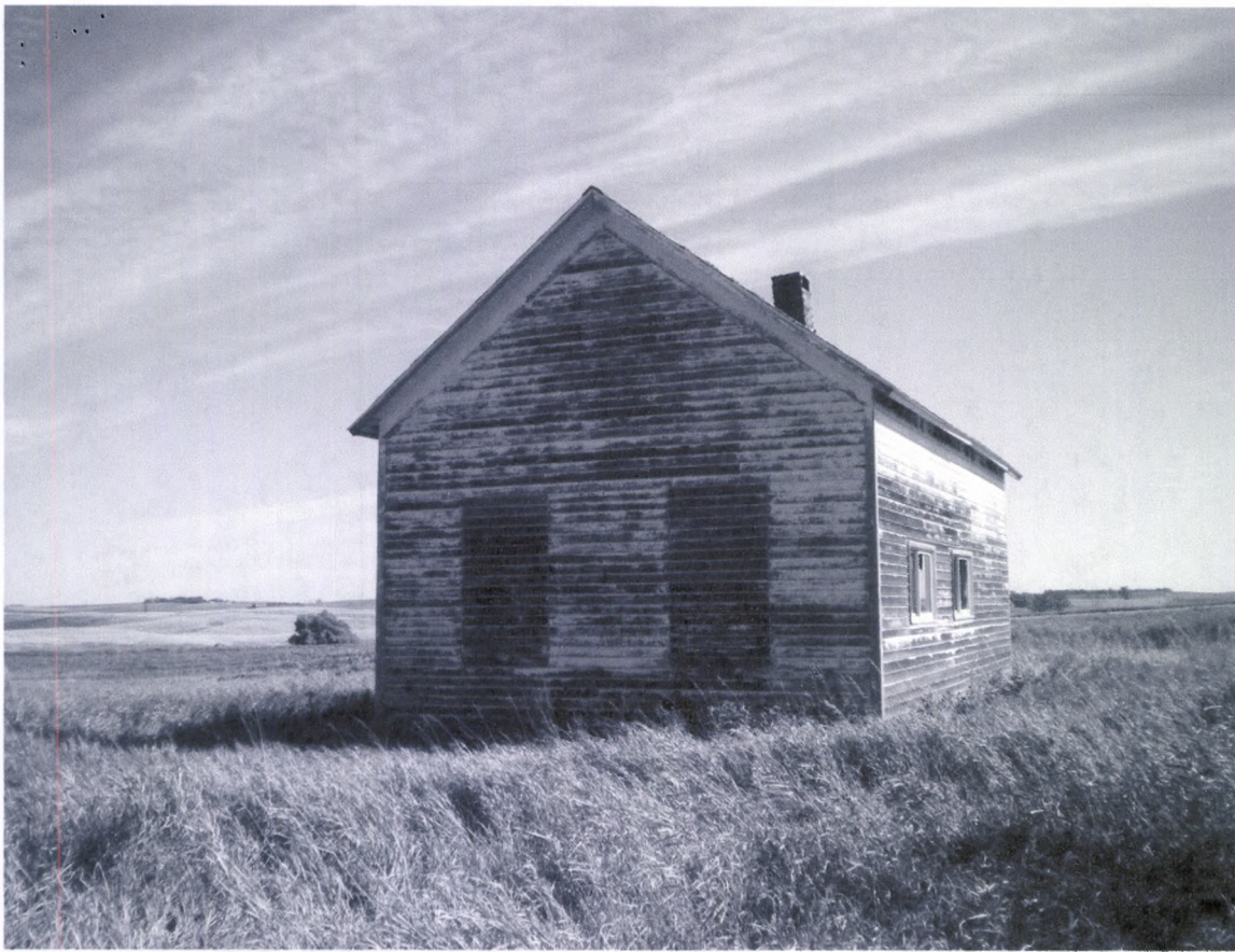
Levey Township School 9/26/2011 West Side Kathy Wilner ML Greatstone - Levey