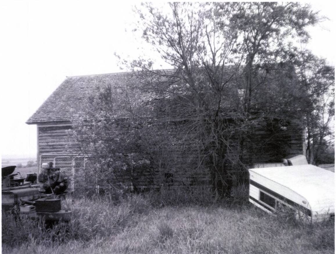
Conkling School #1 North Side 6/26/2012 Kathy Wilner ML