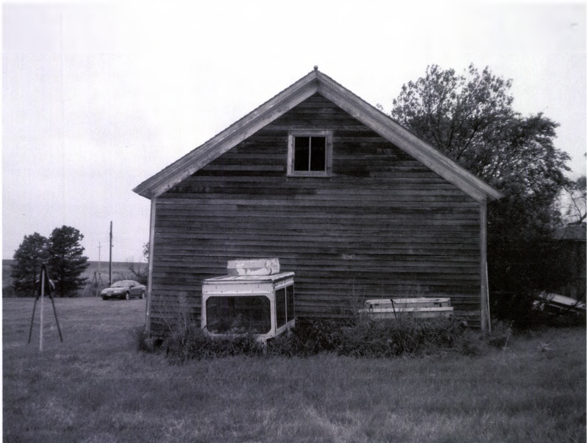
Conkling School #1 East Side 6/26/2012 Kathy Wilner ML