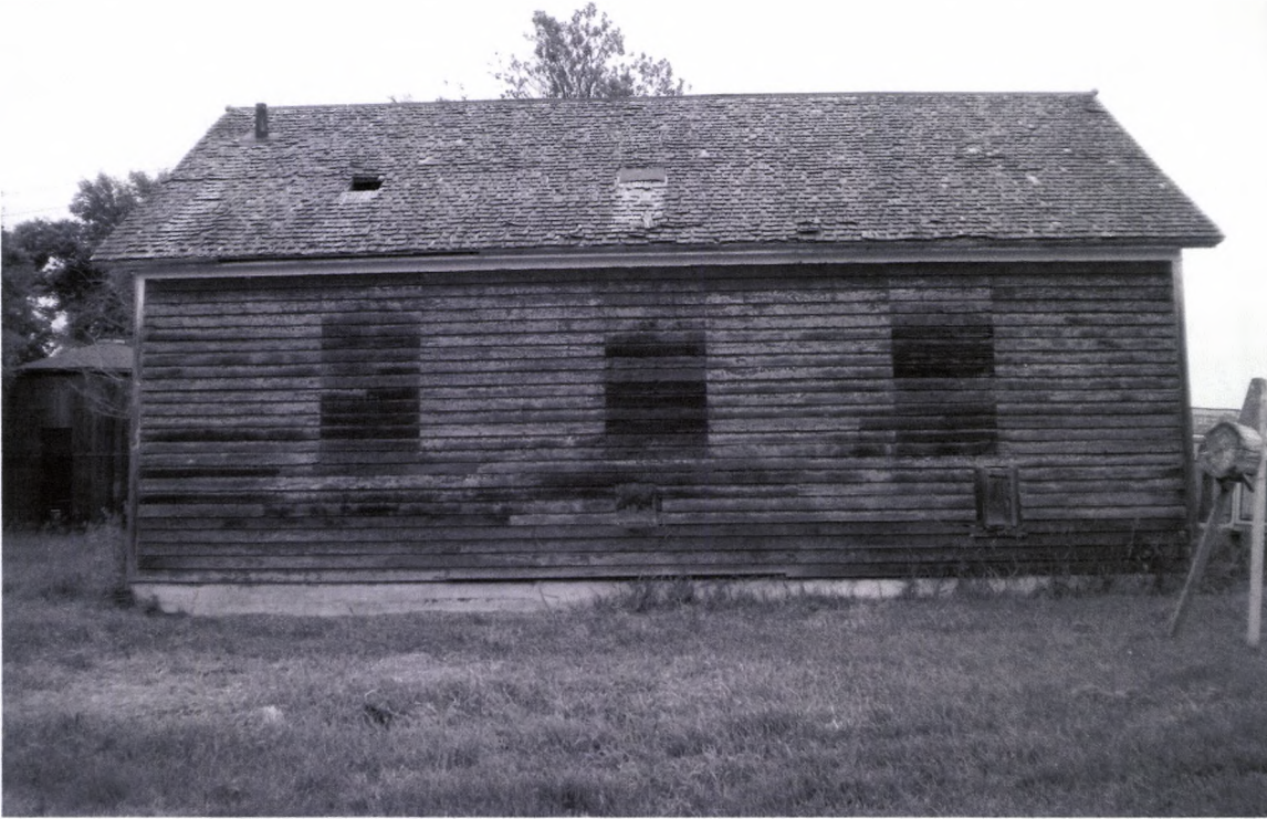
Conkling School #1 South Side 6/26/2012 Kathy Wilner ML