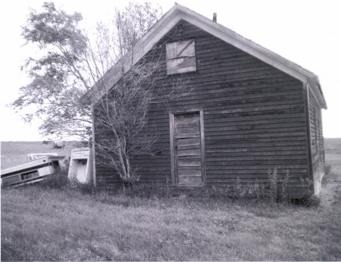
Conkling School #1 West Side 6/26/2012 Kathy Wilner ML