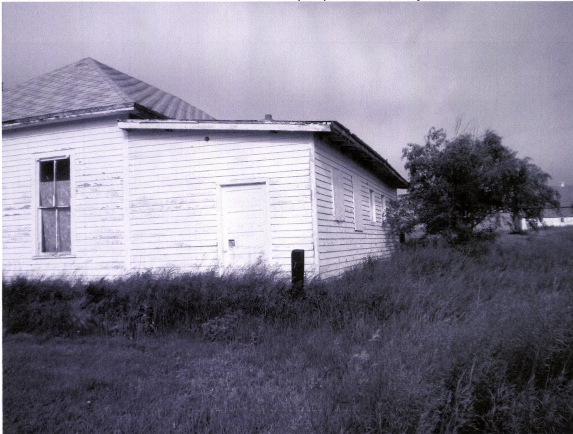
Park School #1 North Side 6/26/2012 Kathy Wilner ML