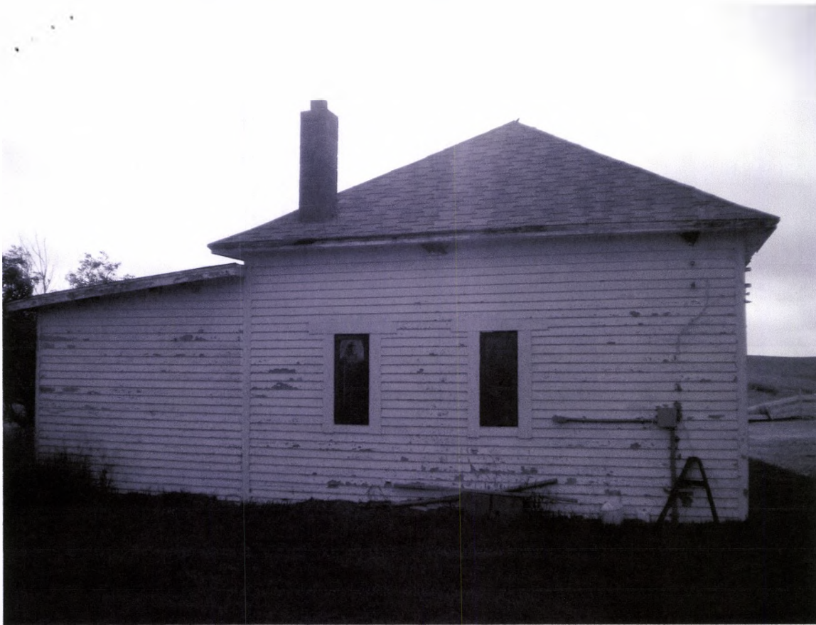
Park School #1 West Side 6/26/2012 Kathy Wilner ML