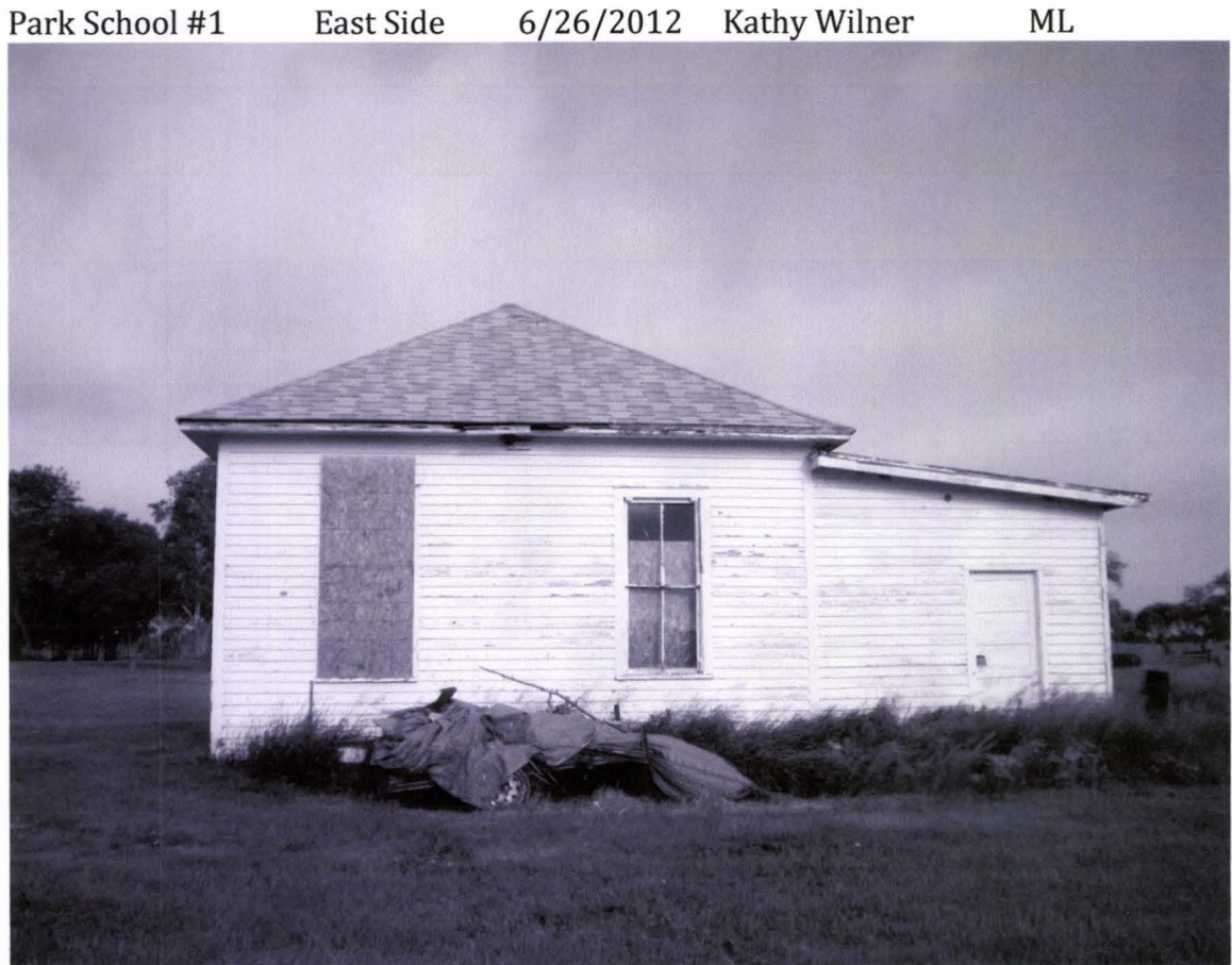
Park School #1 East Side 6/26/2012 Kathy Wilner ML