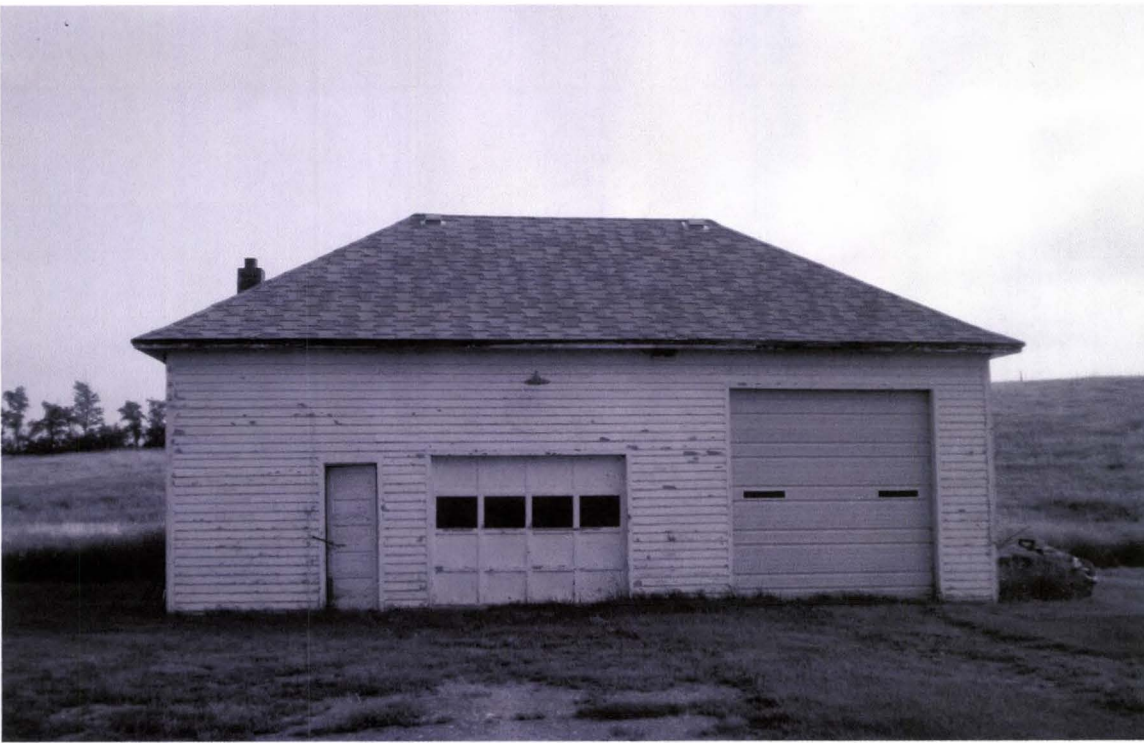
Park School #1 South Side 6/26/2012 Kathy Wilner ML