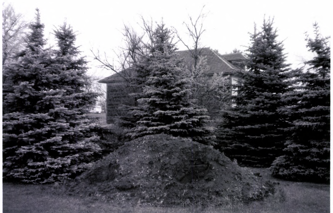
Snow Twsp School #1 West Side 06/01/2012 Kathy Wilner ML