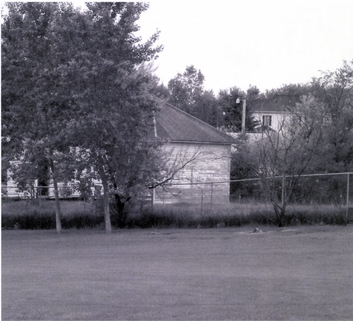
Snow Twsp. School #1 North Side 06/01/2012 Kathy Wilner ML