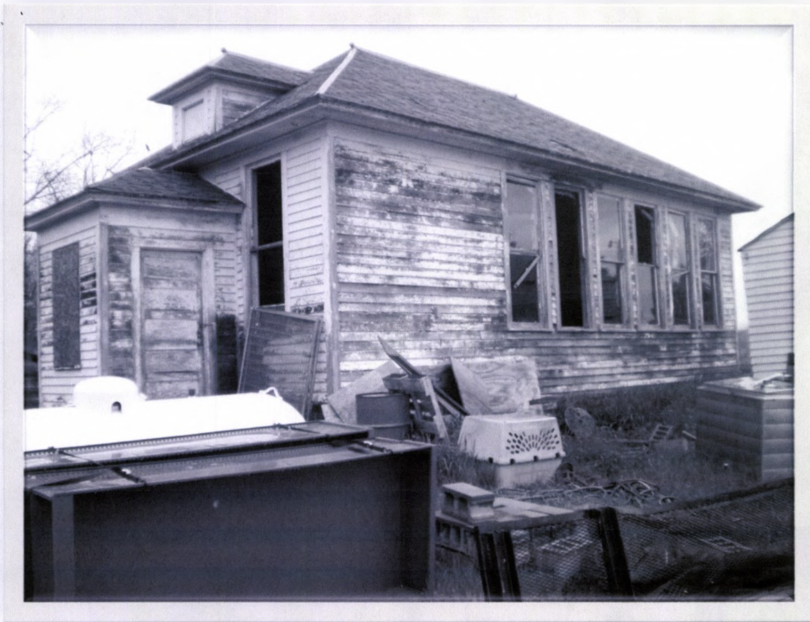
Snow Twsp School #1 East Side 6/01/2012 Kathy Wilner ML