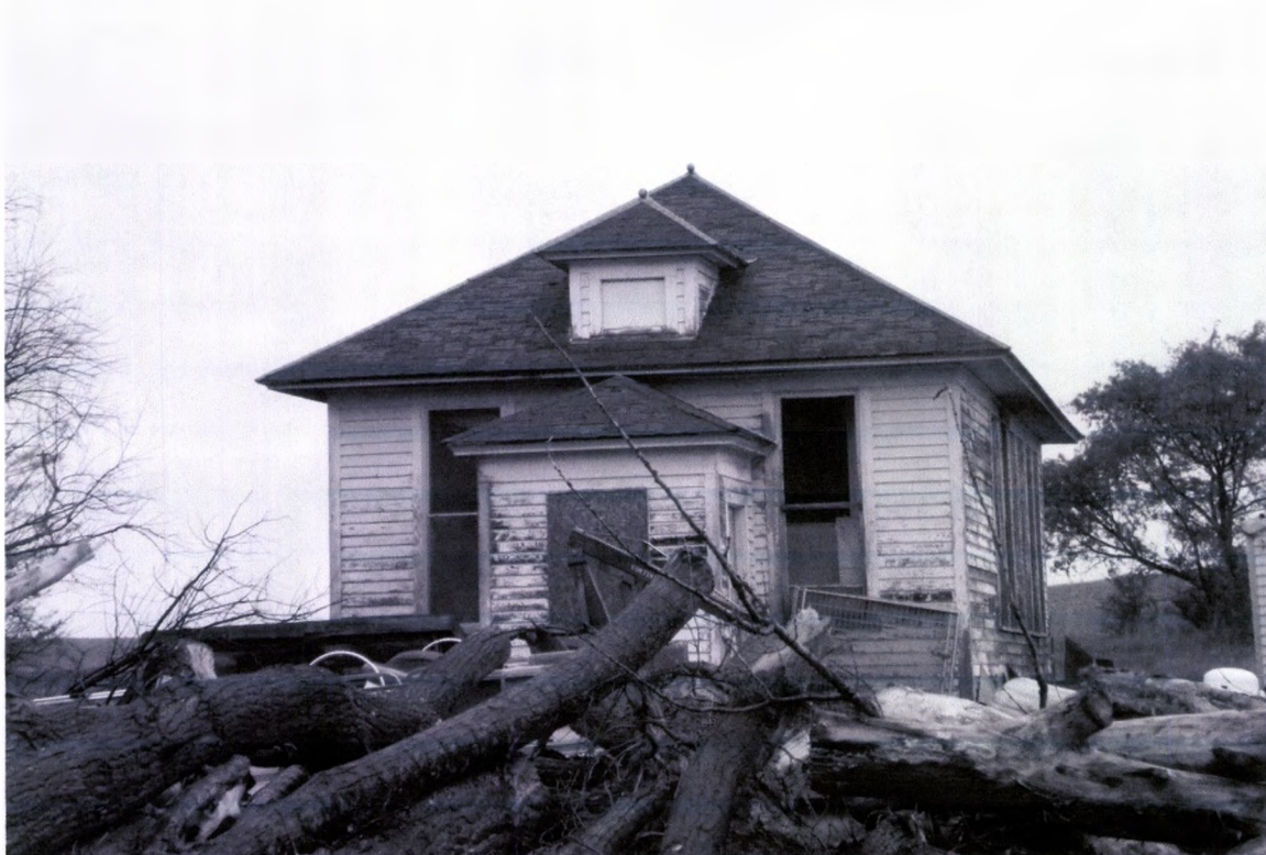
Snow Twsp School #1 South Side 6/01/2012 Kathy Wilner ML