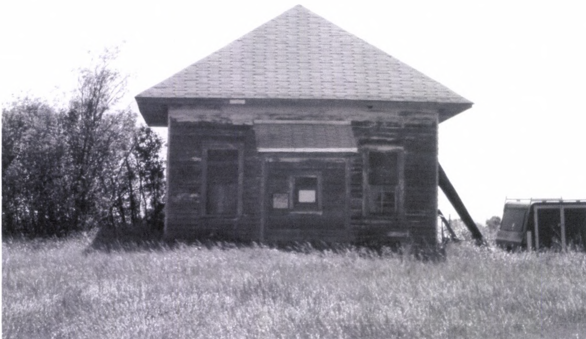
Butte Twsp. School West Side 06/14/2012 Kathy Wilner ML