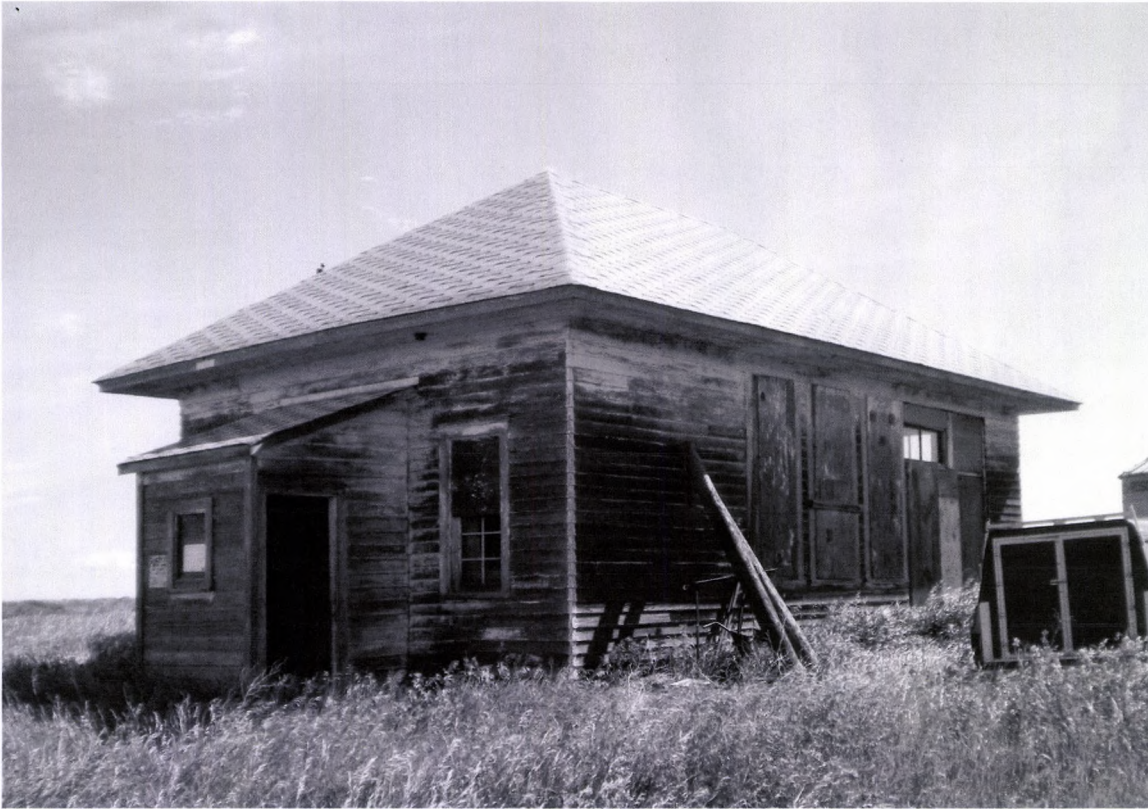
Butte Twsp. School South Side 06/14/2012 Kathy Wilner ML