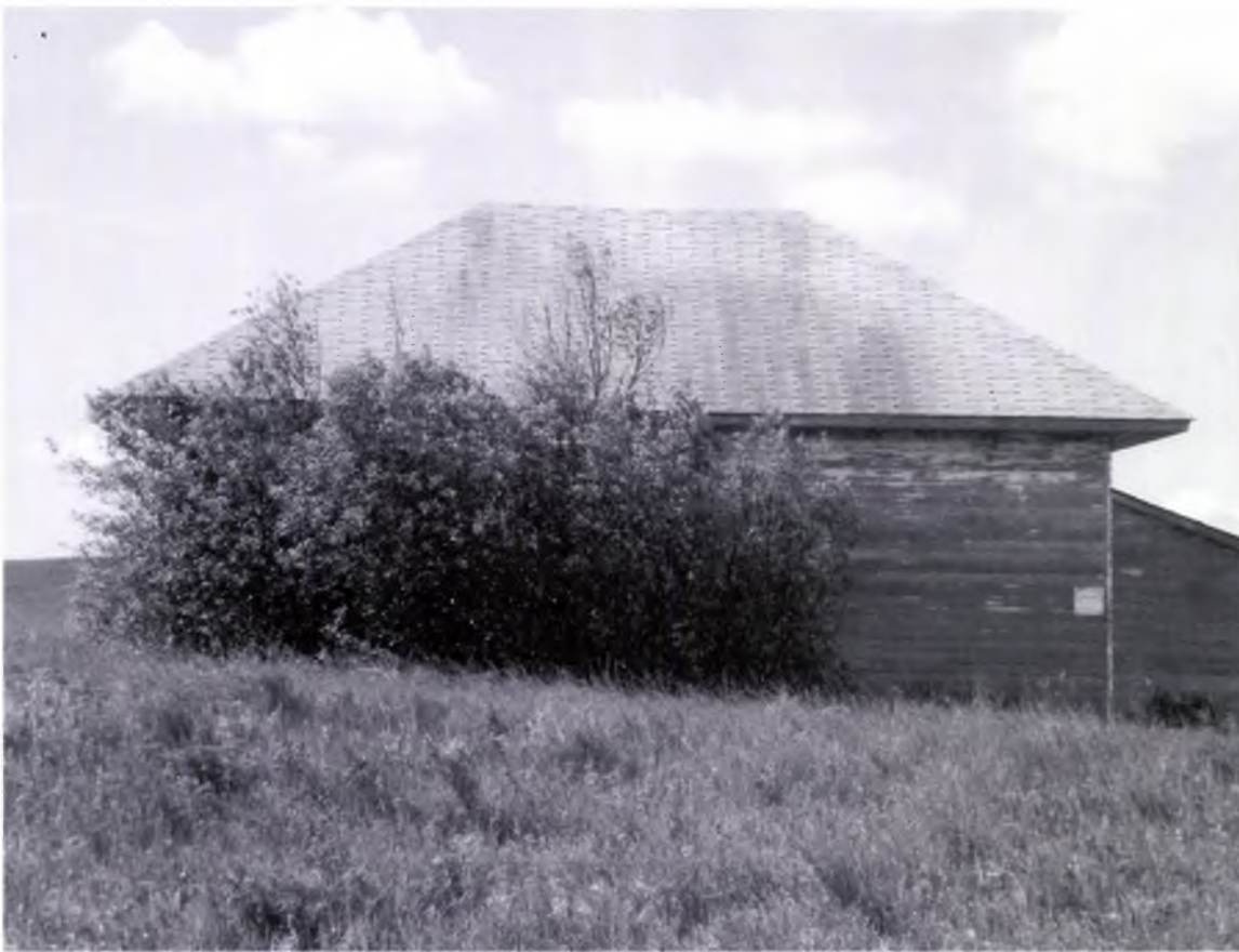
Butte Twsp. School North Side 06/14/2012 Kathy Wilner ML