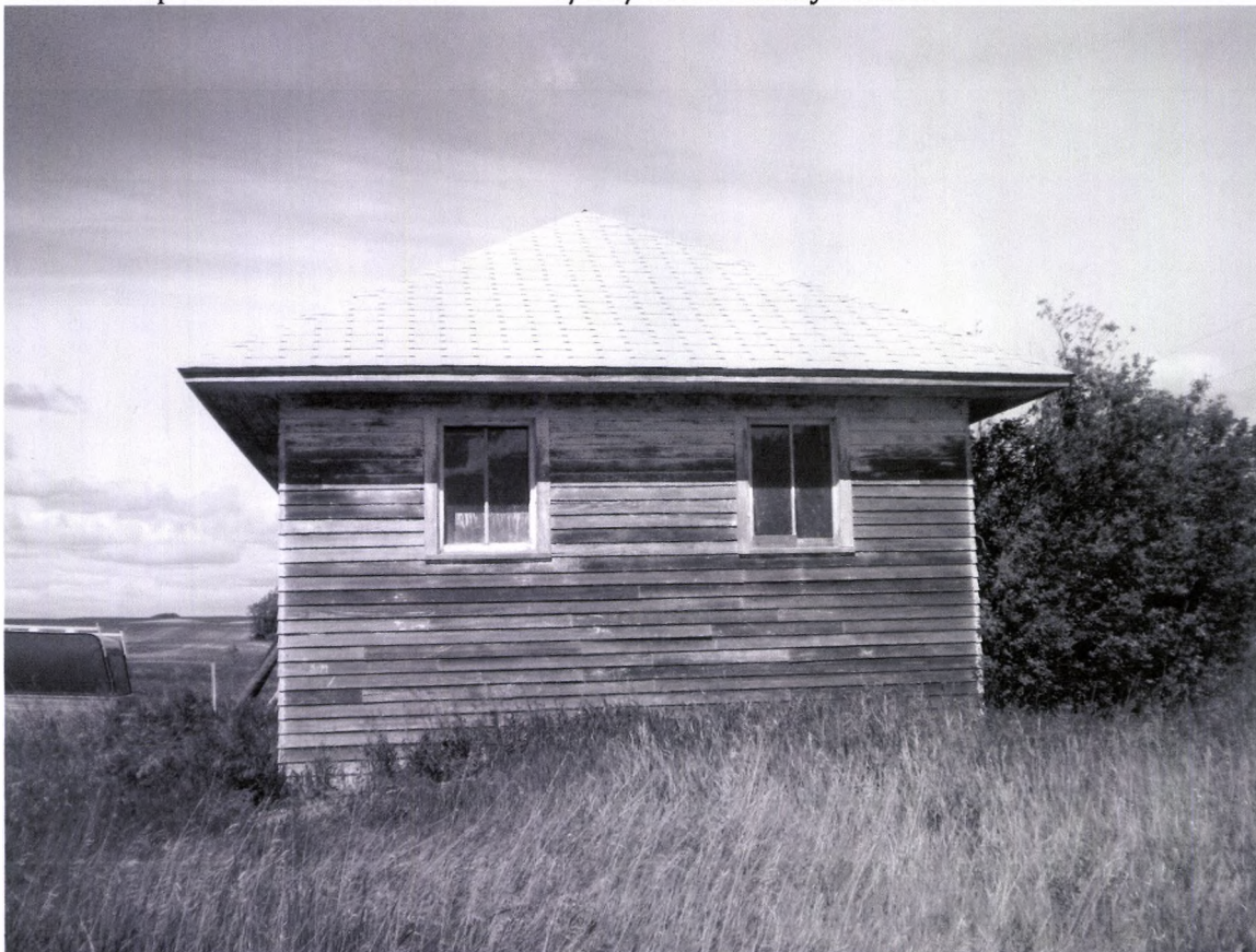
Butte Twsp. School East Side 06/14/2012 Kathy Wilner ML