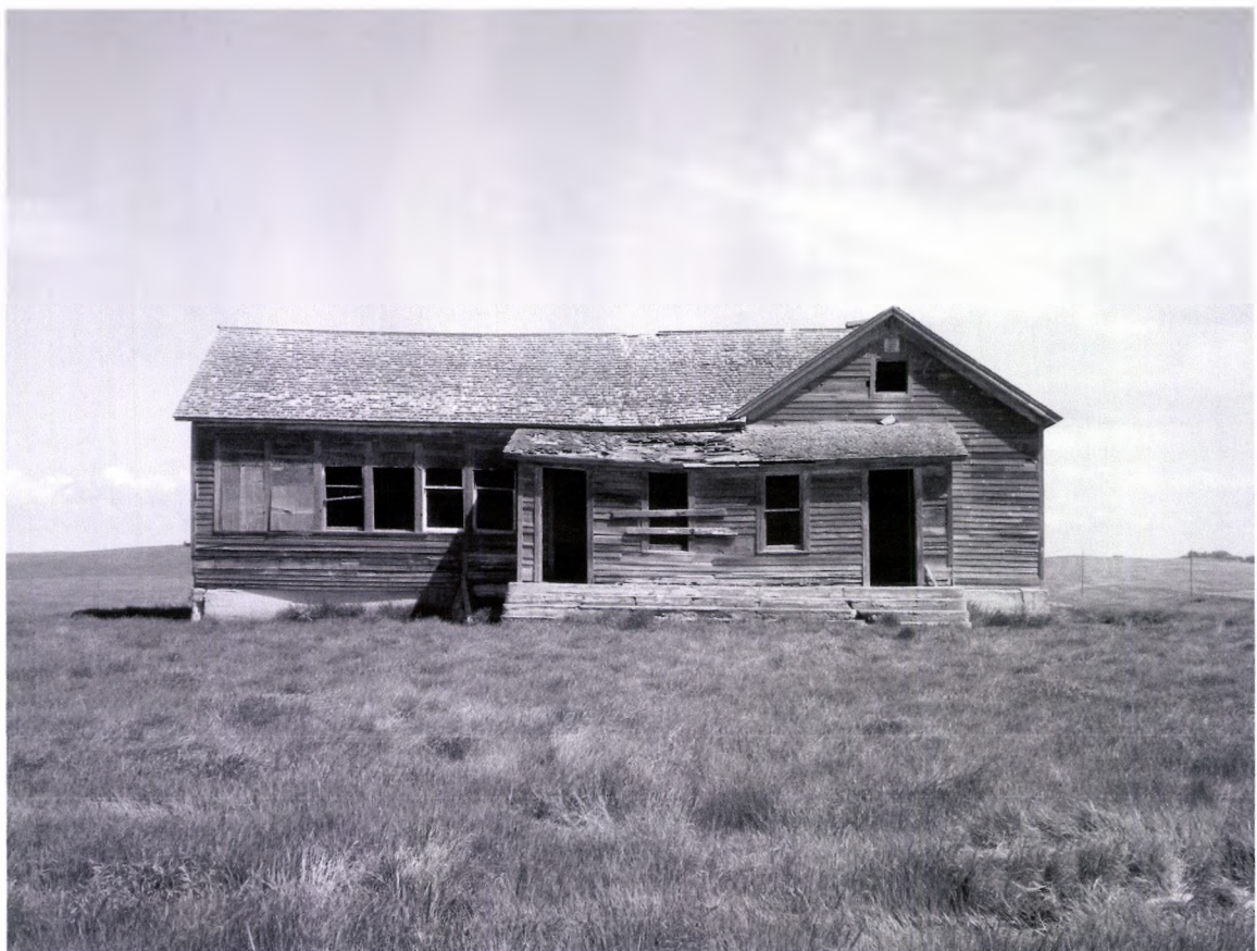
Crystal School South Side 06/01/2012 Kathy Wilner ML