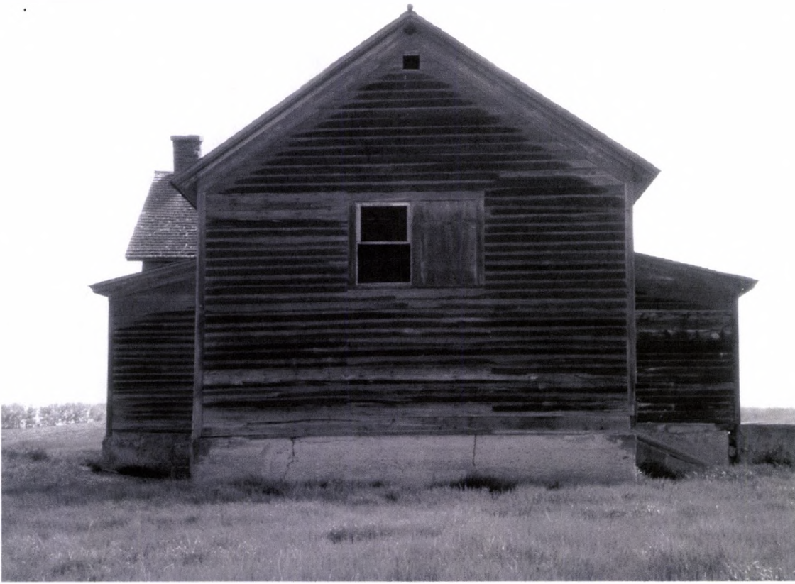
Crystal School West Side 06/01/2012 Kathy Wilner ML