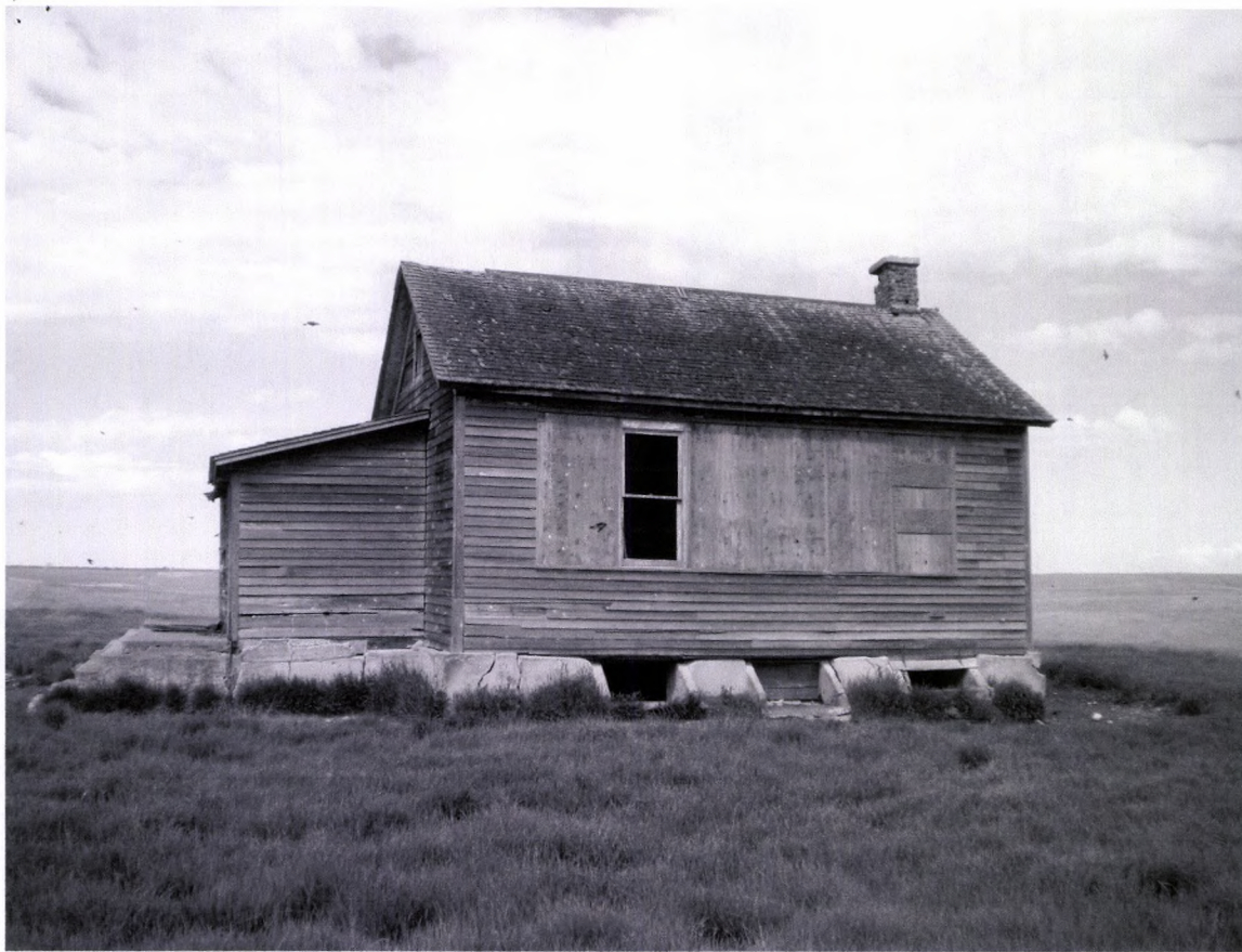
Crystal School East Side 06/01/2012 Kathy Wilner ML