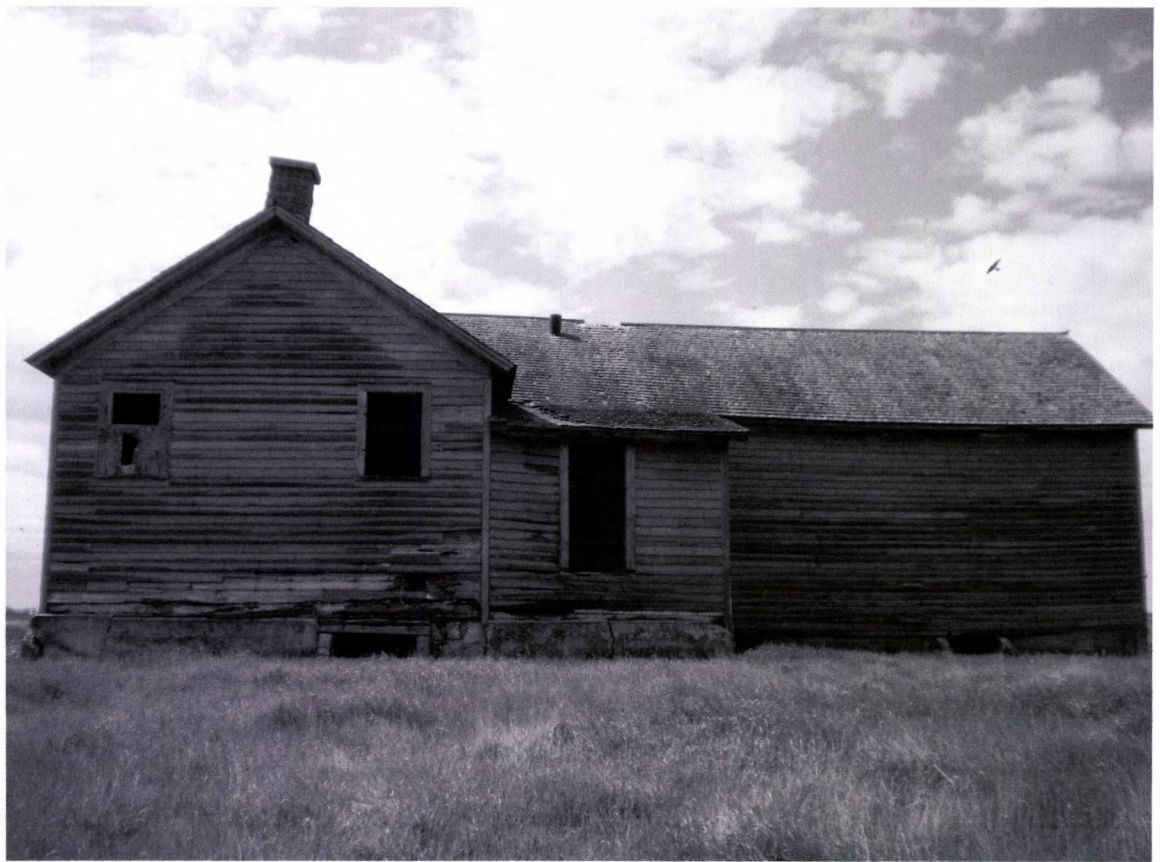
Crystal School North Side 06/01/2012 Kathy Wilner ML