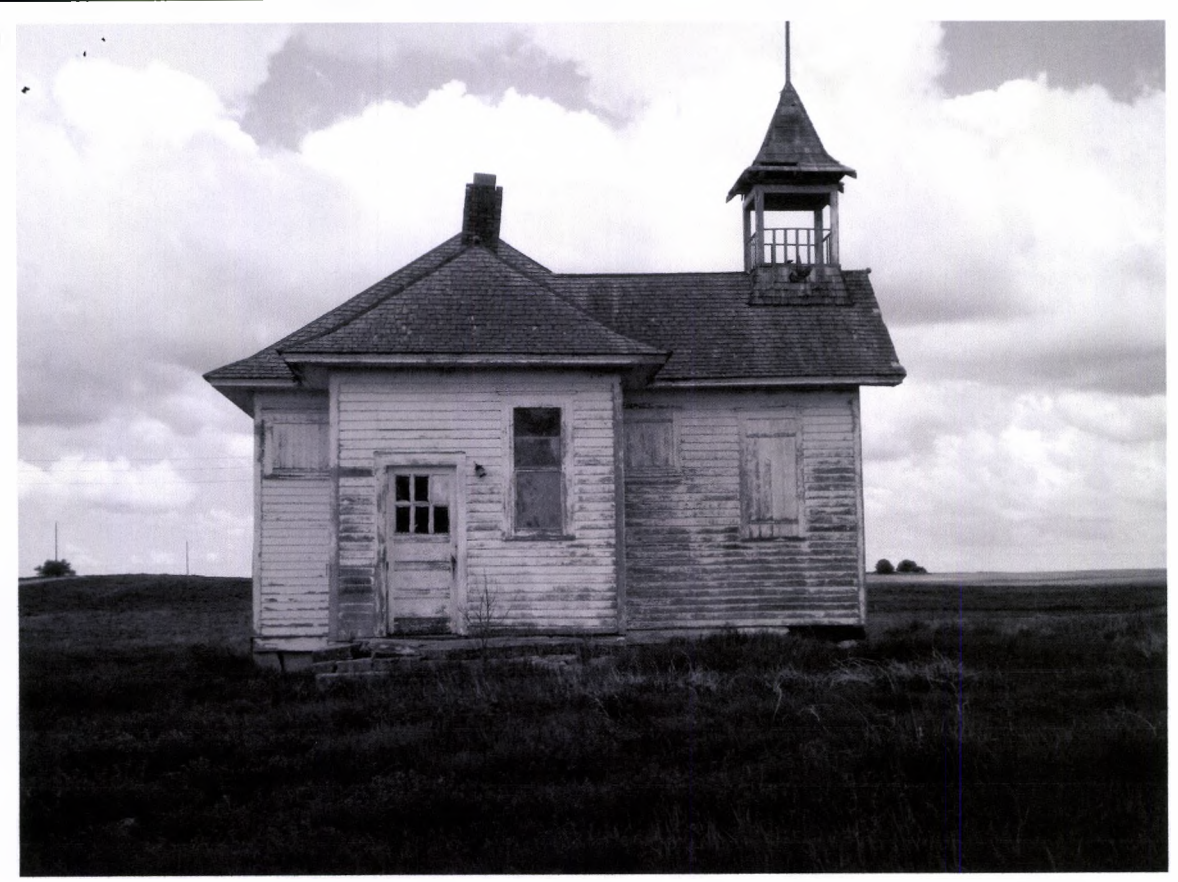
Douglas School #3 East Side 06/01/2012 Kathy Wilner ML