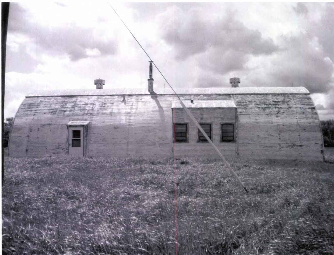
Blue Hill School North Side 06/01/2012 Kathy Wilner ML