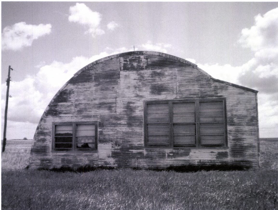
Blue Hill School West Side 06/01/2012 Kathy Wilner ML