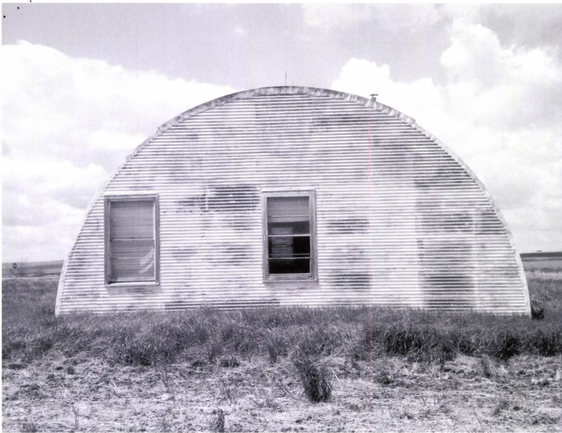
Blue Hill School East Side 06/01/2012 Kathy Wilner ML