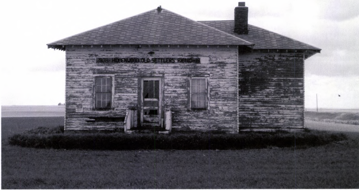
Hidden Wood School North Side 06/01/2012 Kathy Wilner ML