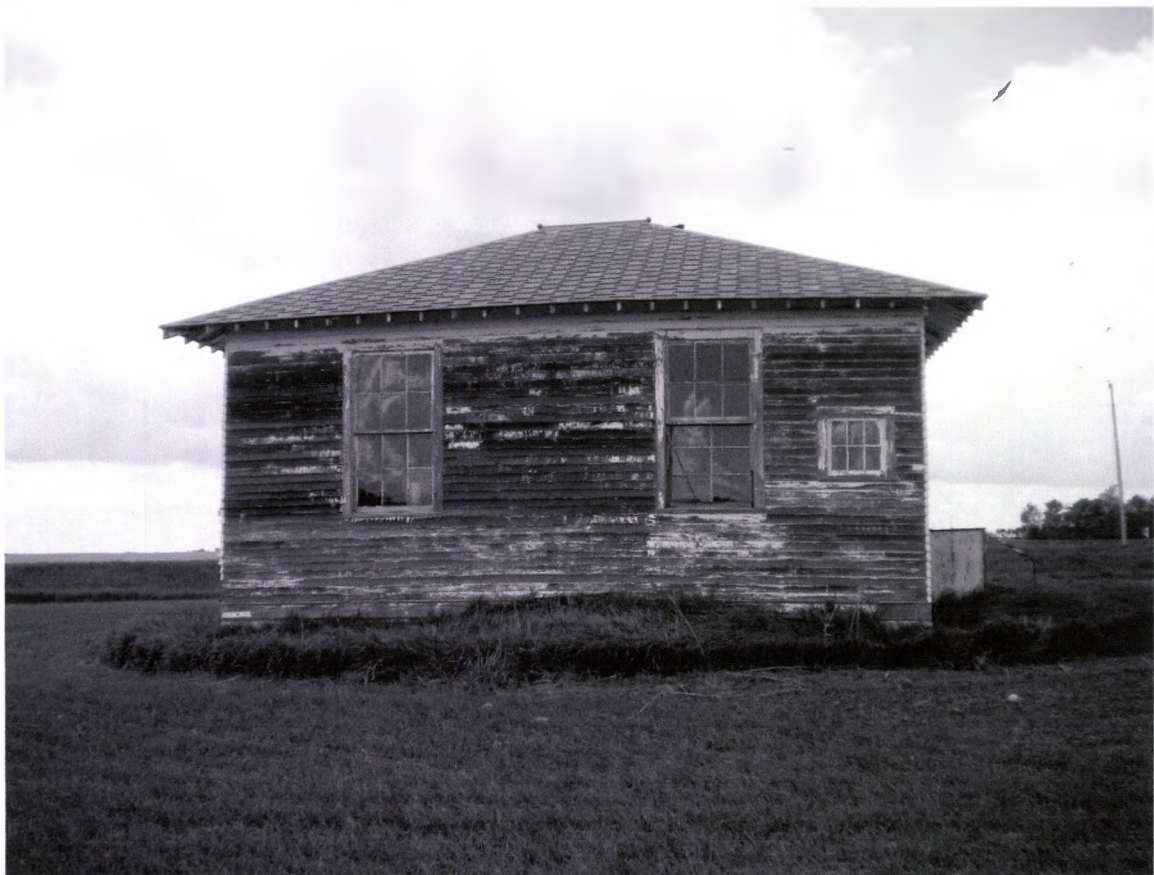
Hidden Wood School East Side 06/01/2012 Kathy Wilner ML