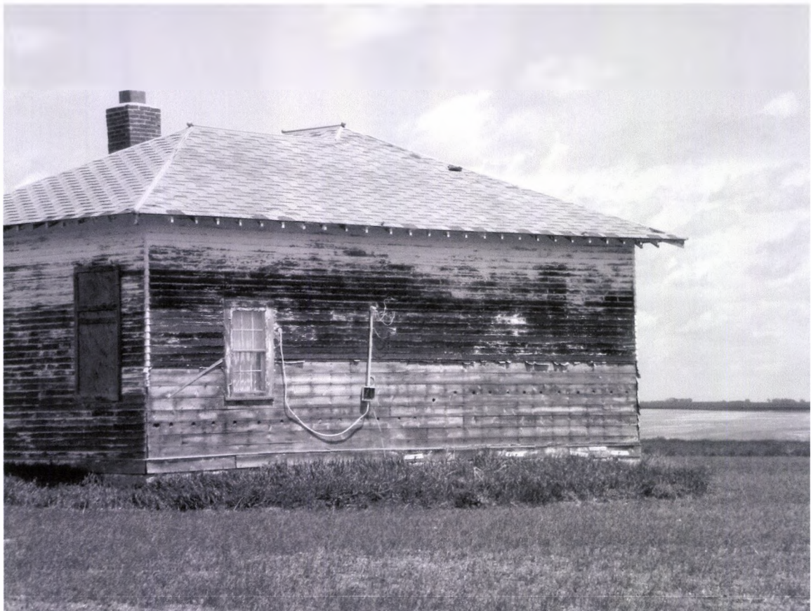
Hidden Wood School South Side 06/01/2012 Kathy Wilner ML