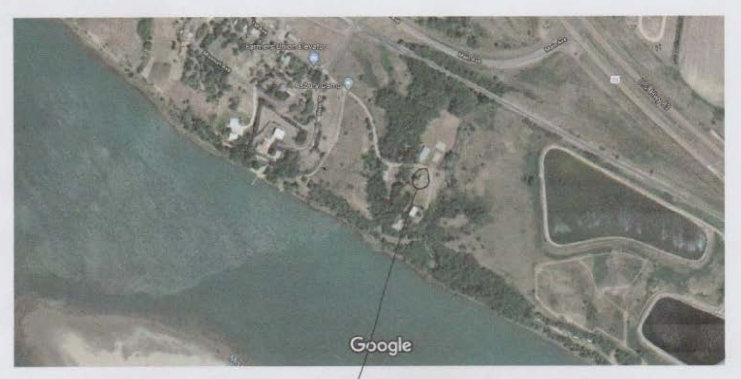
Imagery ©2021 CNES / Airbus, Maxar Technologies, USDA Farm Service Agency, Map data 200 ft ©2021