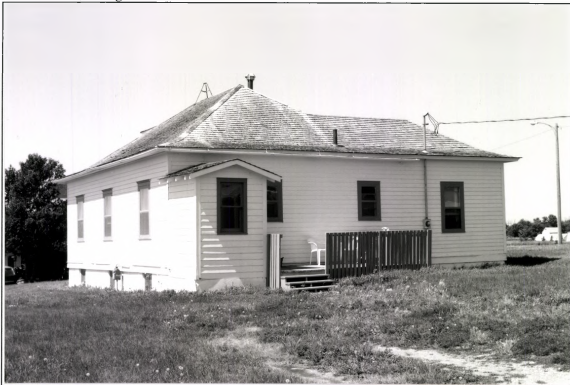
Old Schoolhouse, facing NW

Include direction facing, feature number, and photo caption for each submitted photograph.