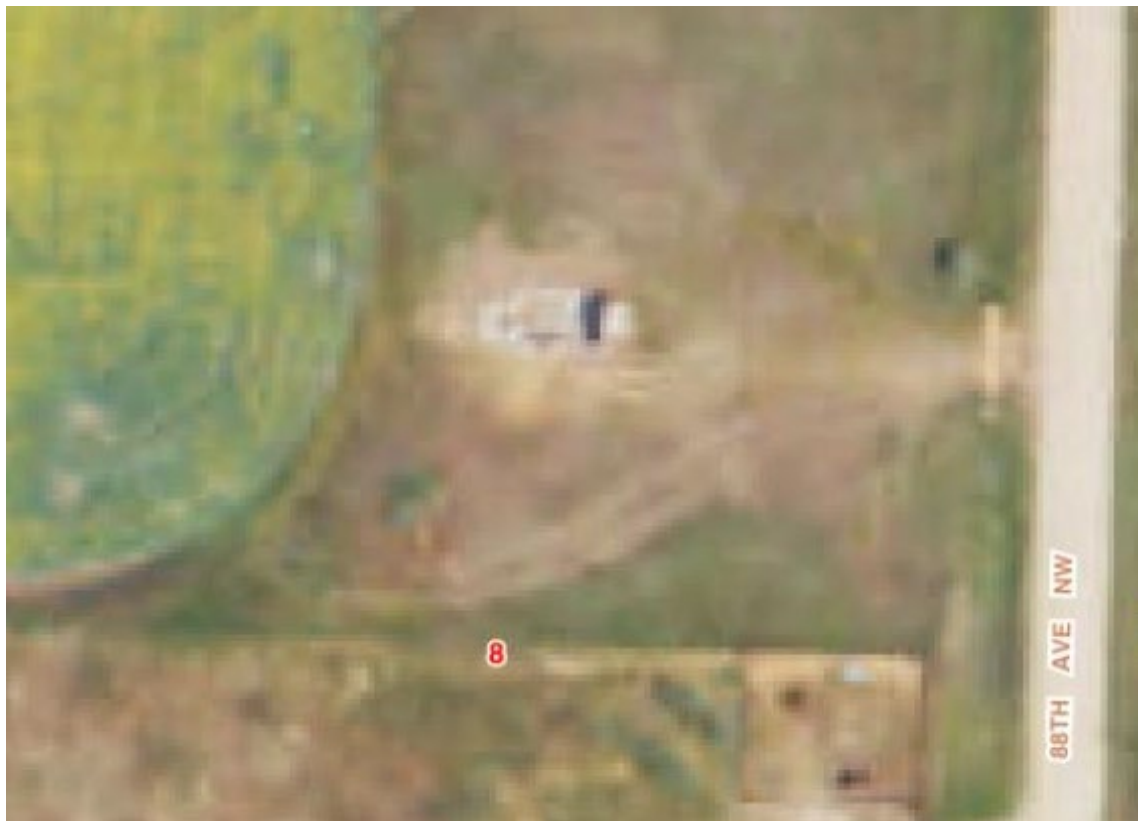
Figure 2: 2023 aerial imagery depicting what appears to be a foundation.

Recorded By: E. Scherr, SHSND Date Recorded: 3/21/2024