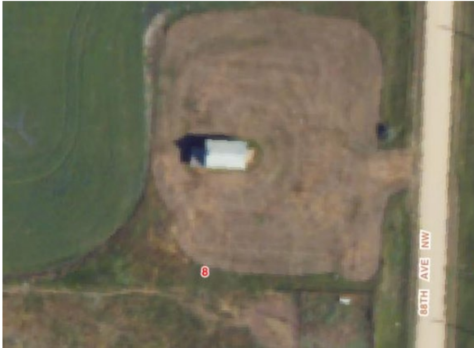
Figure 1: 2022 aerial image.