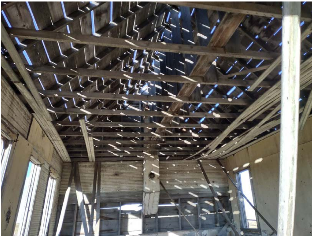
Figure 6: Interior of Sikes Township Schoolhouse ceiling and rafters, view to the north.