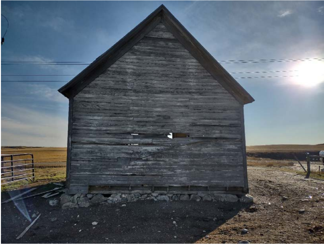
Figure 3: Overview of Sikes Township Schoolhouse, north elevation.