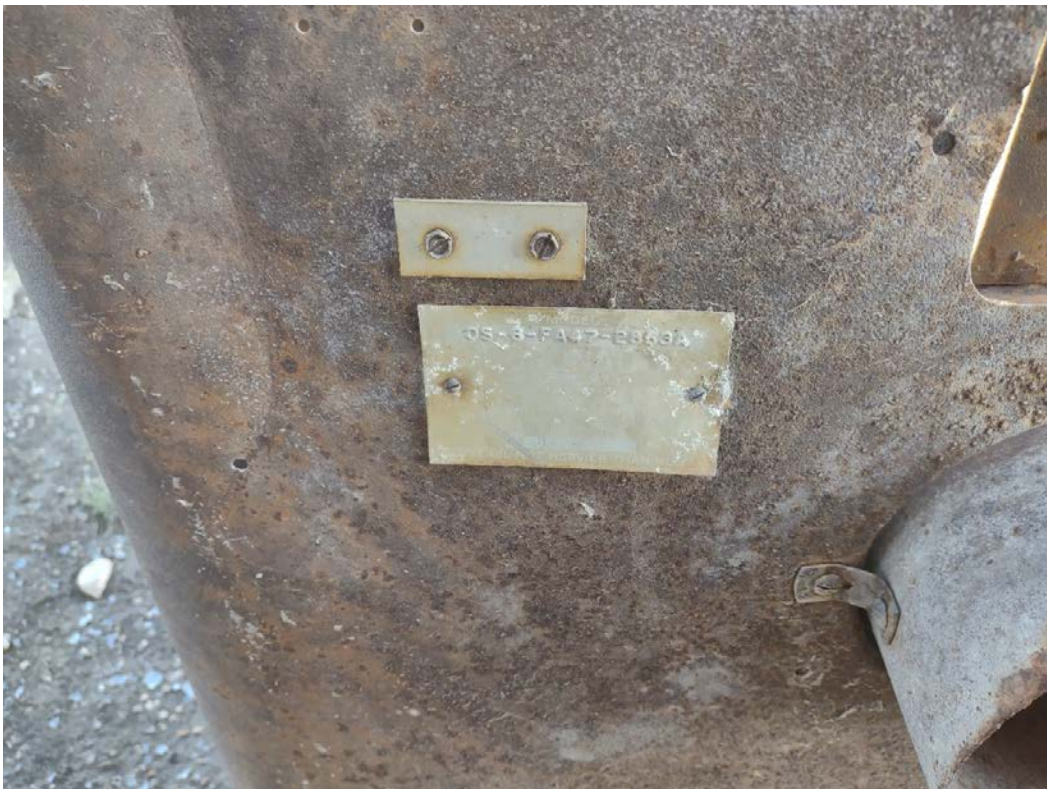
Figure 8: Detail of model number on stove.