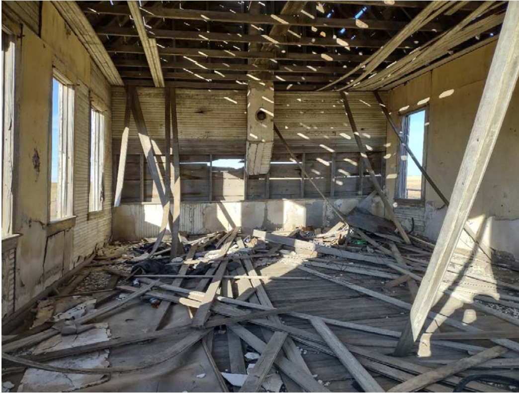
Figure 5: Interior of Sikes Township Schoolhouse, view to the north.