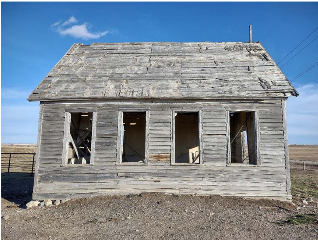
Figure 2: Overview of Sikes Township Schoolhouse, west elevation.