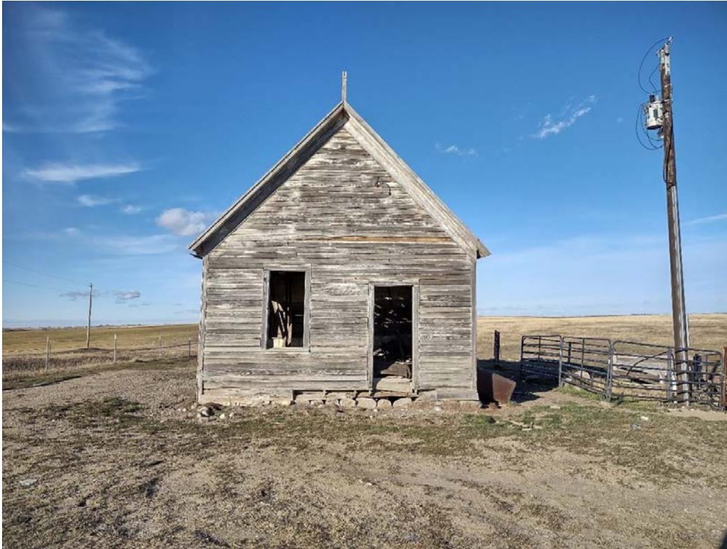
Figure 1: Overview of Sikes Township Schoolhouse, south elevation.