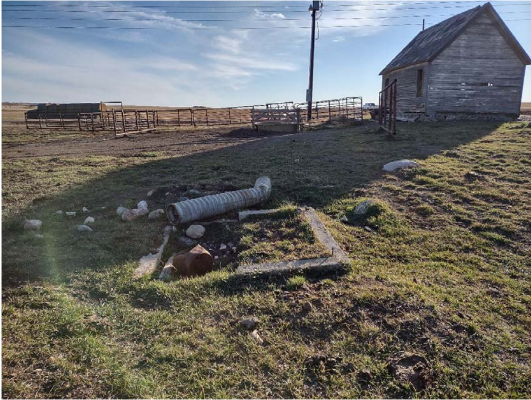
Figure 9: Overview of outhouse foundation, view to the south