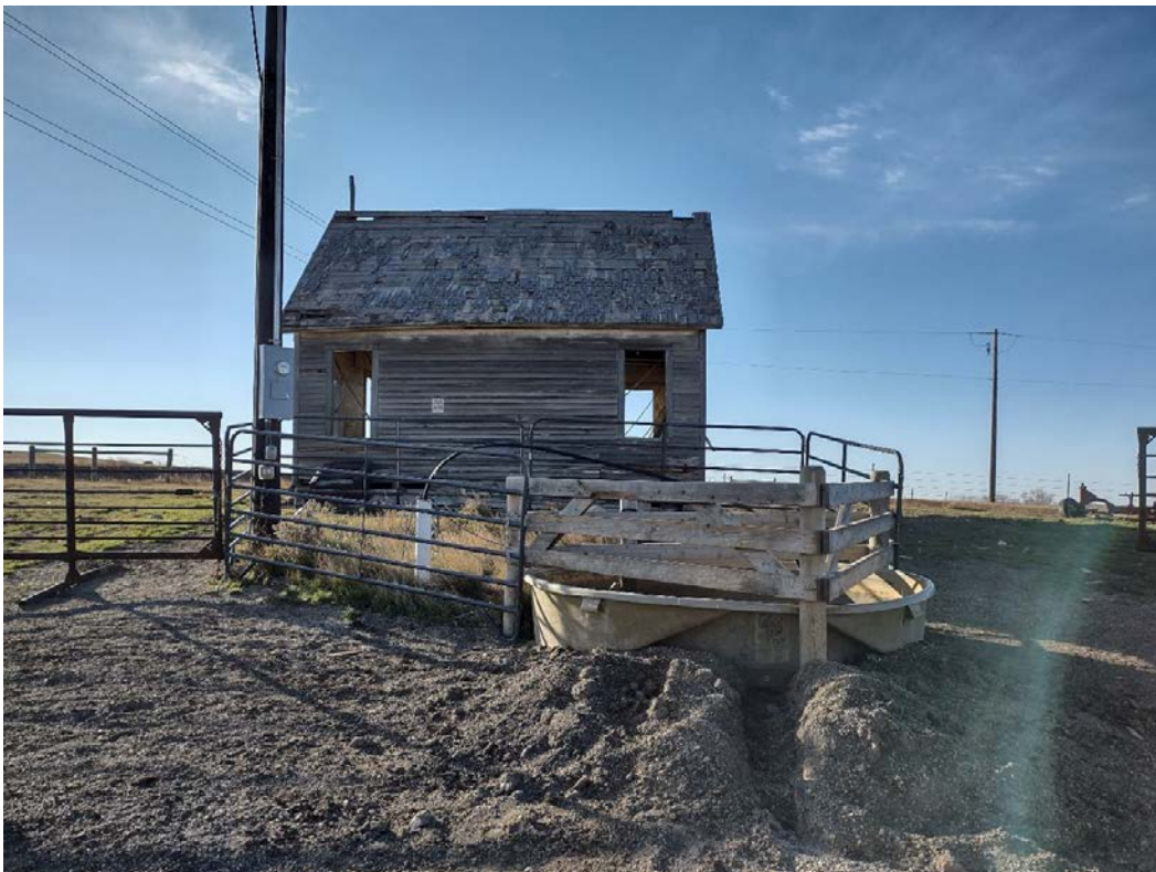
Figure 4: F Overview of Sikes Township Schoolhouse, east elevation.