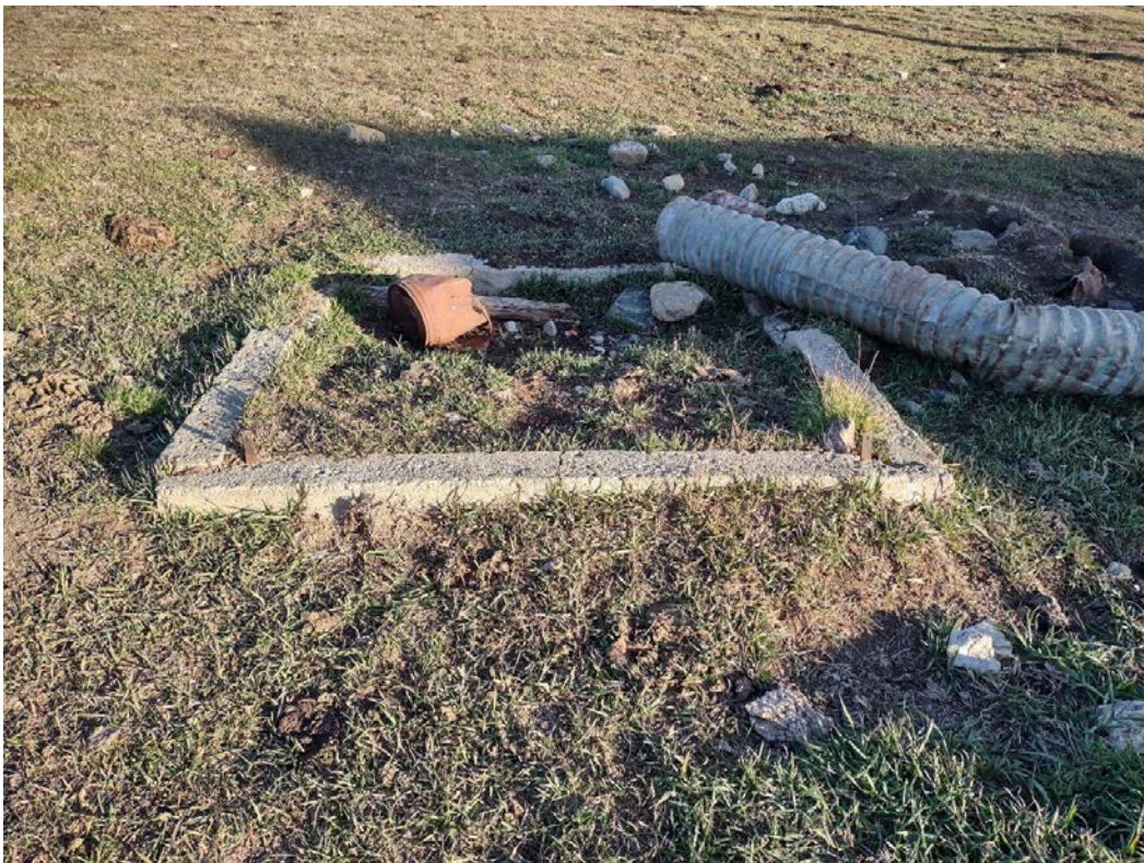
Figure 10: Overview of outhouse foundation, view to the east.