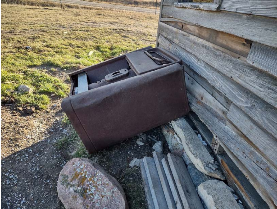
Figure 7: Stove leaning against south end of the east elevation, view to the south.