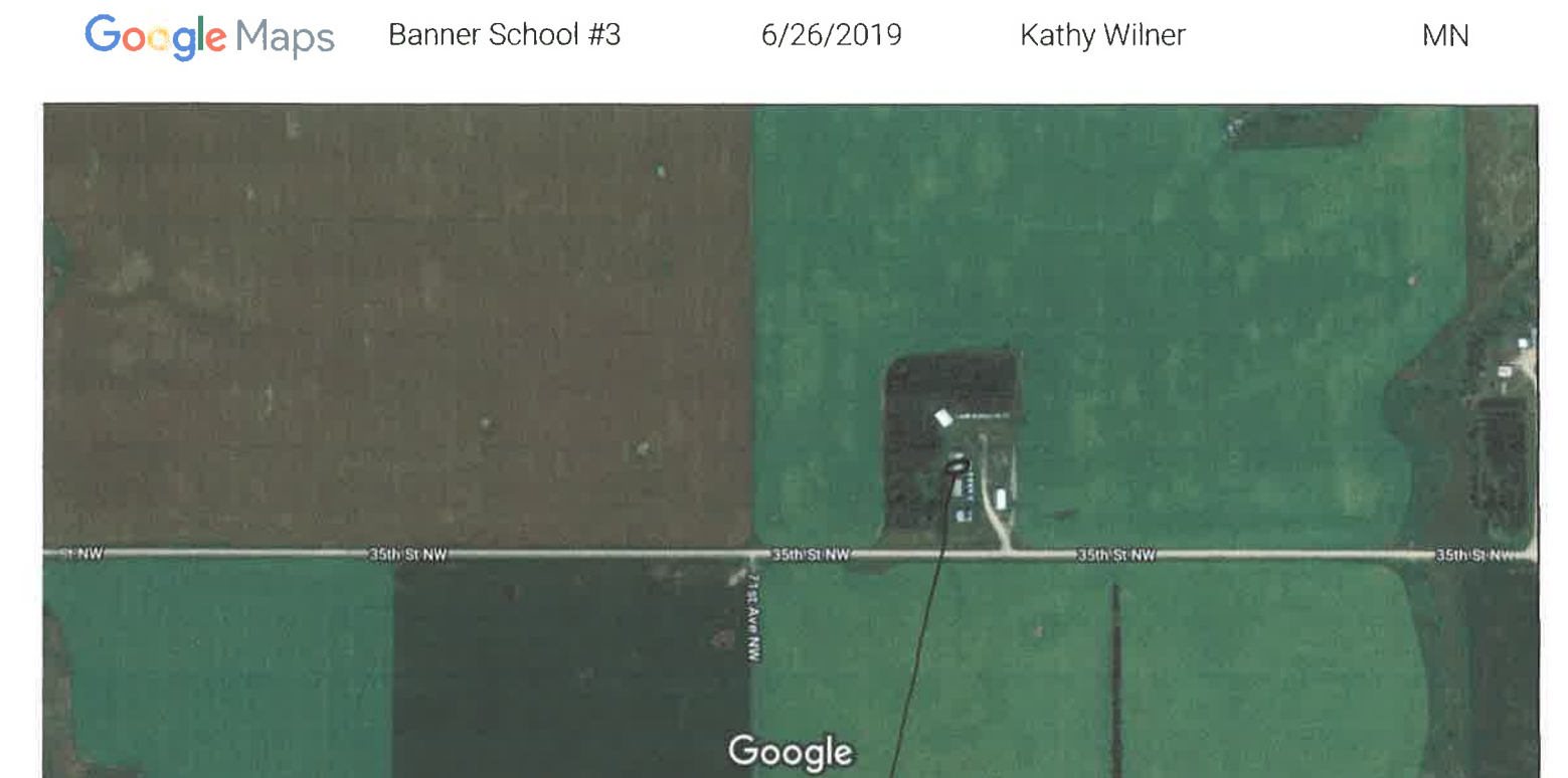
500 ft