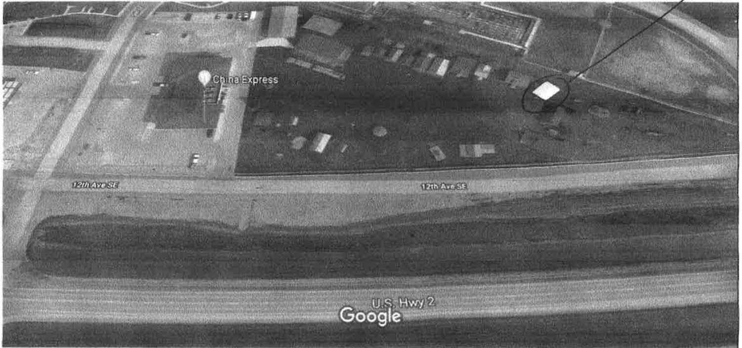
50 ft