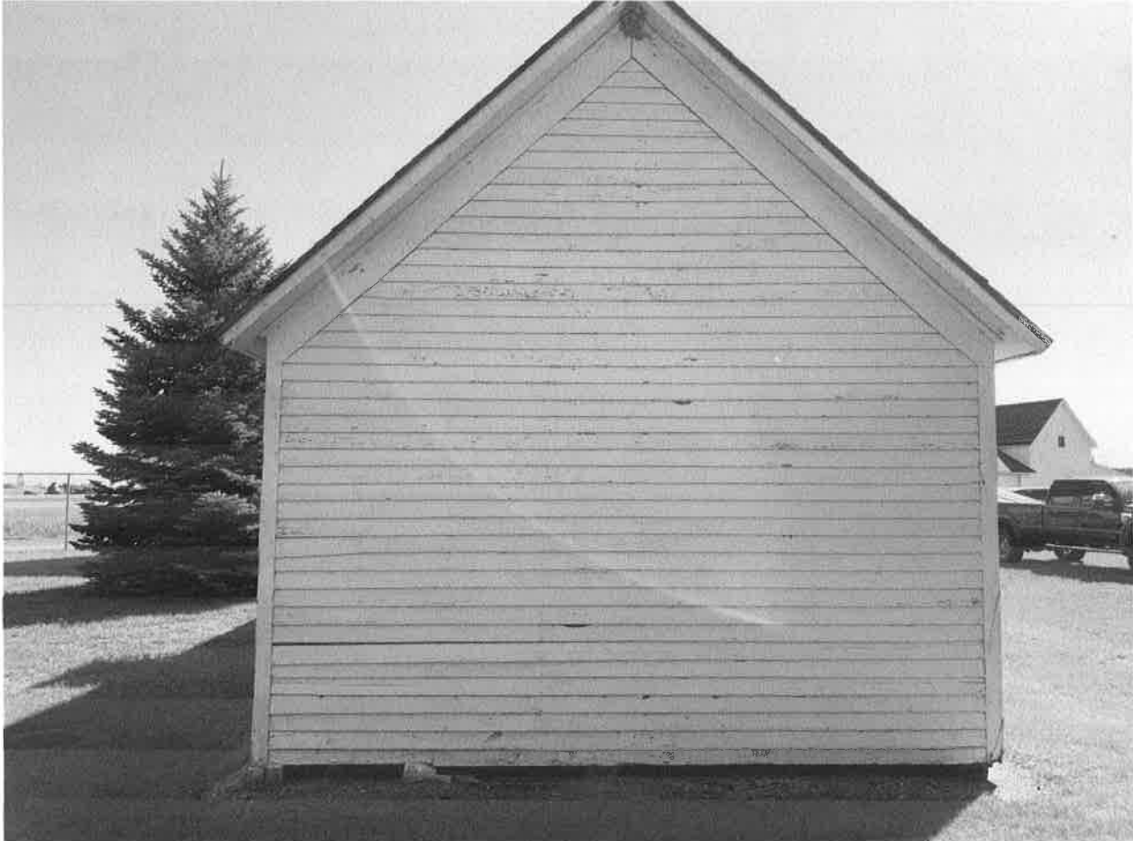
North- East side