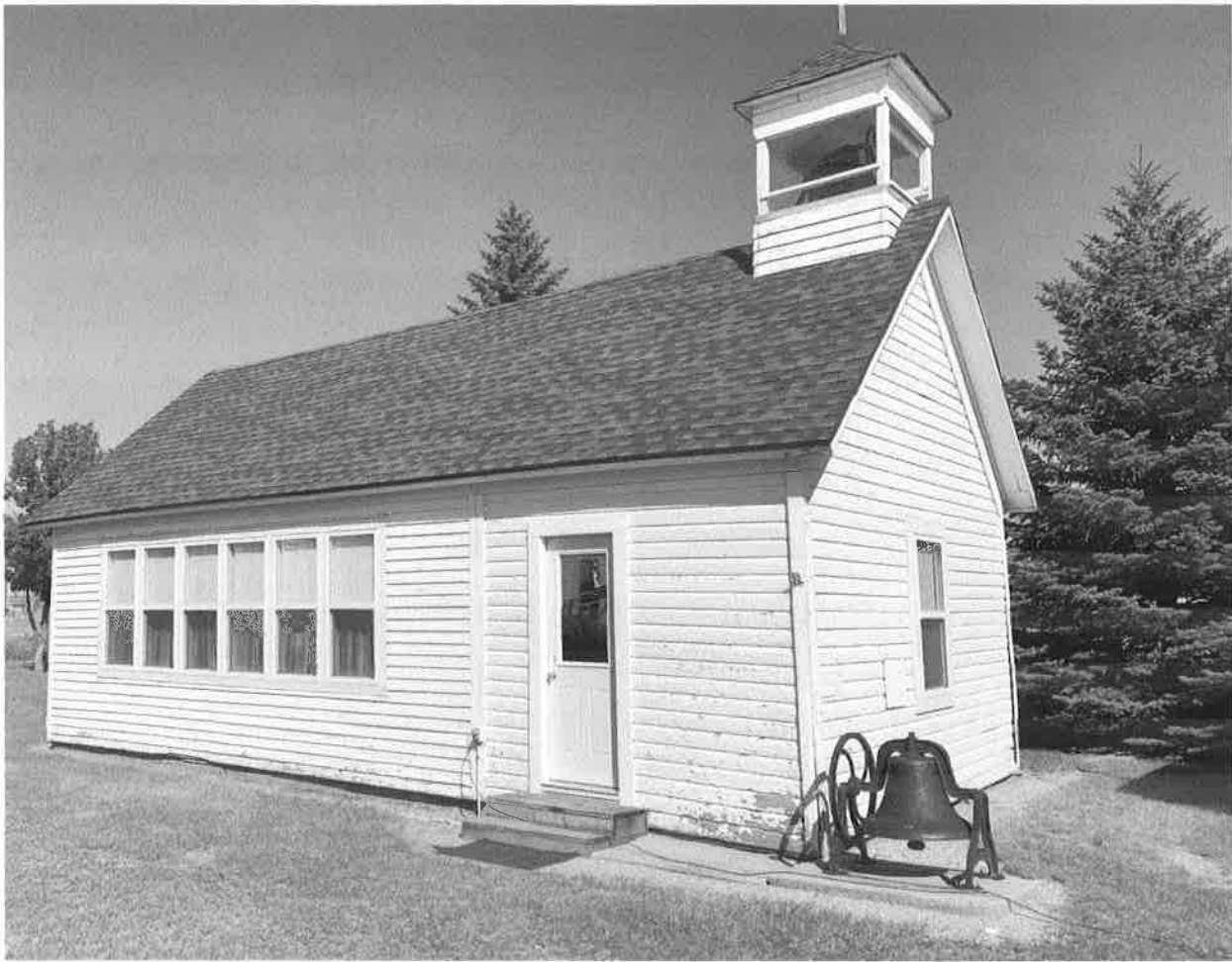
North- West Side