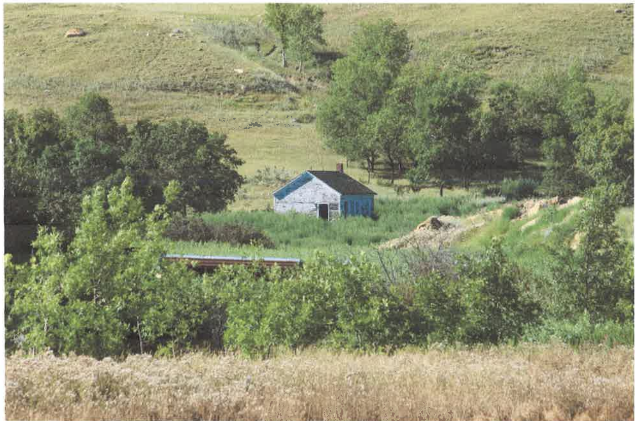
Overview of the site from the road south of the school.