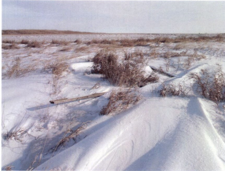
Figure 1: Site view East