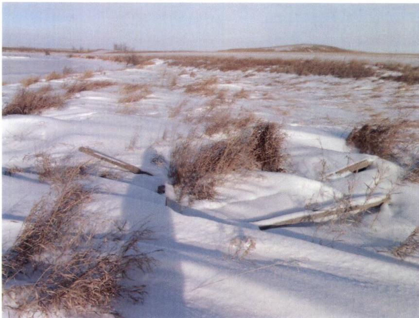
Figure 2: Site View North