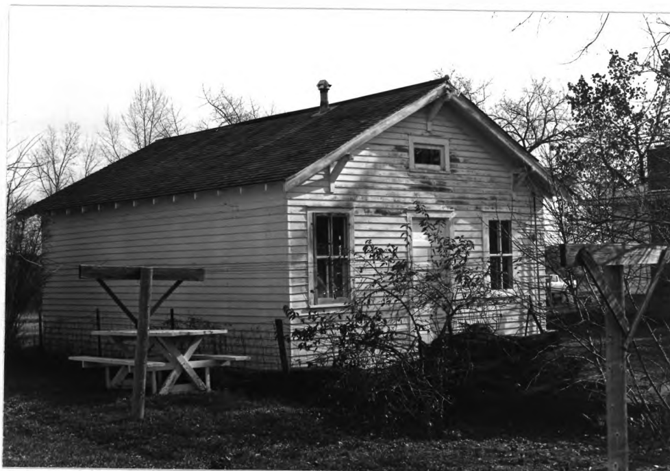
View from northwest