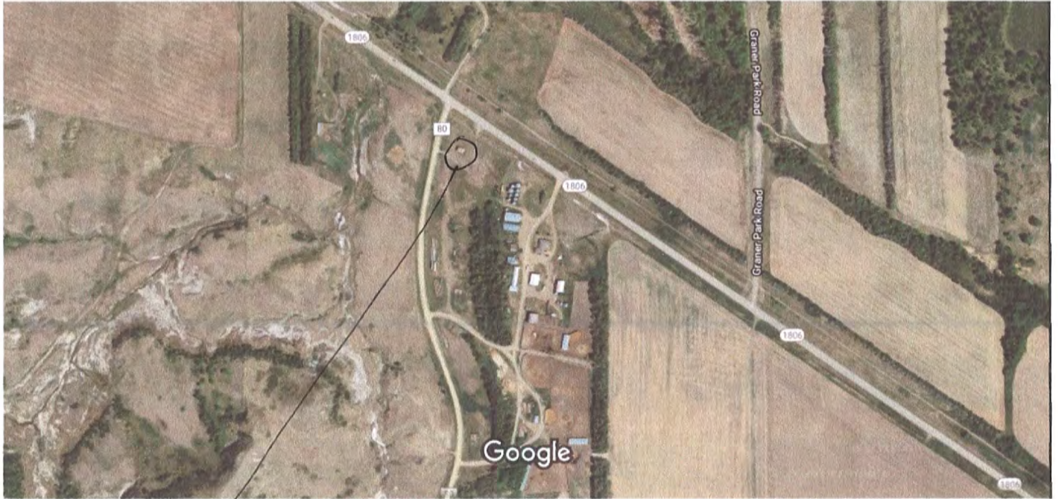
Imagery ©2019 Google, Map data ©2019 Google 500 ft