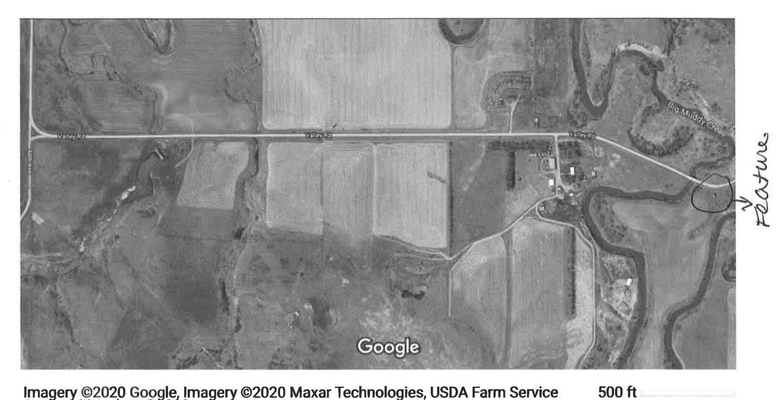
Imagery ©2020 Google, Imagery ©2020 Maxar Technologies, USDA Farm Service Agency, Map data ©2020