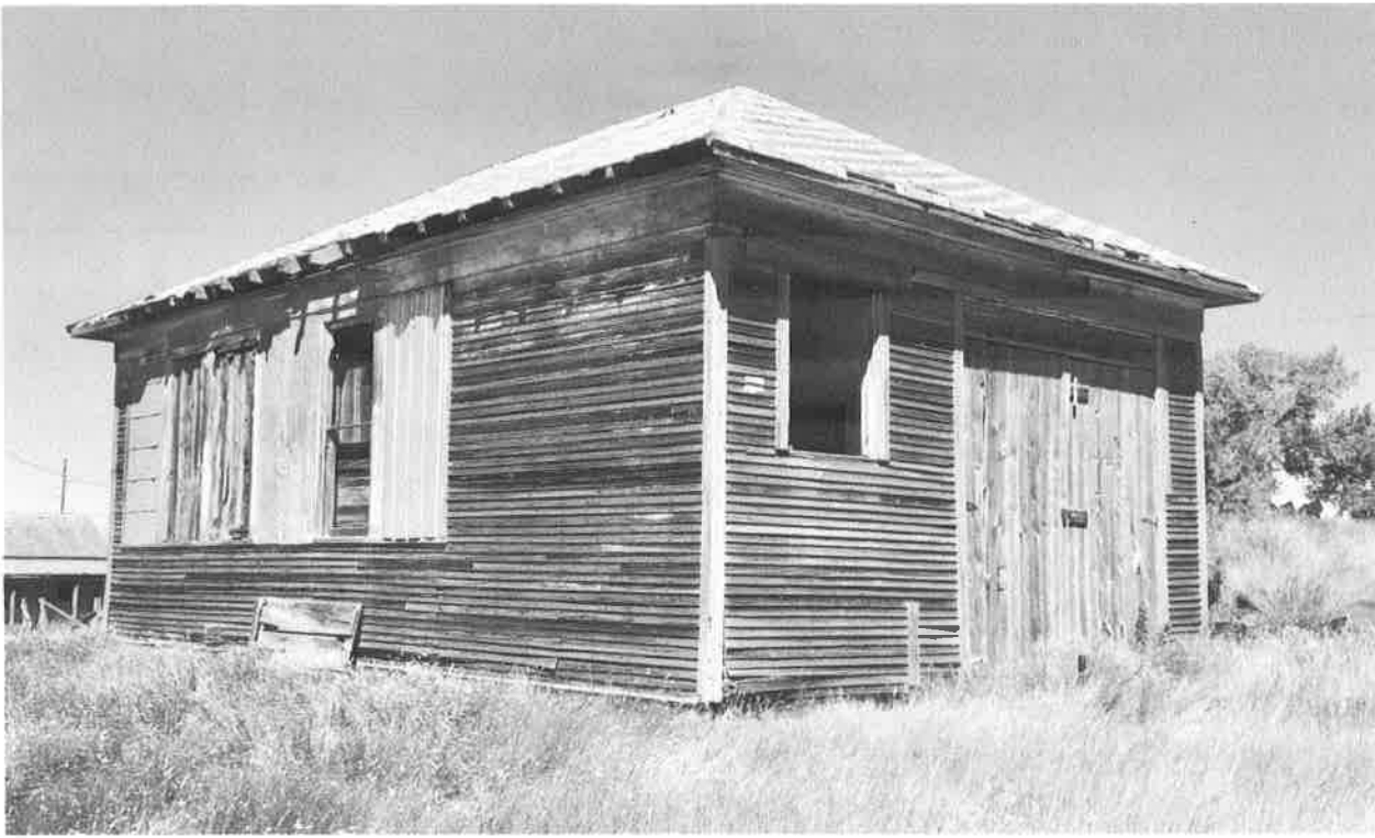
South Side (Windows wall)